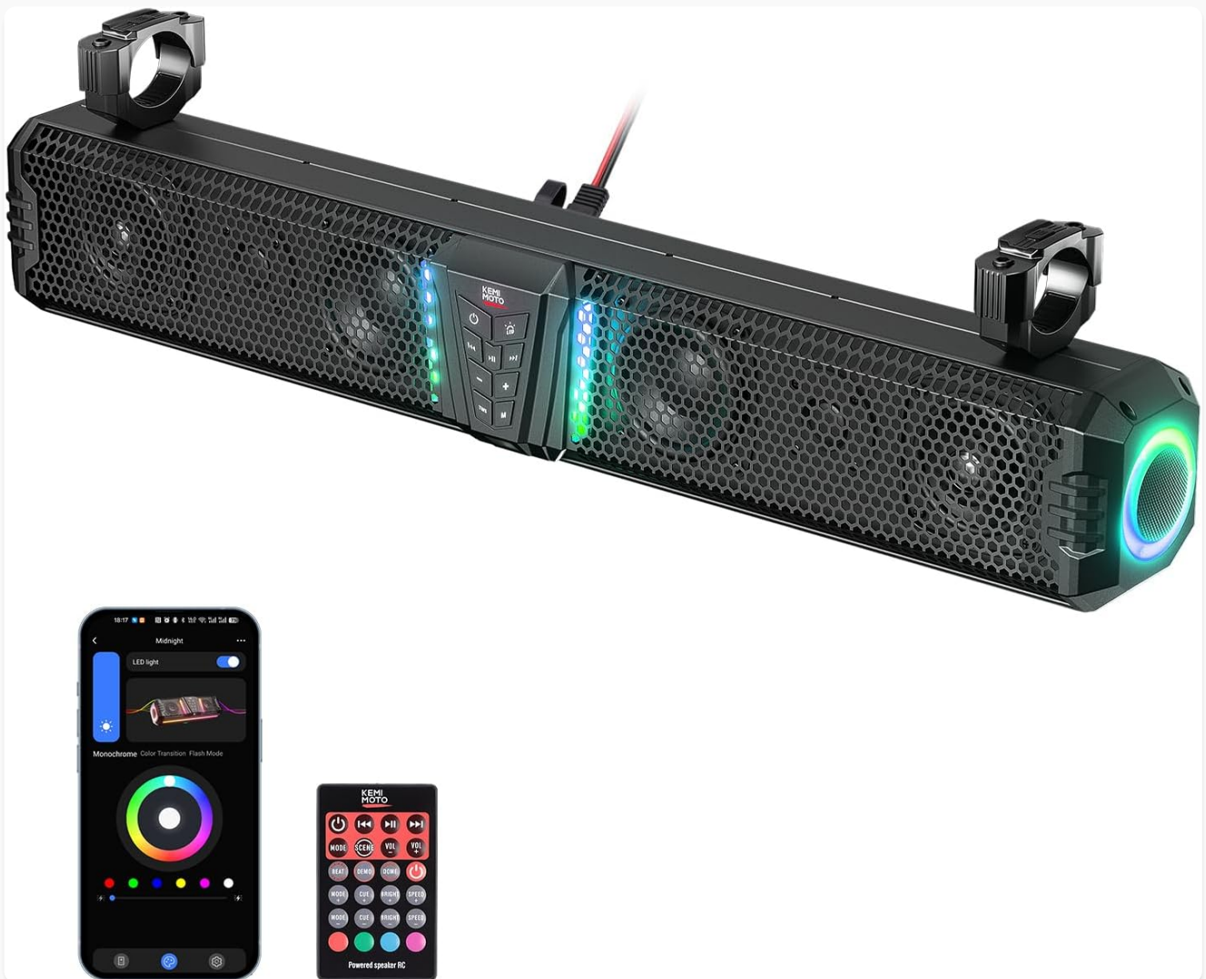
Image: KEMIMOTO Midnight 80 32-inch UTV Sound Bar, showing the main unit, remote control, and smartphone app interface.

The KEMIMOTO Midnight 80 sound bar features a sophisticated design with integrated controls and multiple connectivity options.