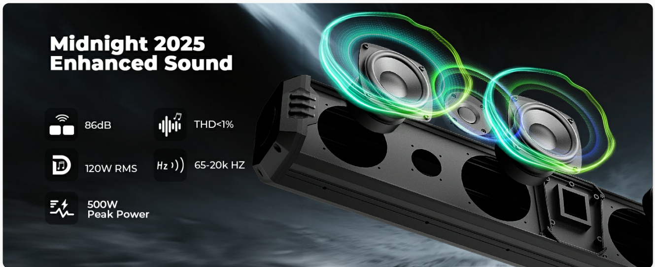
Image: Internal view of the KEMIMOTO Midnight 80 sound bar, highlighting the 6-speaker configuration (woofers, tweeters, mid-range).