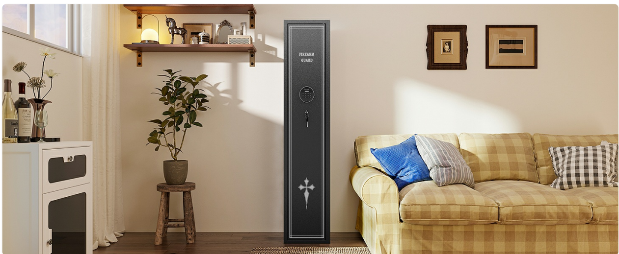
Image 2: Visual guide for easy installation on a wall or floor using the provided expansion bolts.

Video 1: A step-by-step guide on how to assemble the gun safe, including panel attachment and interior setup.