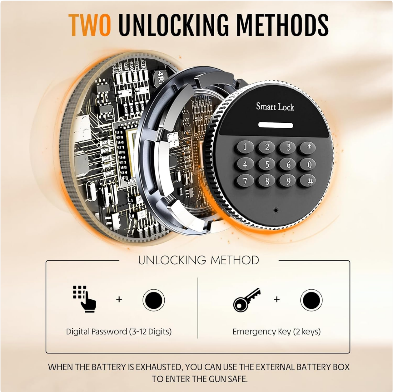
Image 3: The smart lock keypad and the hidden keyhole for manual access.

Your KAER gun safe offers two primary unlocking methods: electronic keypad and traditional key access.