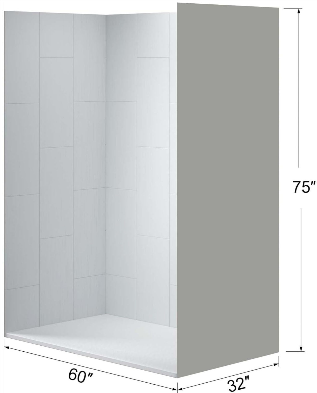
Image: Dimensional diagram of the shower kit, illustrating the 60" L x 32" W x 75" H measurements for planning and installation.