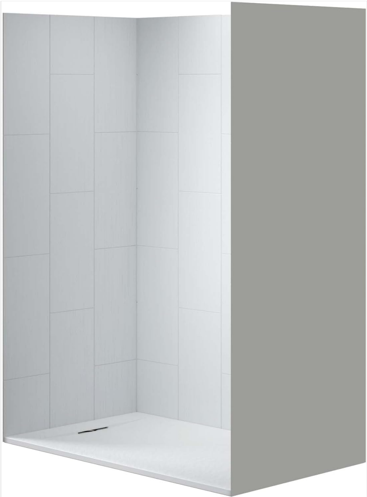
Image: Side view of the complete shower kit, showing the back and side panels with the shower base.