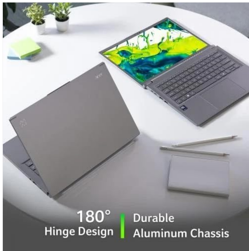
Image 5.1: The laptop's 180-degree hinge design and durable aluminum chassis.