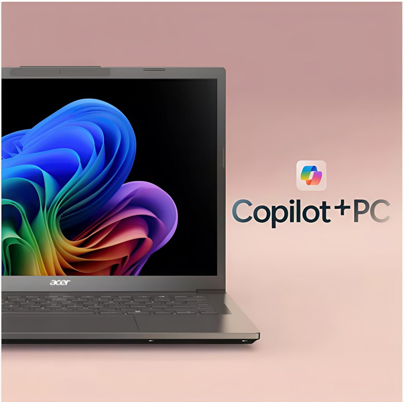
Image 4.2: The Copilot+PC branding on the laptop screen, indicating advanced AI capabilities.