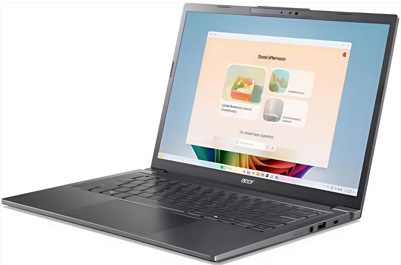
Image 1.1: The acer Aspire Laptop, showcasing its sleek design and display.

This user manual provides essential information for the proper setup, operation, maintenance, and troubleshooting of your new acer Aspire Laptop. Please read this manual thoroughly before using your device to ensure optimal performance and longevity. Keep this manual for future reference.