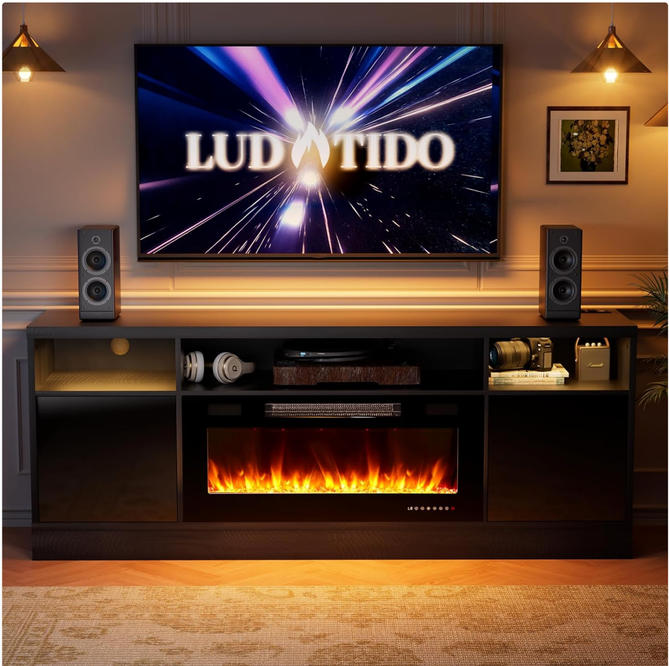
Image: Examples of LED lighting color options.

Use the dedicated button on the control panel or remote (if applicable) to cycle through various LED colors and effects. Refer to the specific LED controller instructions for detailed operation.