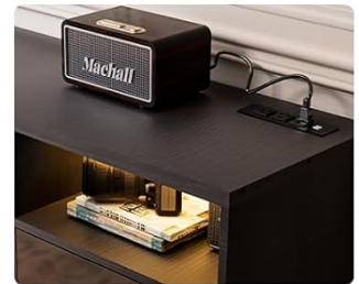
Power Supply Station