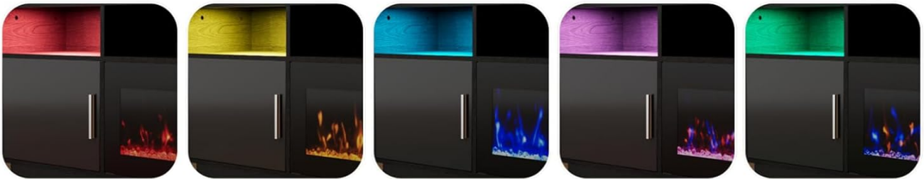
Image: Cable management hole for organized wiring.