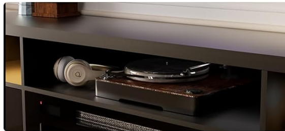
Open Shelf for Soundbar