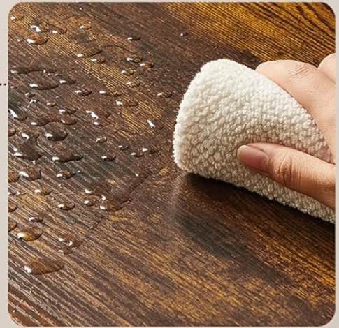
Surface facile à nettoyer