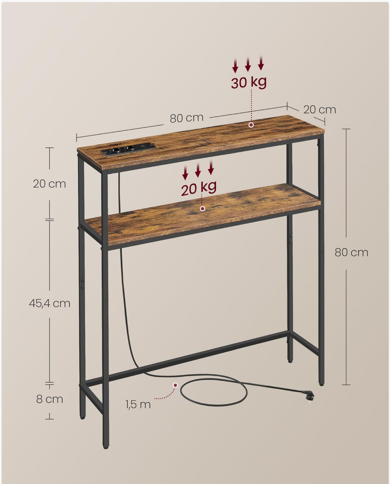
Image: Technical diagram illustrating the console table's dimensions (80 cm length, 20 cm width, 80 cm height) and maximum weight capacities for the top (30 kg) and bottom (20 kg) shelves.