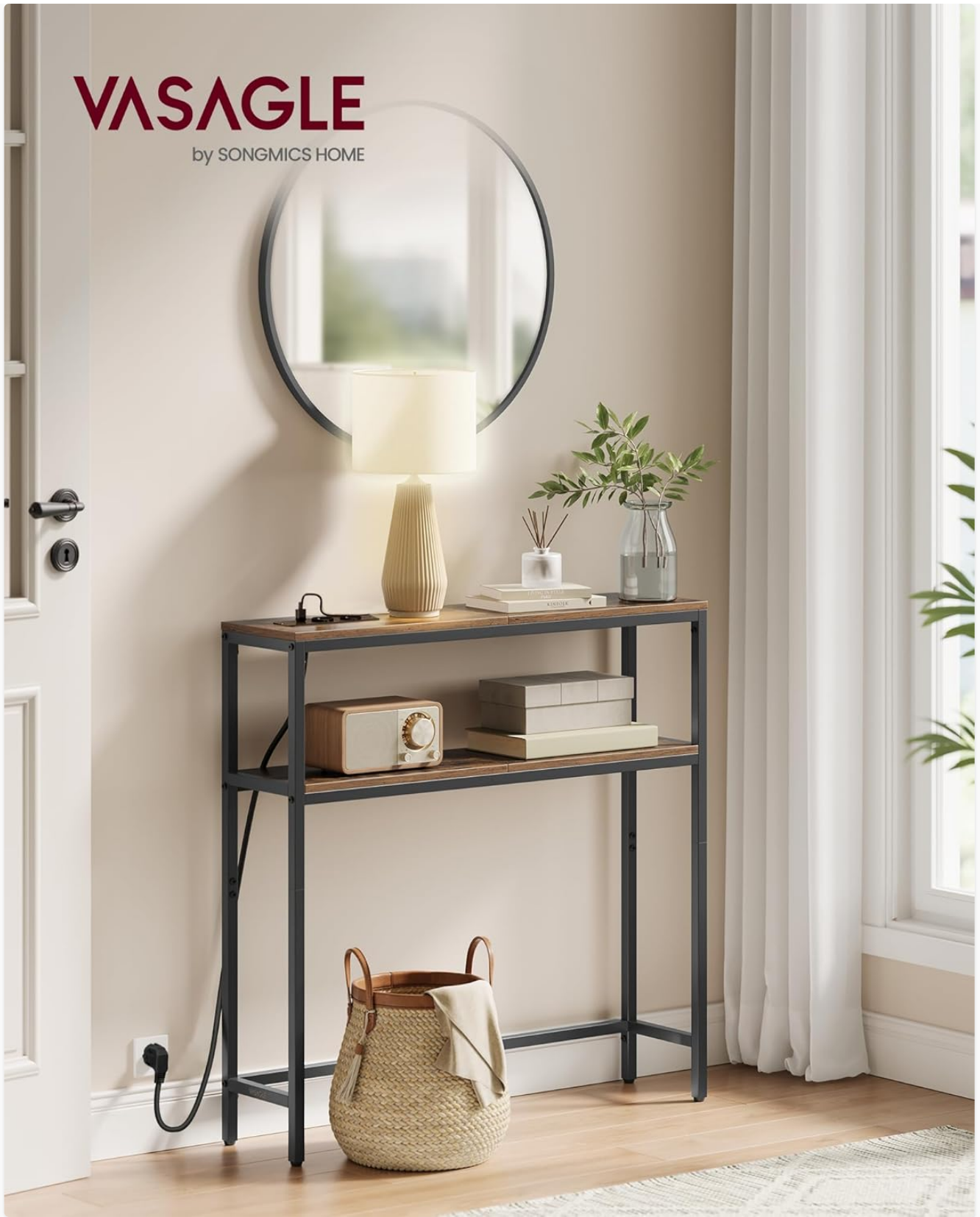
Image: The VASAGLE LNT135KD01 Console Table, showcasing its rustic brown and ink black design in a home environment.