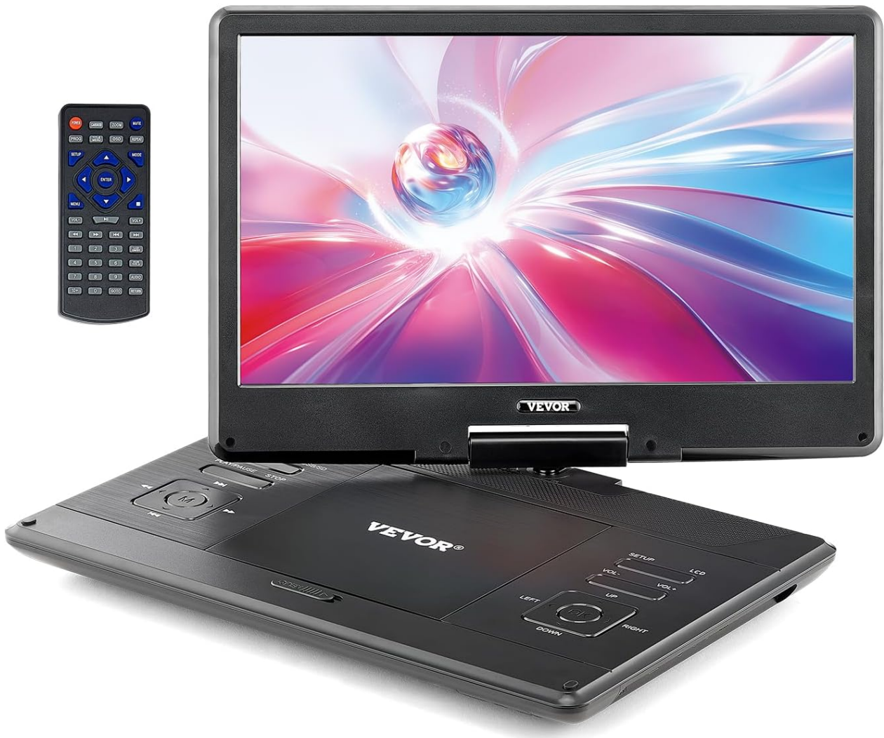
Figure 1.1: VEVOR 14-inch Portable DVD Player and Remote Control