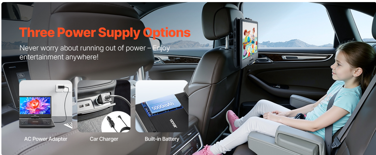
Figure 4.1: Built-in 5000mAh Rechargeable Battery