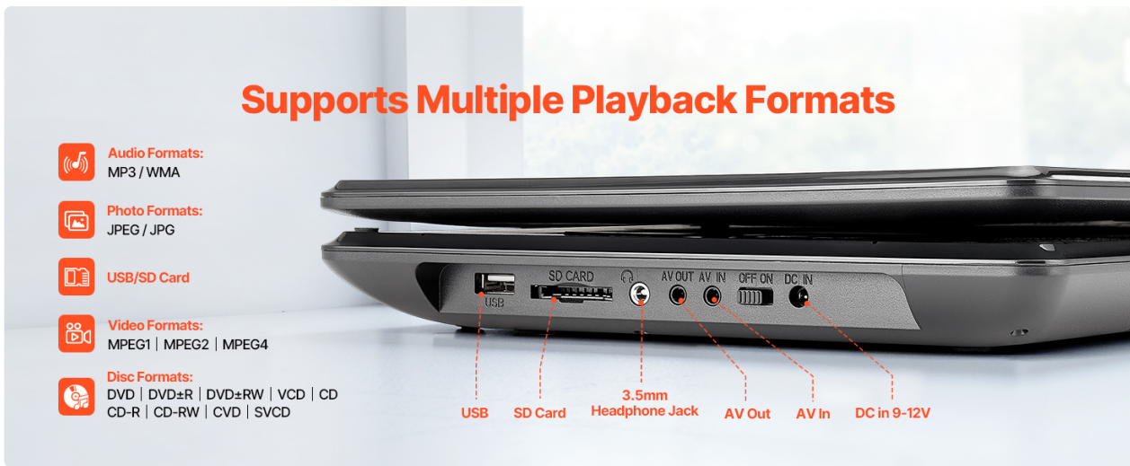
Figure 5.1: Supported Disc Formats