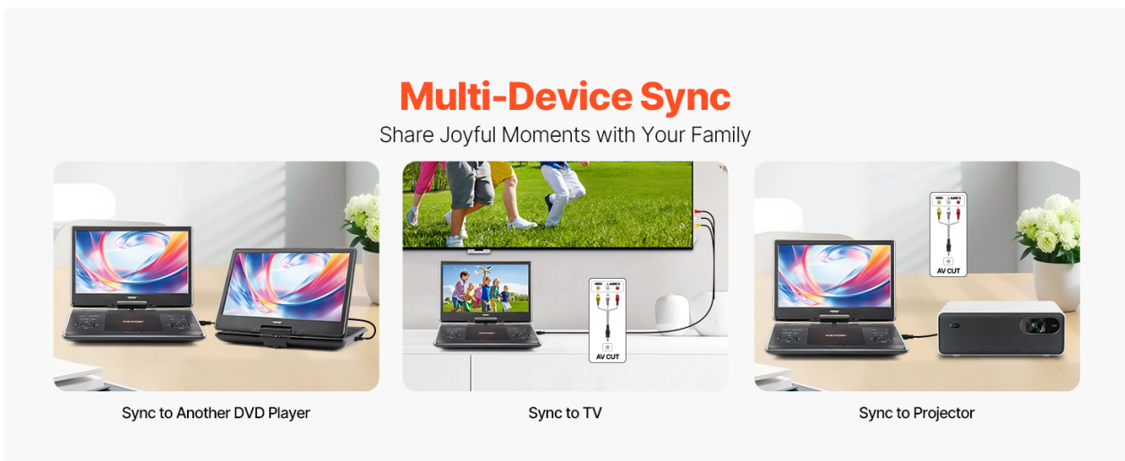
Figure 4.2: Connecting to a TV for a larger viewing experience