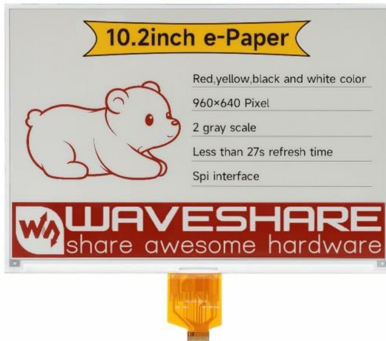
Image 1.1: Front view of the TUOPUONE 10.2inch e-Paper (G) display, showing the screen and flexible PCB connector.