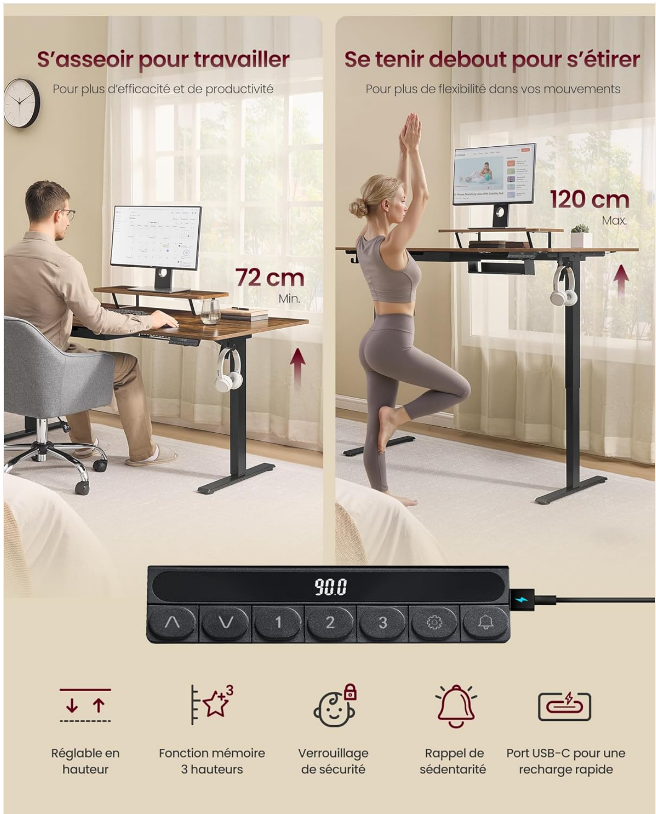
Figure 5.1: Height Adjustment and Control Panel - This image illustrates the desk's adjustable height range, showing a user sitting at 72 cm and standing at 120 cm. A detailed view of the control panel highlights the height adjustment buttons, memory presets, safety lock, sedentary reminder, and USB-C port.

The desk's height can be adjusted electrically from 72 cm (minimum) to 120 cm (maximum), allowing you to comfortably switch between sitting and standing positions. Use the up and down arrow buttons on the control panel to adjust the height.