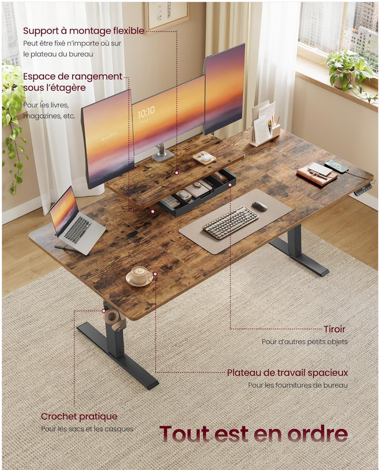
Figure 6.2: Detailed Features - This image provides a closer look at the desk's key features, including the flexible monitor stand, the integrated drawer for small items, and the practical hook for headphones or bags, all contributing to an organized workspace.