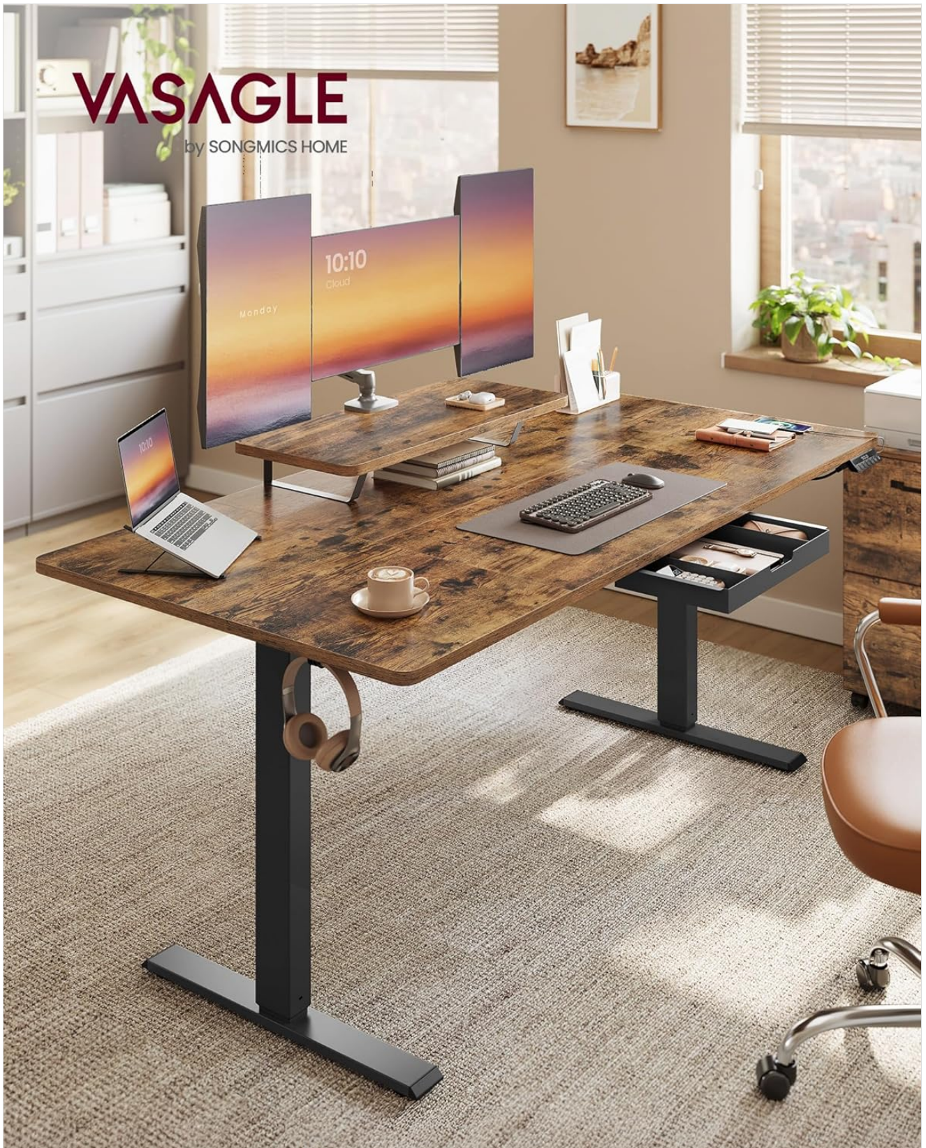
Figure 6.1: Desk in Use - This image provides an overall view of the VASAGLE electric height-adjustable desk in a home office setting, highlighting its spacious surface, monitor setup, and integrated accessories.