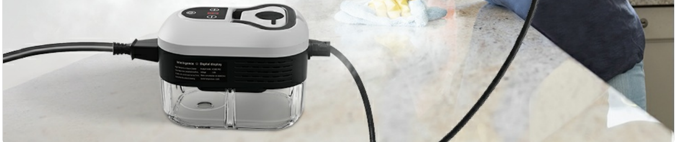
Image: A user operating the steam cleaner from a distance, cleaning a sofa with the spray gun, illustrating the extended reach of the steam tube and power cable.