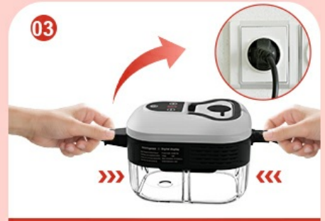
Connect the Power Supply