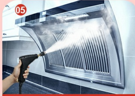
Hold the spray gun to operate jet