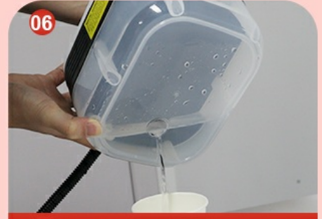
Bottom Drain Water

Image: A compilation of cleaning applications, showcasing the steam cleaner's versatility on surfaces like floor tiles, sofas, windows, narrow seams, cooktops, and range hoods.