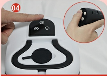
Press the Power Button, Adjust the Steam Volume(1-6Gear)