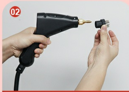
Install Brush Heads