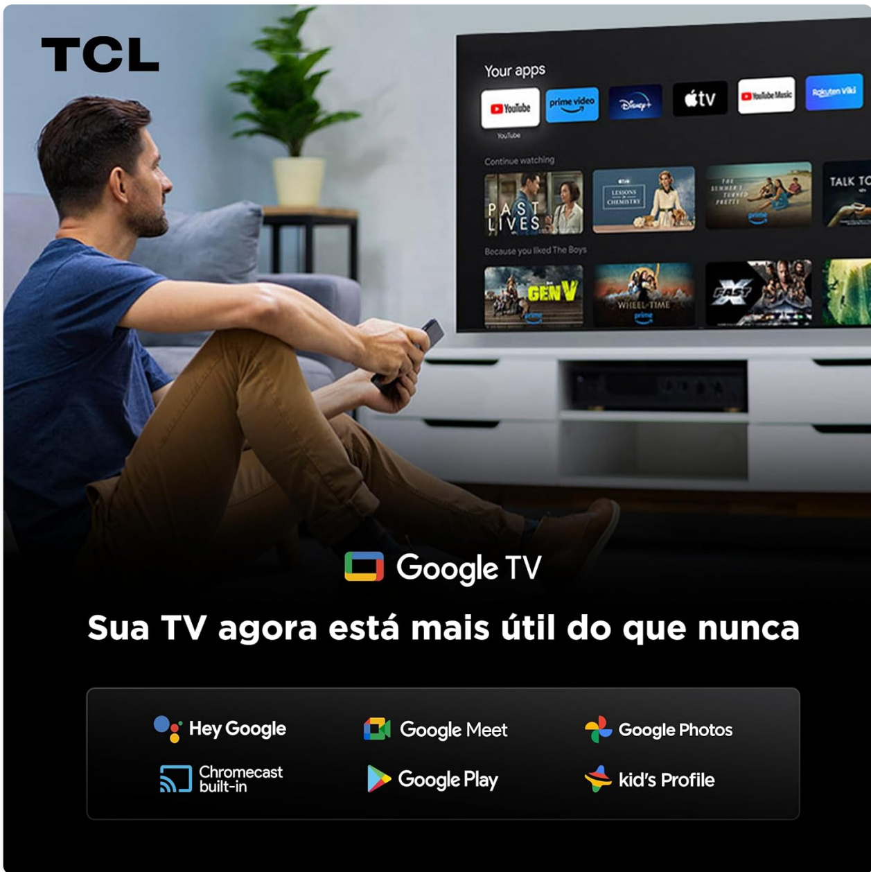
Figure 3: The Google TV interface, offering a centralized hub for all your entertainment.