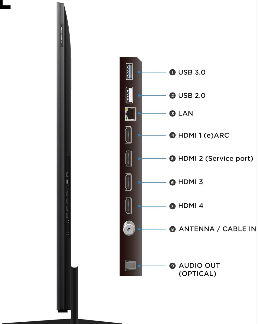
Figure 2: Side view of the TCL C7K TV, detailing the available connection ports.