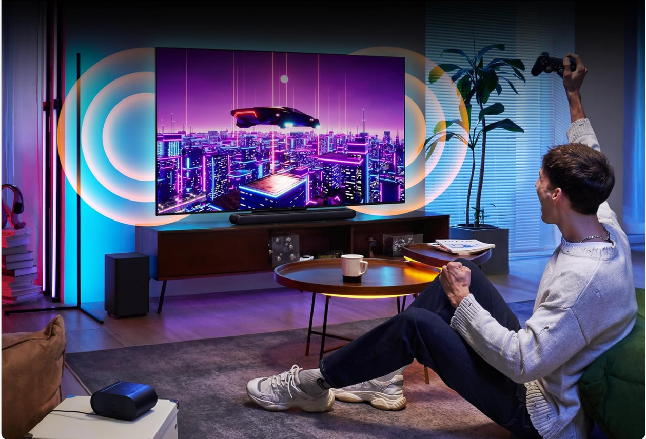
Figure 5: Experience immersive gaming with the TCL C7K's advanced gaming features.