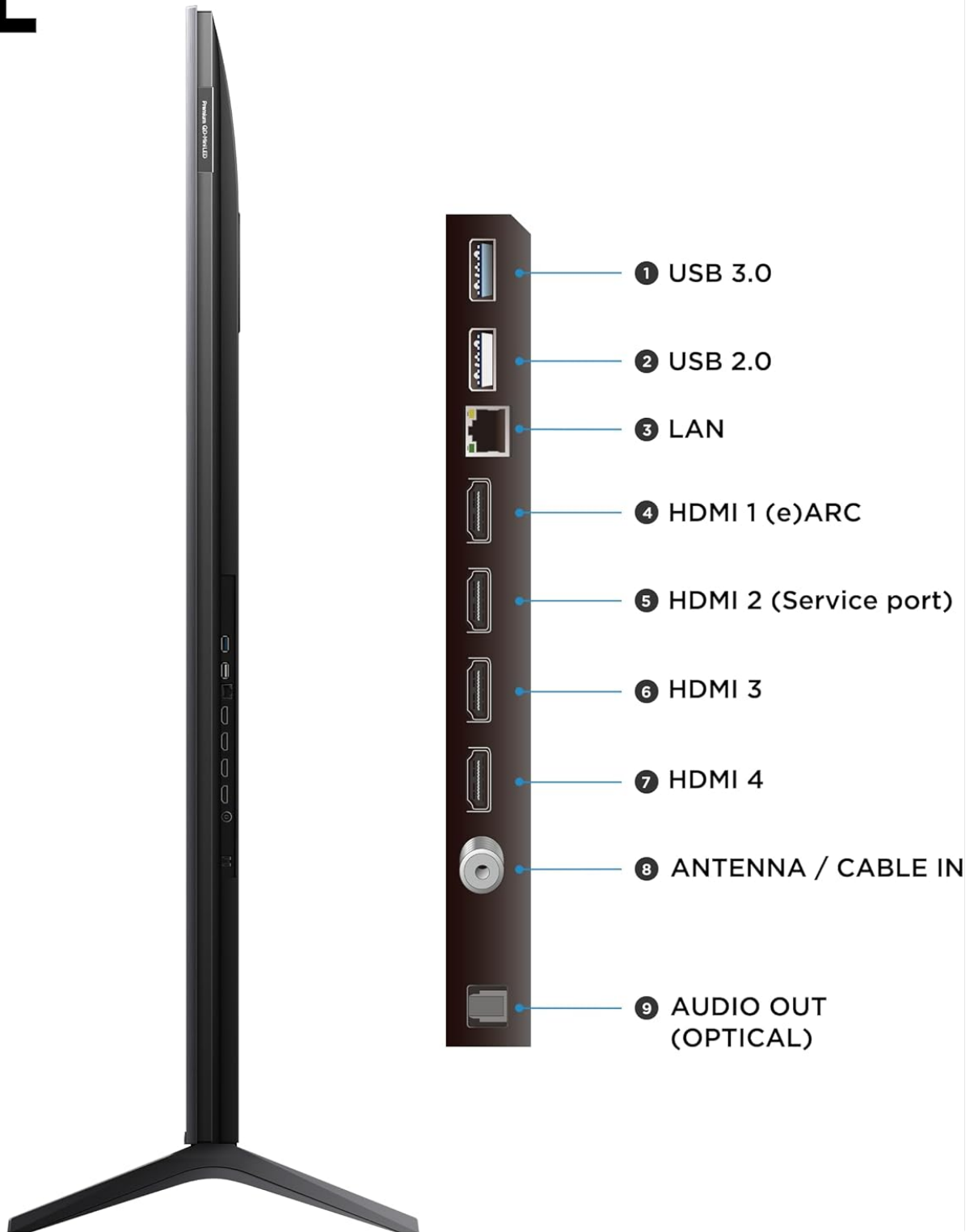
Image: Side view of the TCL C6K TV displaying its connectivity panel, including USB, LAN, HDMI, Antenna/Cable IN, and Optical Audio Out ports.