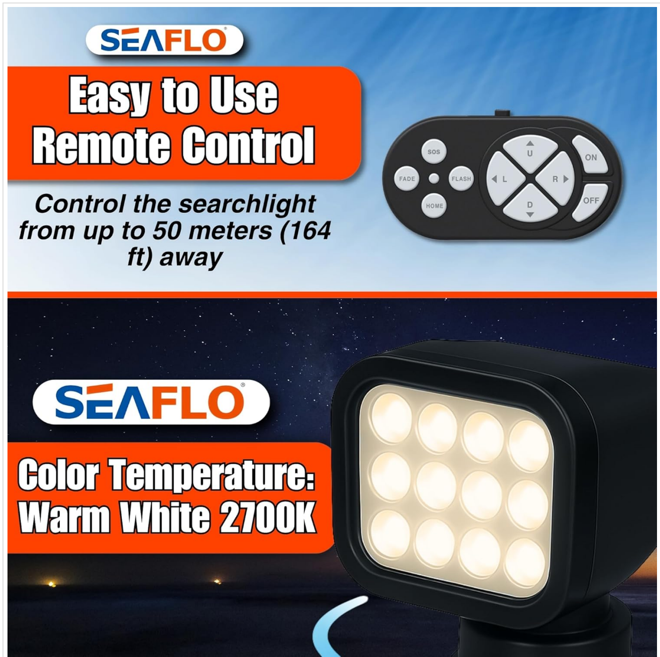
Image: The wireless remote control, highlighting its various function buttons.

The SEAFLO searchlight is controlled using the provided wireless remote. Familiarize yourself with the remote's buttons for optimal operation.