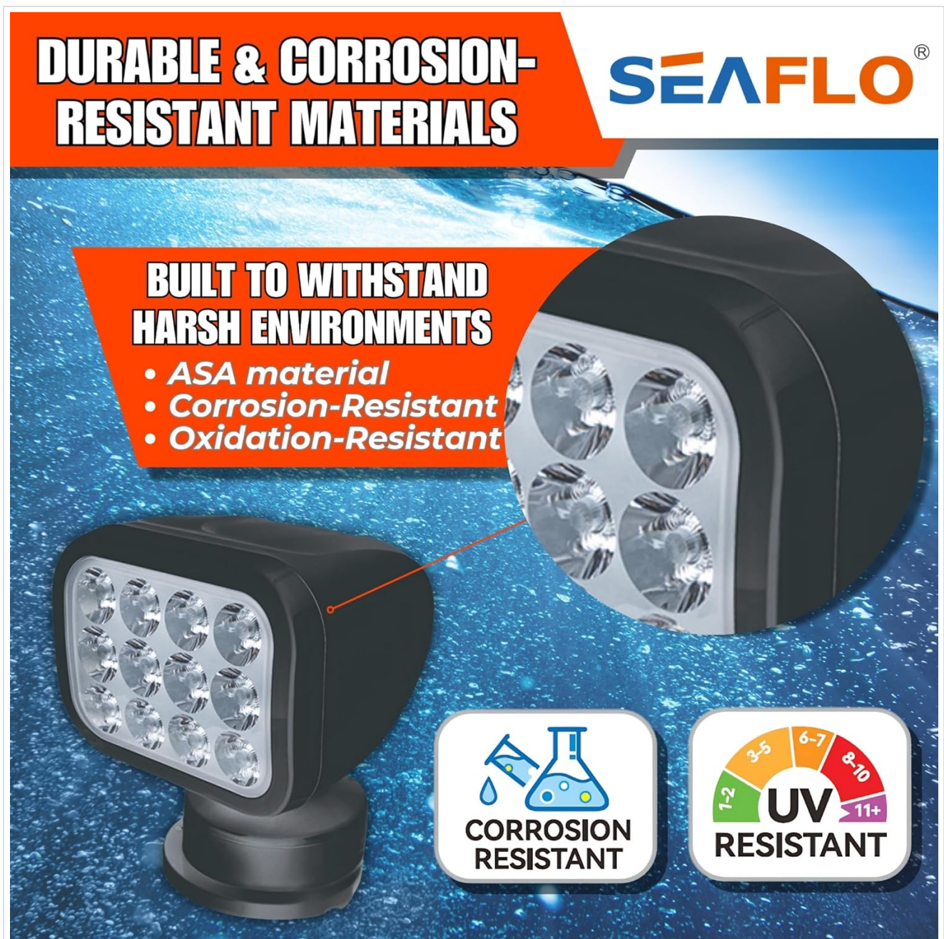
Image: Close-up view emphasizing the durable and corrosion-resistant ASA material used in the searchlight's construction.