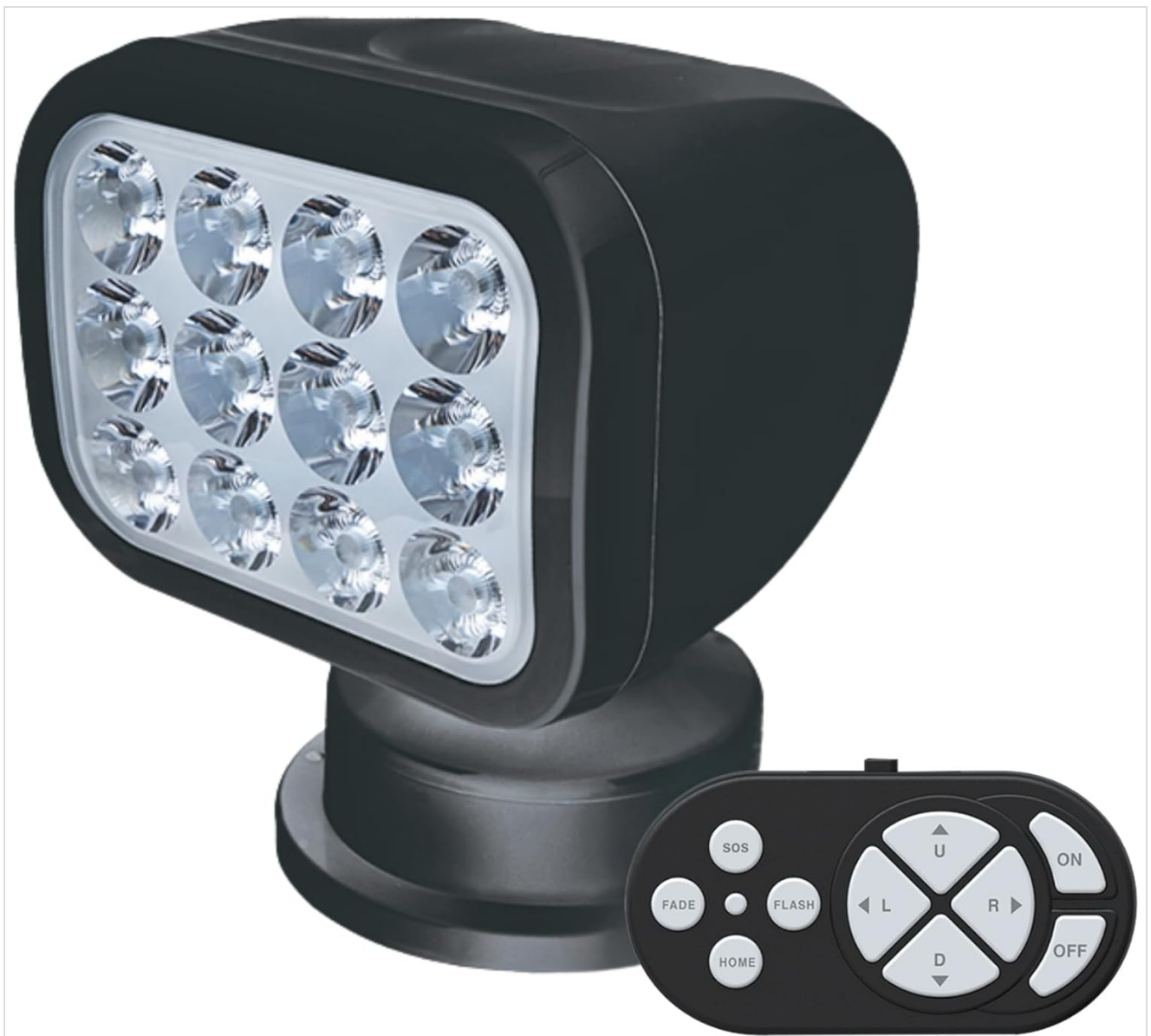
Image: The SEAFLO searchlight unit shown with its wireless remote control, illustrating the product's overall design.