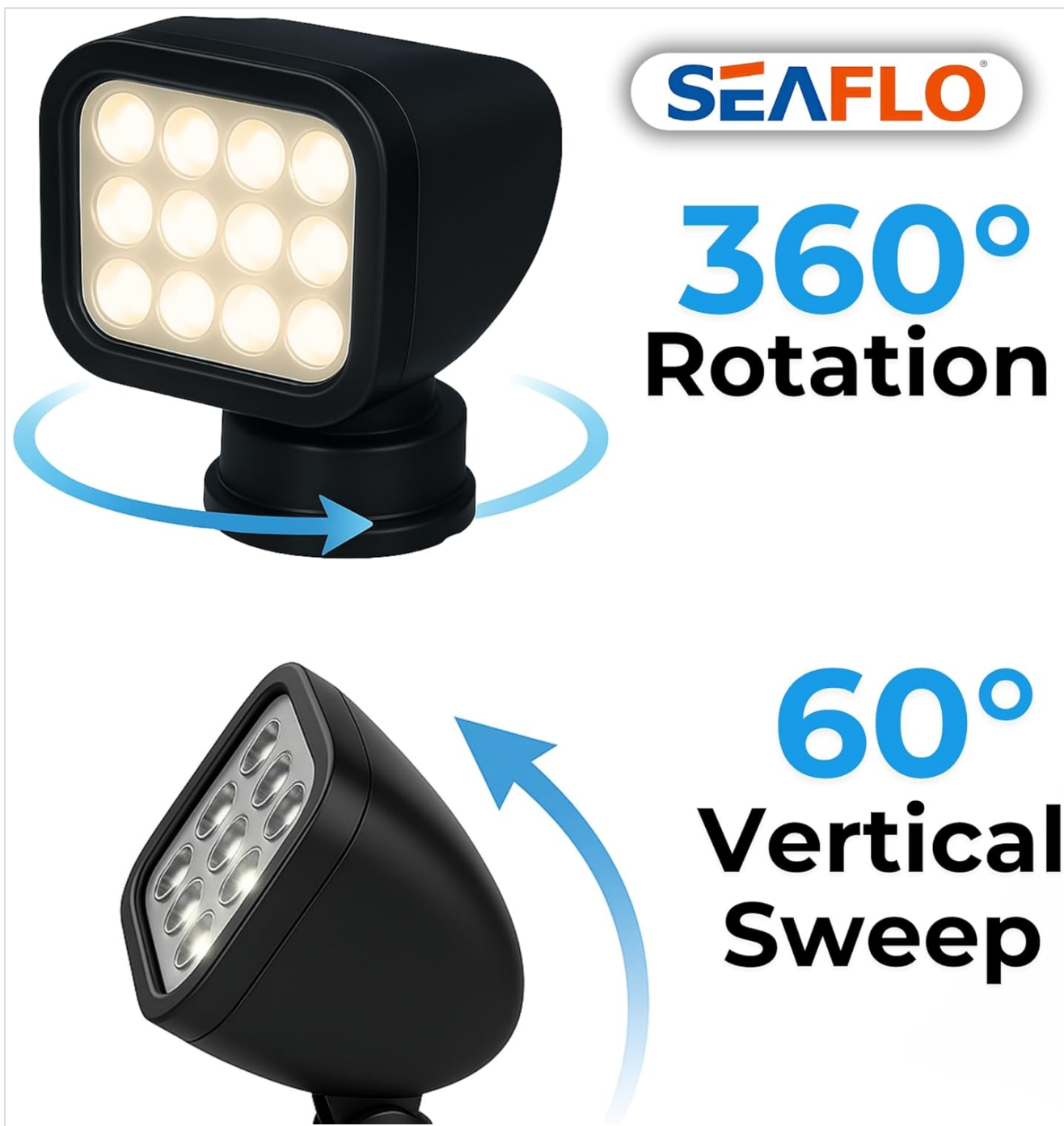
Image: Illustration of the searchlight's 360-degree horizontal rotation and 60-degree vertical sweep capabilities.