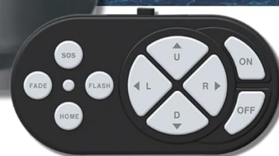
Image: Key features of the SEAFLO searchlight, including IP65 waterproof rating, corrosion resistance, and UV resistance.