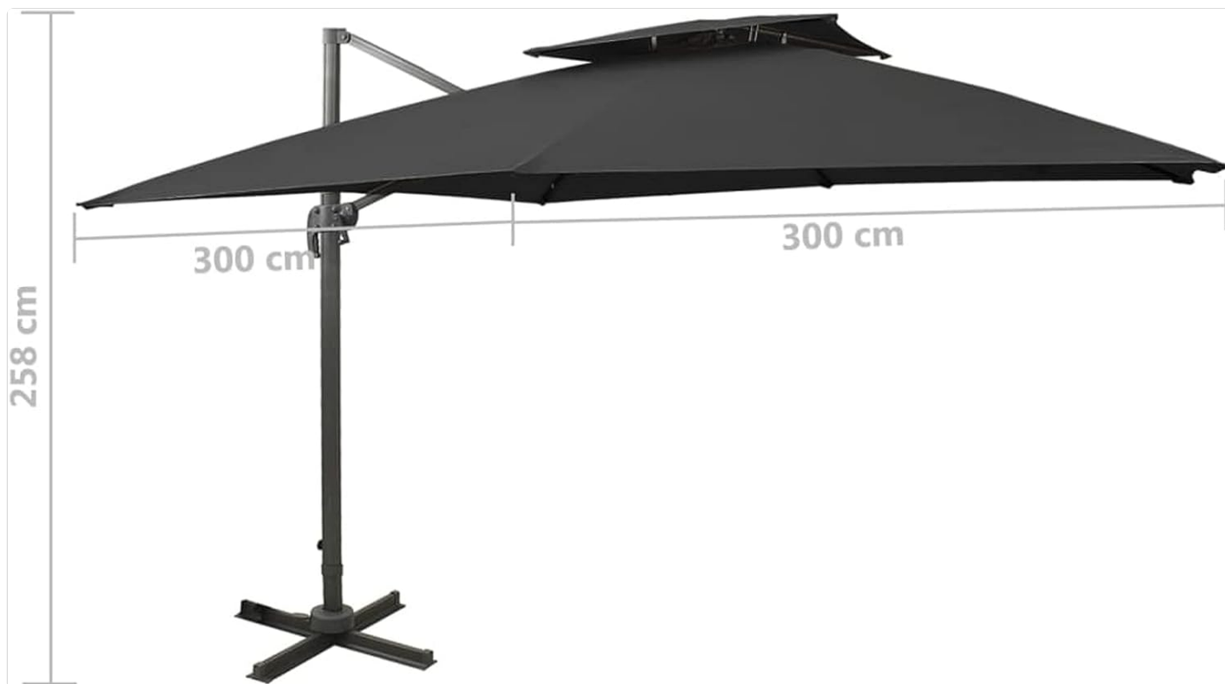
Figure 7.1: Key dimensions of the cantilever umbrella. This image provides a visual representation of the umbrella's length, width, and height.