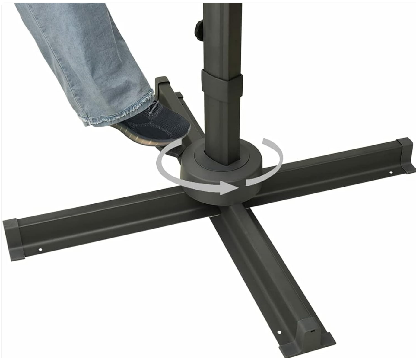
Figure 4.4: The base allows for 360-degree rotation. This image shows the foot pedal used to unlock and rotate the umbrella.