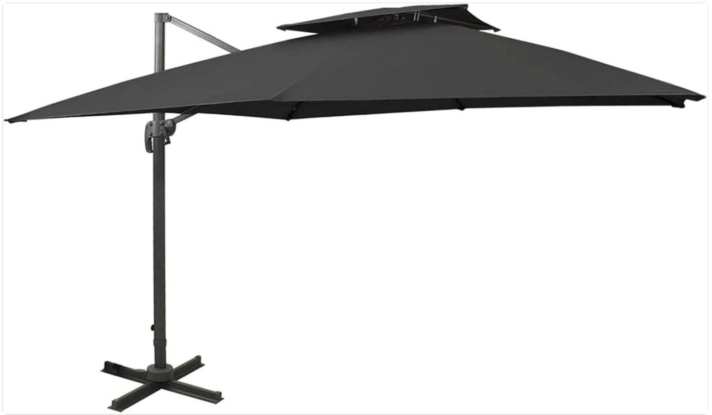
Figure 2.1: Overview of the Garden Cantilever Umbrella. This image shows the full umbrella with its canopy, pole, and cross base.