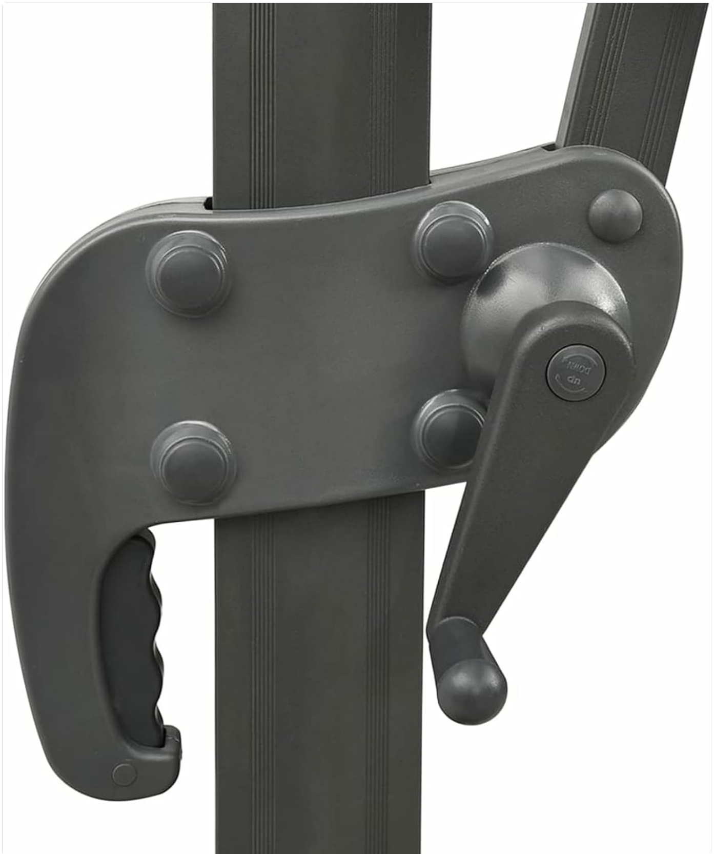
Figure 4.1: The crank mechanism allows for easy opening and closing. This image shows the handle used to operate the umbrella.