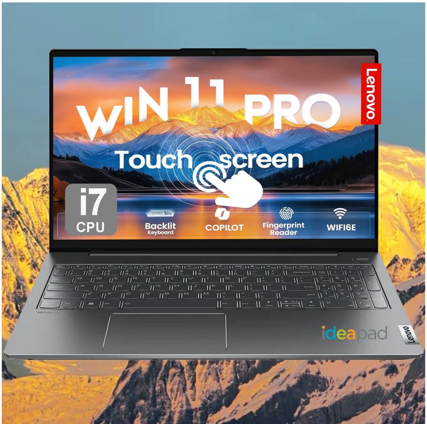
Image: The Lenovo IdeaPad laptop, showcasing its touchscreen and key features like Intel i7, Backlit Keyboard, Copilot, Fingerprint Reader, and WiFi 6E.