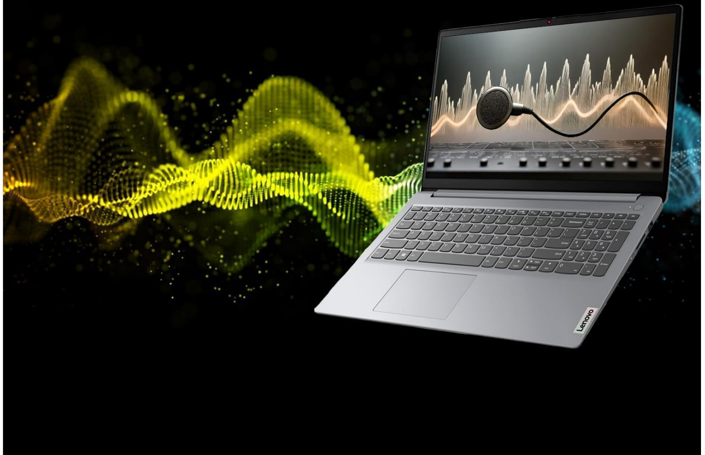
Image: A visual representation of the Dolby Audio feature on the Lenovo IdeaPad, showing sound waves emanating from the laptop speakers.

Enhance your entertainment experience with robust and rich Dolby Audio speakers. Watch on-the-go anytime, anywhere