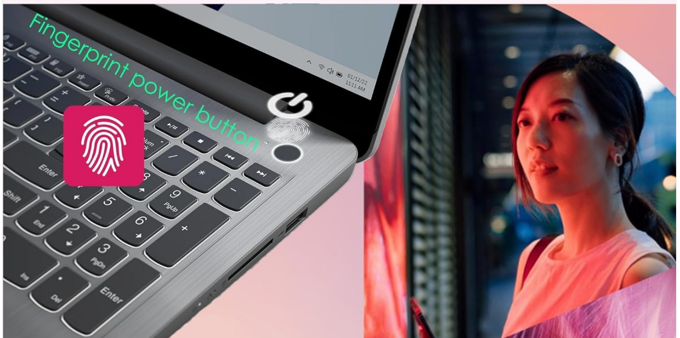
Image: Depiction of the Lenovo IdeaPad's backlit keyboard and the fingerprint power button, highlighting ease of typing in low light and secure login.

Easier Typing for users who work, play, or study in low-light environments.