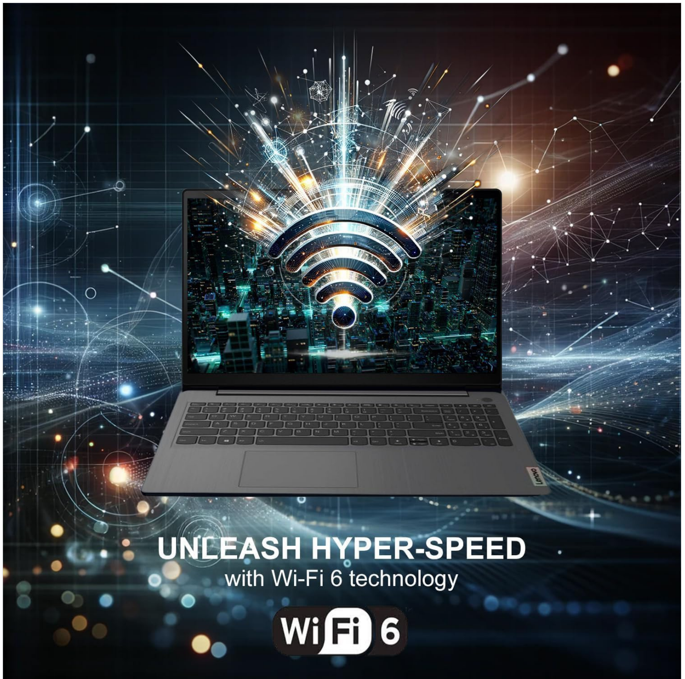
Image: Graphic illustrating the Wi-Fi 6 technology on the Lenovo IdeaPad, symbolizing hyper-speed connectivity.