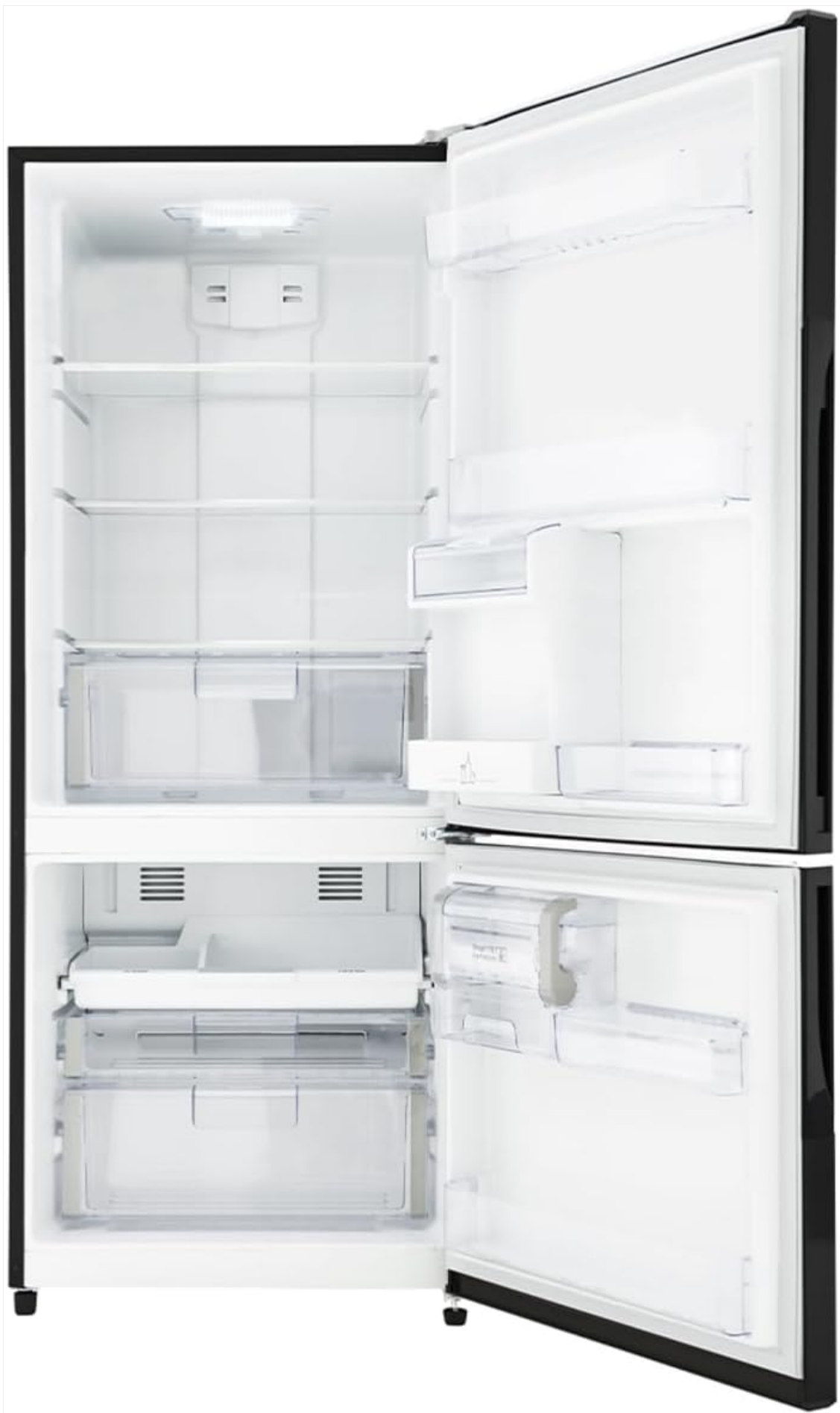
Image 4: Empty interior view of the Mabe RMB520IJMRP1 refrigerator, highlighting the adjustable shelves, door bins, and crisper drawers. This view provides a clear understanding of the internal layout and flexibility for storage.