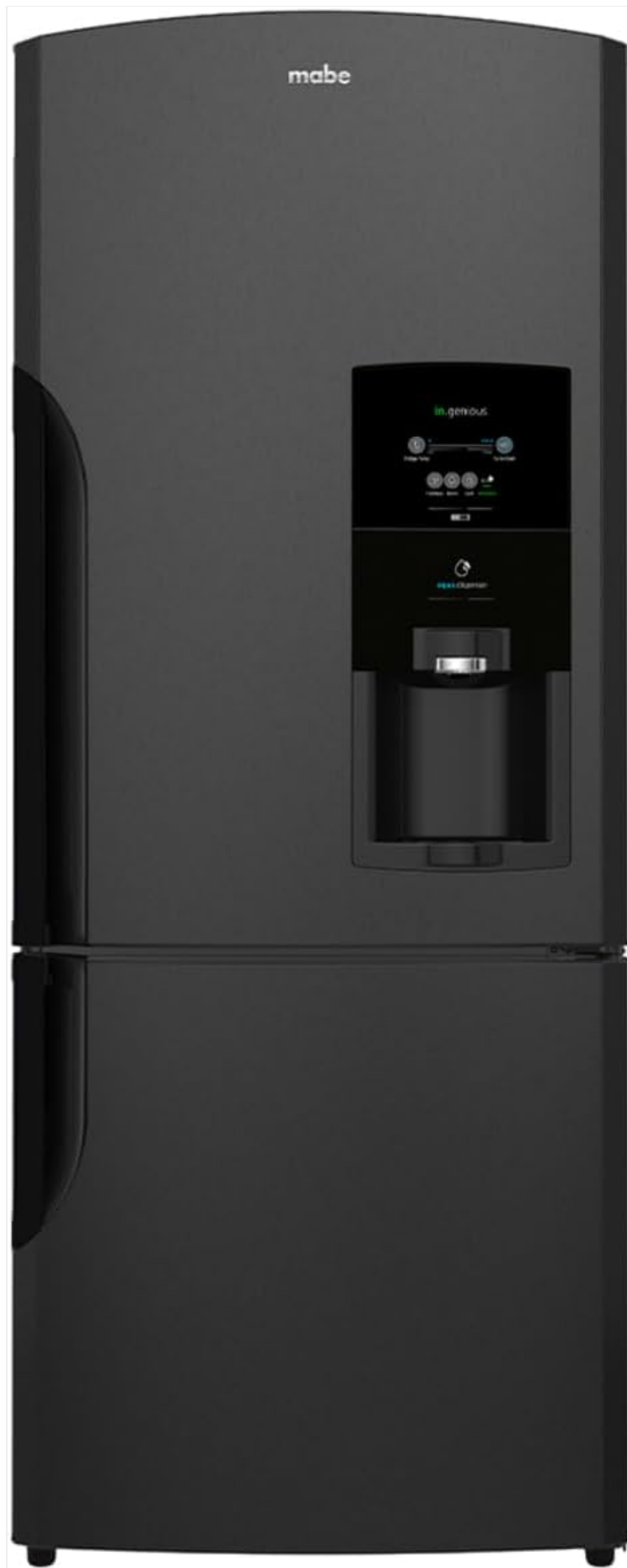
Image 1: Front view of the Mabe RMB520IJMRP1 refrigerator, showcasing its black stainless steel finish and integrated water dispenser. This image illustrates the overall design and external features of the appliance.