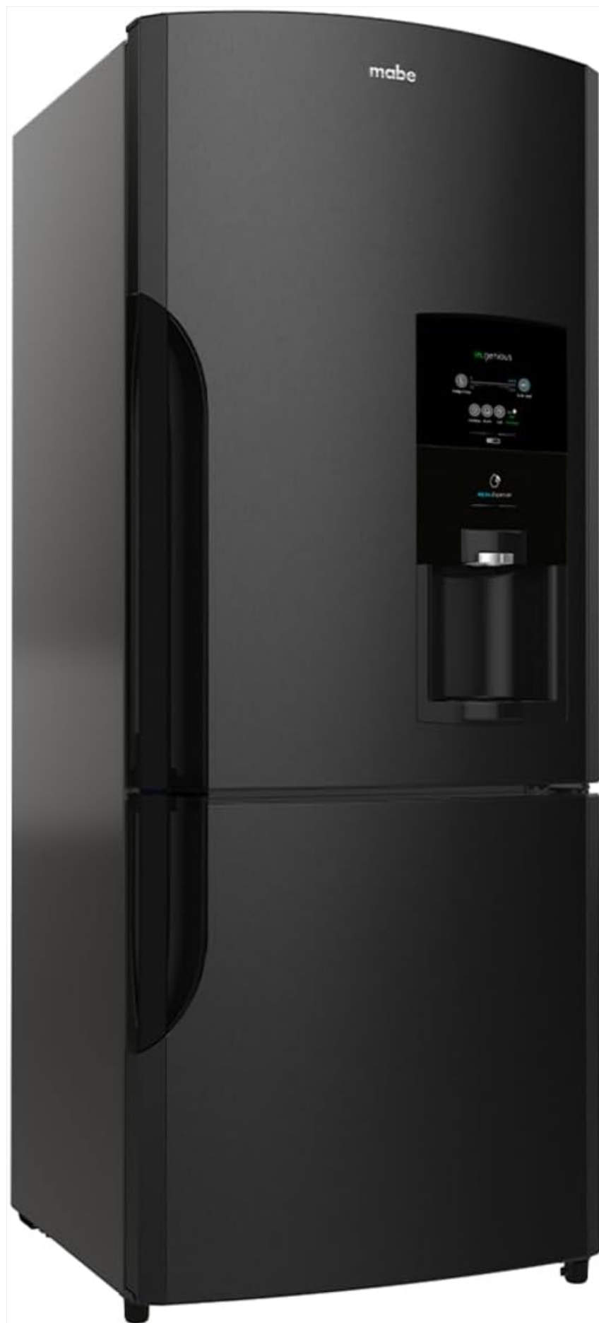
Image 2: Angled front view of the Mabe RMB520IJMRP1 refrigerator, highlighting its sleek design and the bottom freezer configuration. This perspective helps visualize the appliance's footprint and aesthetic.