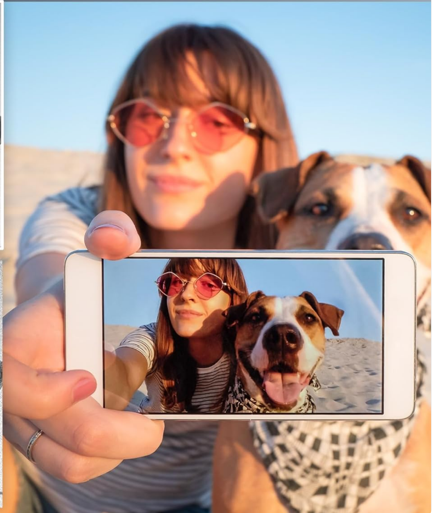
Image: A comparison demonstrating the print quality of the Phomemo M832D (300 dpi) versus other printers (203 dpi), showing clearer and faster output from the M832D. A woman and a dog are depicted in the printed images.