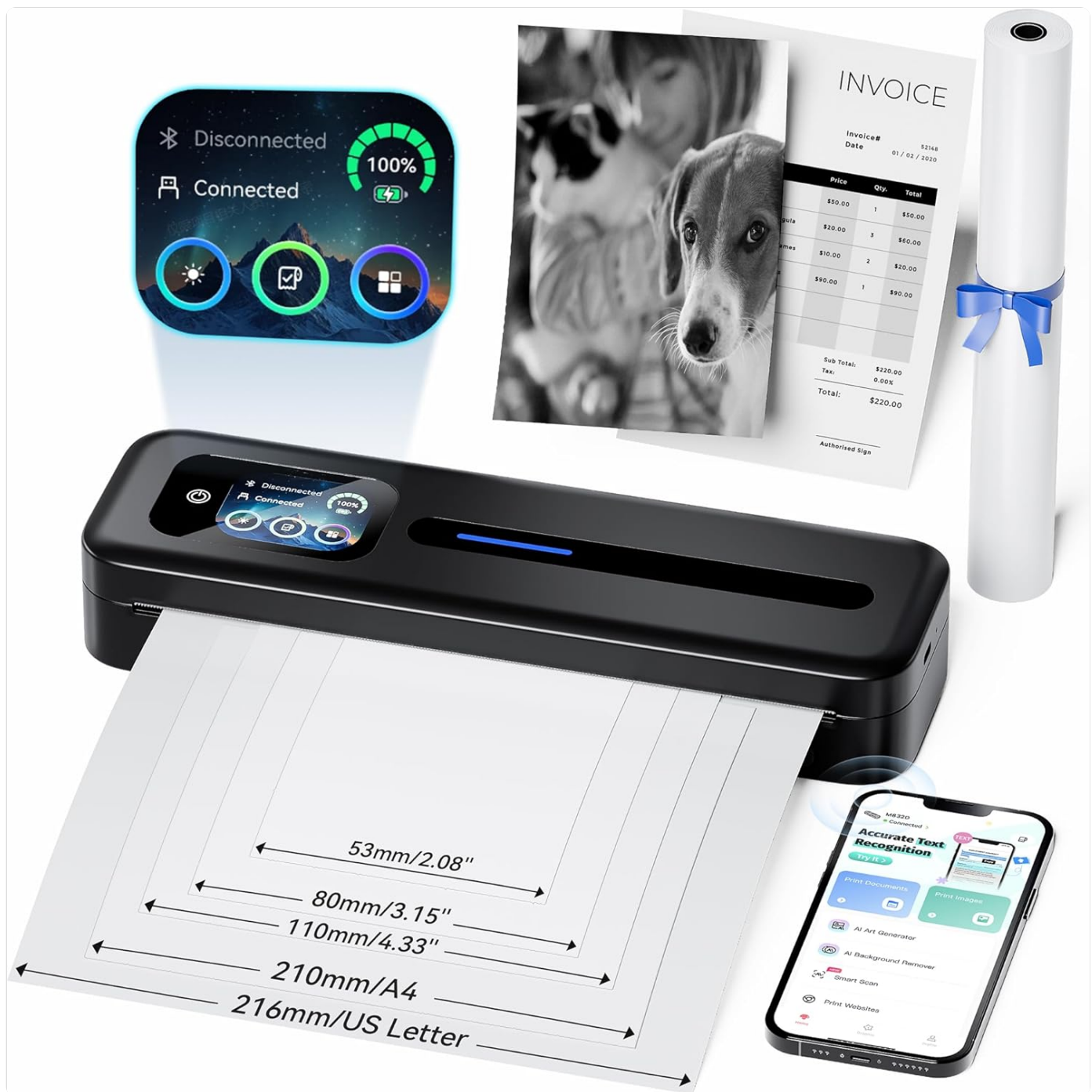
Image: The Phomemo M832D printer with a sheet of paper being fed, illustrating the supported paper widths: 53mm/2.08", 80mm/3.15", 110mm/4.33", 210mm/A4, and 216mm/US Letter.