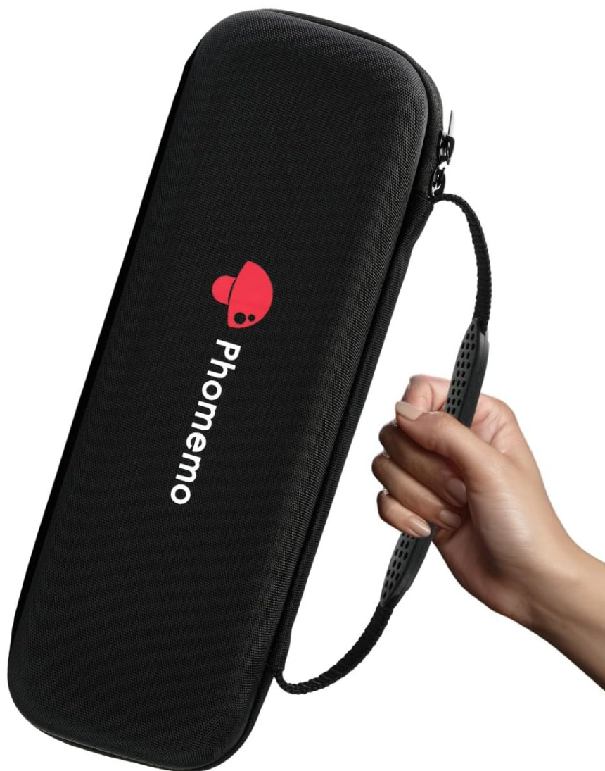
Image: A detailed view of the Phomemo carrying case, highlighting its comfortable grip, strong fasteners (zippers), and hardshell construction for durability.