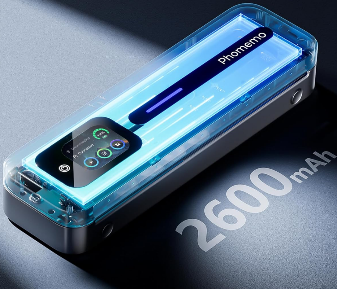
Image: An illustration showing the Phomemo M832D printer's internal battery, highlighting its 2600mAh capacity, ability to print 200+ sheets, and 30-hour standby time. The touchscreen displays battery percentage.