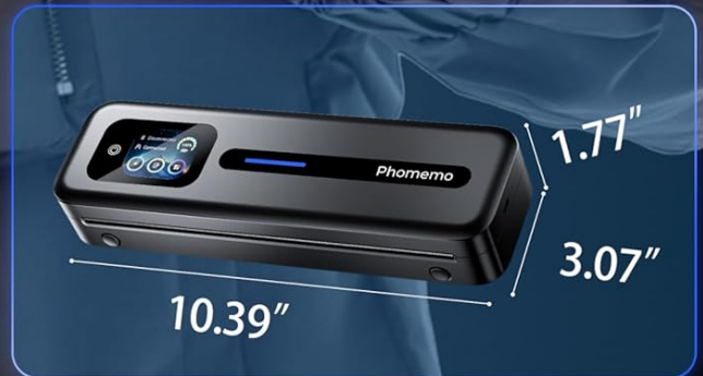
Image: A person holding the Phomemo M832D printer, illustrating its compact size and light weight (1.5 lbs). Dimensions of 10.39" length, 3.07" width, and 1.77" height are shown.