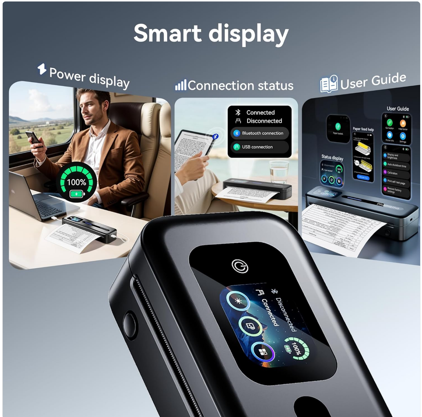
Image: A close-up view of the Phomemo M832D printer's smart display, highlighting its power display, connection status, and user guide interface. The display shows battery level, Bluetooth and USB connection status, and icons for various functions.

The Phomemo M832D features an intuitive touchscreen display for easy operation. Key components include: