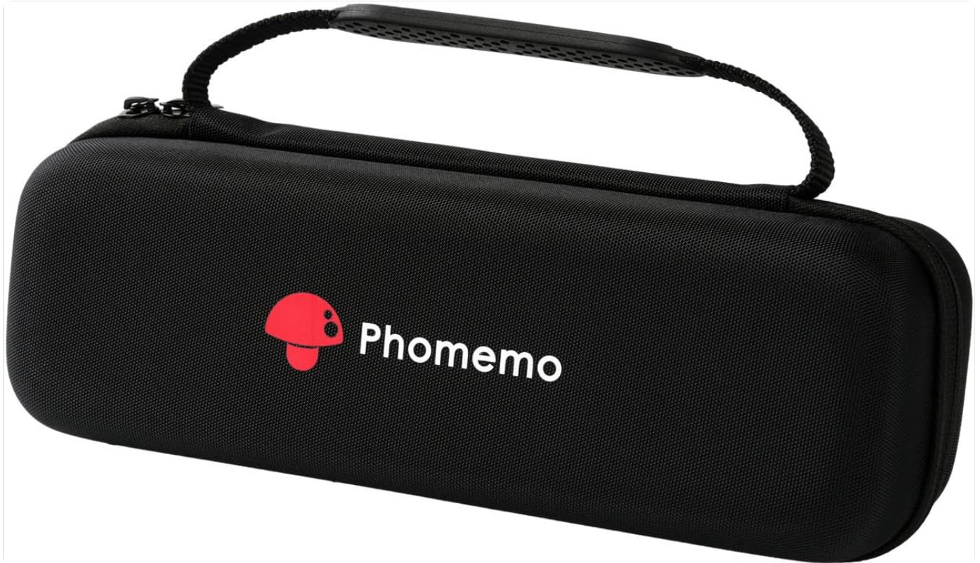
Image: The black Phomemo carrying case, designed to protect the portable printer. It features a durable exterior and a prominent Phomemo logo.

The included carrying case provides protection and portability for your printer and accessories. It features: