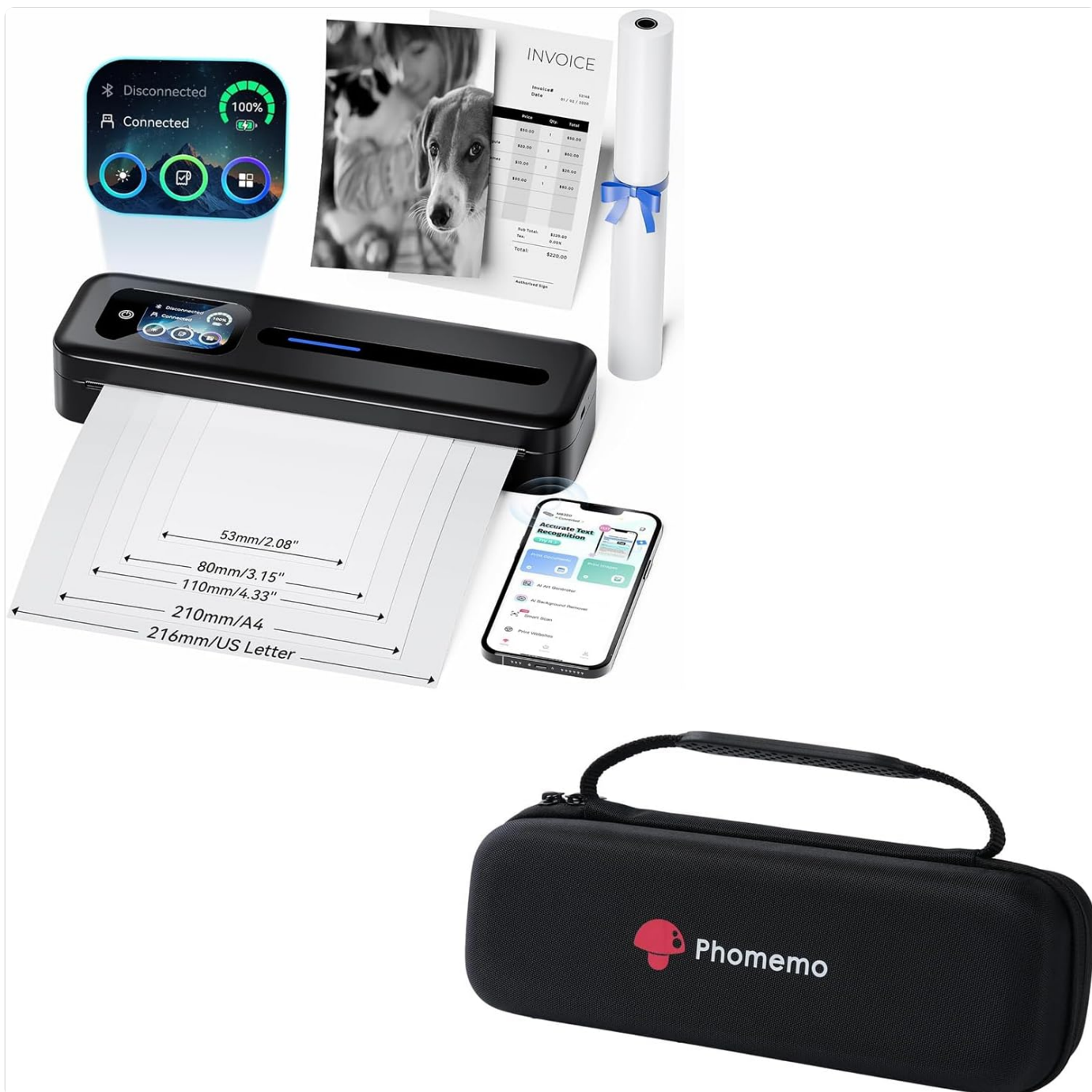
Image: The Phomemo M832D portable printer, showing its compact design, along with the included carrying case. Various paper sizes are indicated, and a smartphone displaying the companion app is also visible.