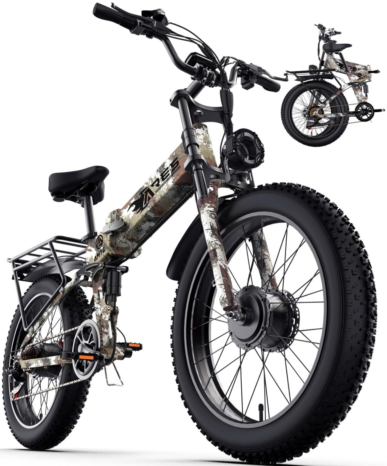
Figure 1: The AMYET ARES Dual Motor Folding Electric Bike in camouflage finish.