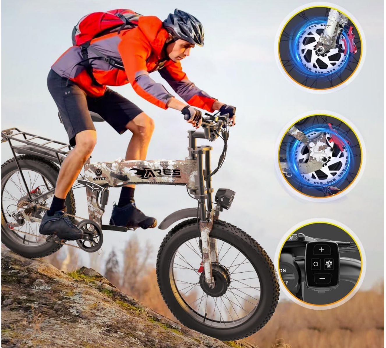
Figure 4: Illustration of the hydraulic disc brake system for reliable stopping power.