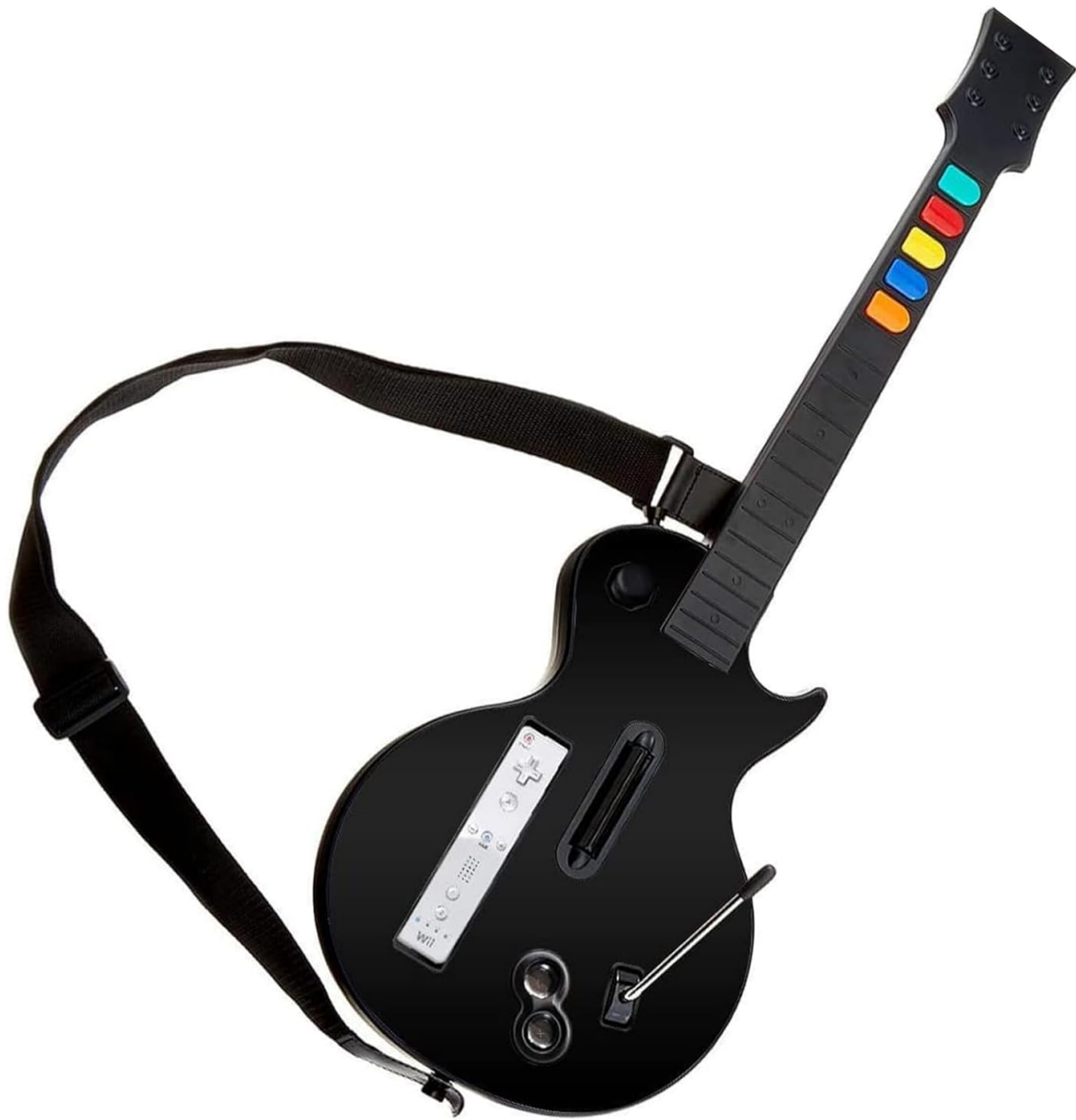
Image: The NBCP Wireless Guitar Controller in black, featuring a strap and a dedicated slot for the Wii Remote.