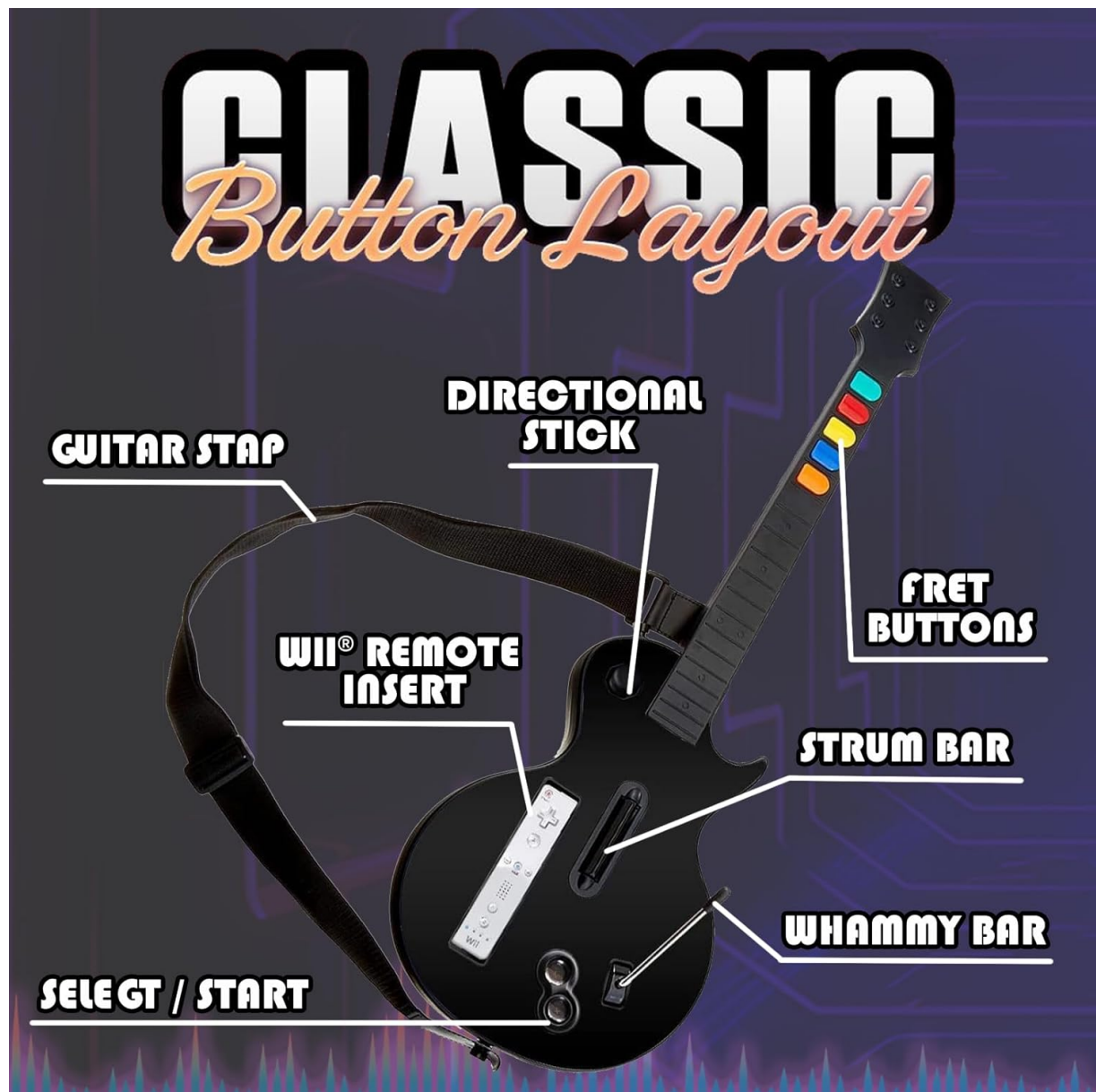
Image: A labeled diagram of the guitar controller, indicating the Fret Buttons, Strum Bar, Whammy Bar, Directional Stick, and Select/Start buttons.