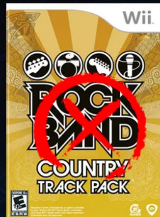
Image: A warning graphic explicitly stating that the controller is not compatible with games requiring microphone input or Rock Band 1.