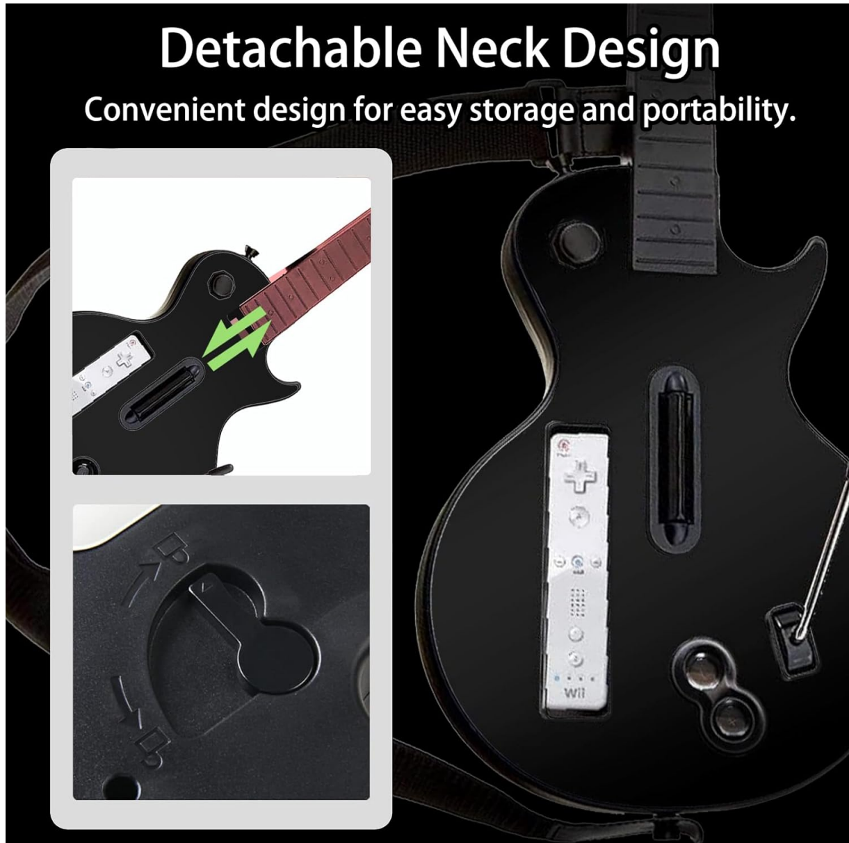
Image: Illustration demonstrating the detachable neck design, highlighting the connection point between the guitar body and neck.

The guitar neck is detachable for convenient storage and portability. To attach, align the neck with the body and slide it into place until it clicks securely. Ensure the locking mechanism on the back of the guitar body is engaged to prevent accidental detachment.