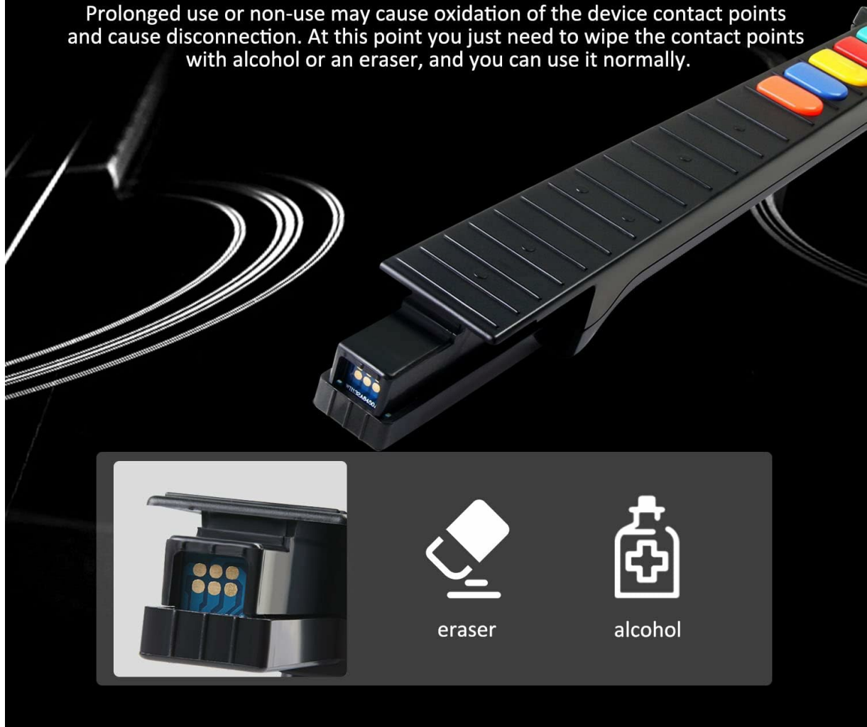
Image: A visual guide demonstrating the cleaning of contact points using an eraser or alcohol to address frequent disconnections.

Prolonged use or non-use may cause oxidation of the device contact points and cause disconnection. At this point you just need to wipe the contact points with alcohol or an eraser, and you can use it normally.