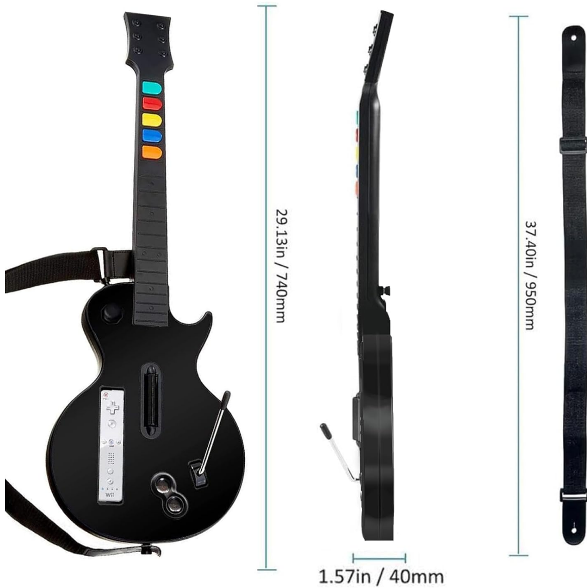
Image: A diagram illustrating the physical dimensions of the guitar controller and its accompanying strap.