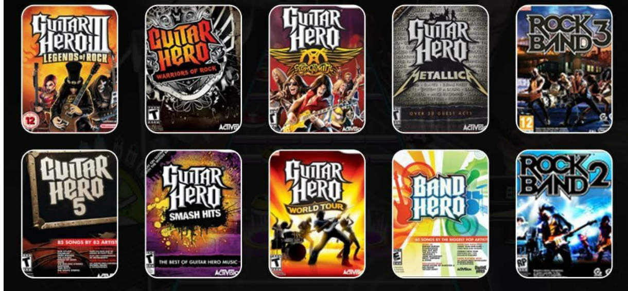
Image: A collage of game covers, including Guitar Hero titles and Rock Band 2, illustrating the controller's compatibility.