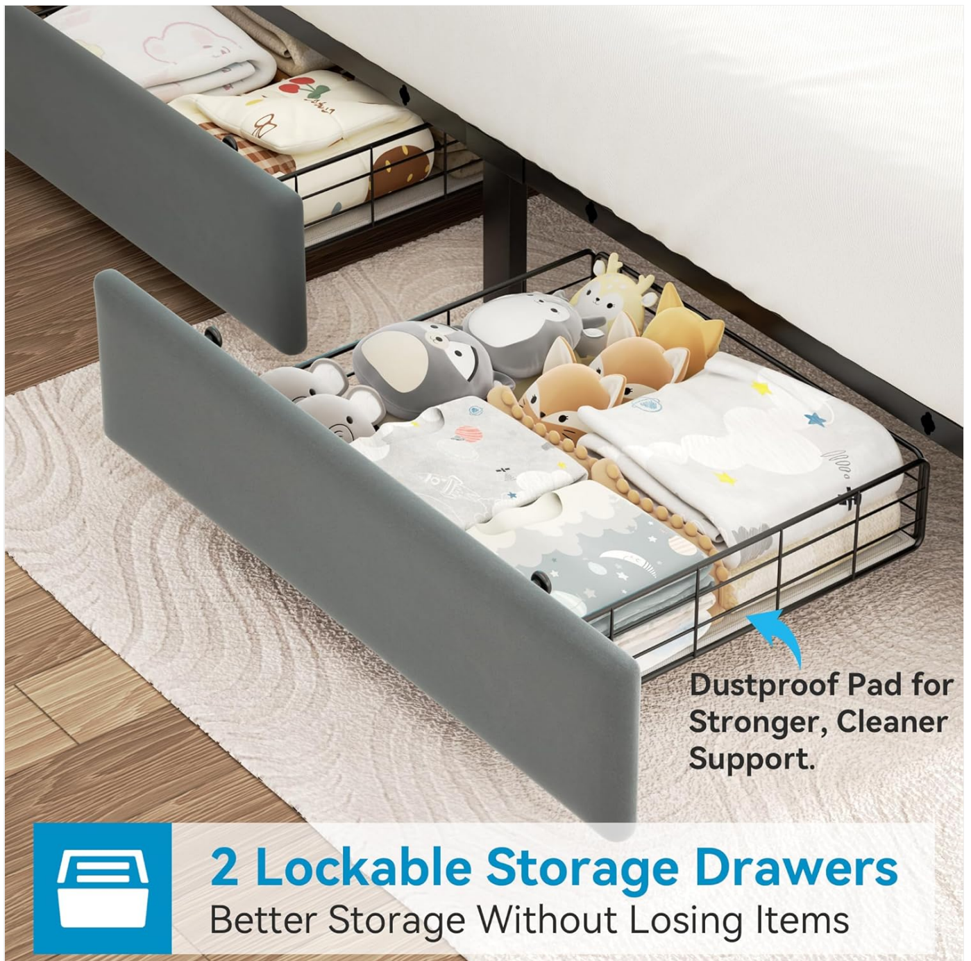
Image: The two lockable storage drawers, demonstrating their capacity and the dustproof pad feature.