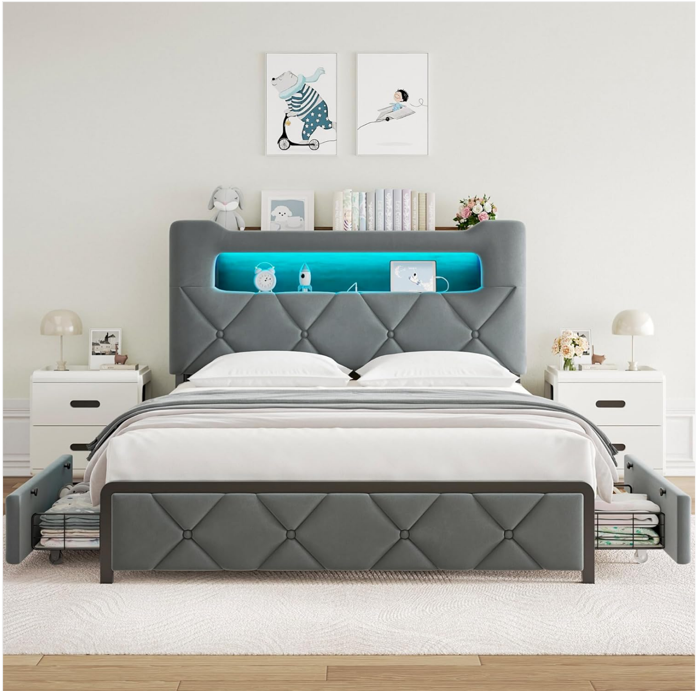
Image: The Jocoevol Queen Bed Frame fully assembled, showcasing the storage drawers and the illuminated headboard.