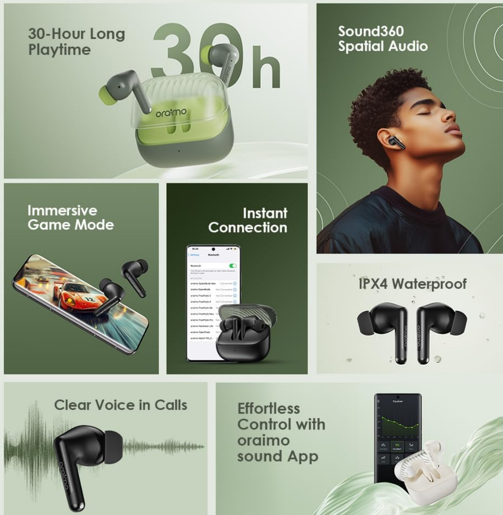
Image: Overview of Oraimo SpaceBuds Neo OTW-323 features.