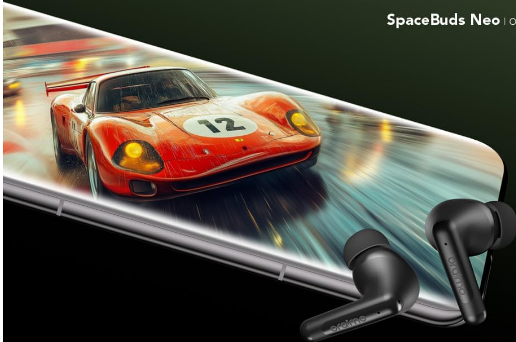
Image: Low-latency gaming mode for synchronized audio and video.