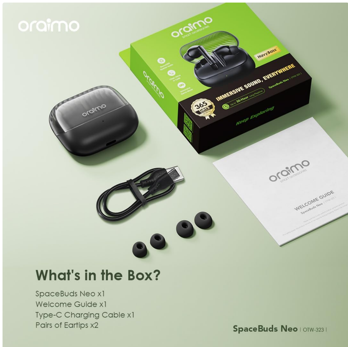
Image: Oraimo SpaceBuds Neo OTW-323 package contents.