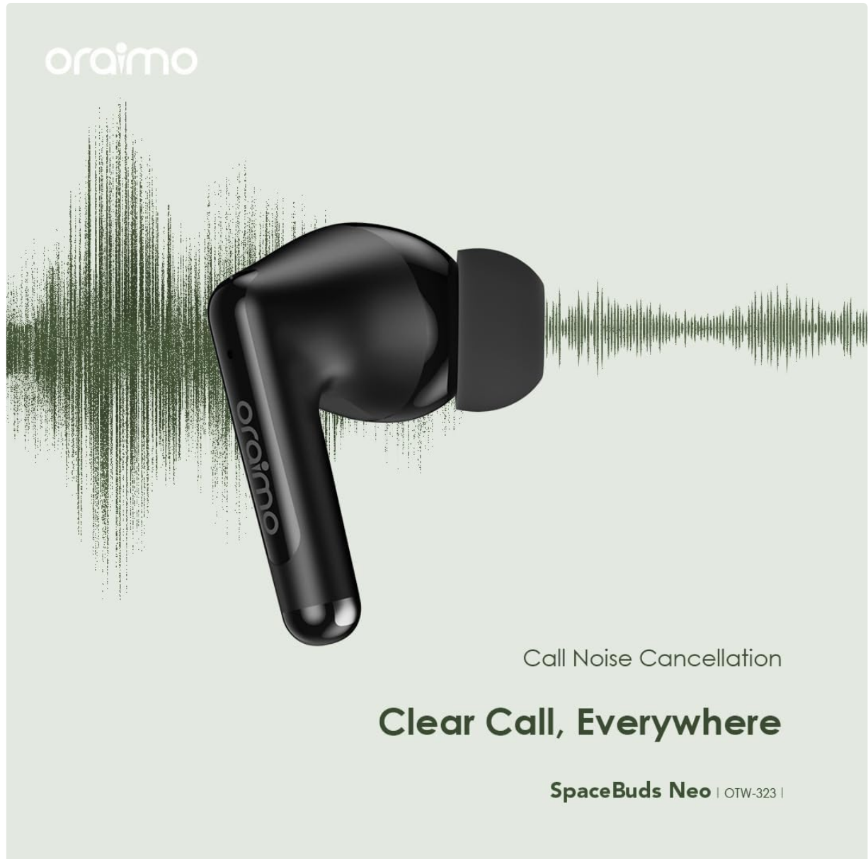
Image: Call Noise Cancellation feature.

The dual microphones with ENC technology help reduce ambient noise during calls, providing clearer voice transmission. This feature is automatically active during phone calls.