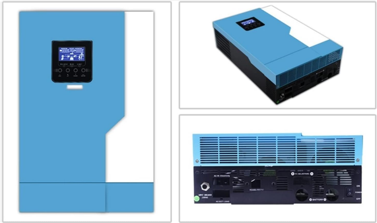
Figure 3.2: Composite image showing the front panel with display, top-side perspective, and rear connection panel of the inverter.