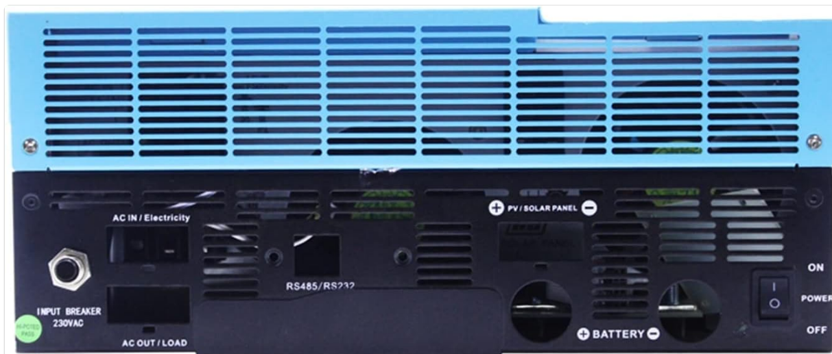
Figure 4.2: Close-up view of the inverter's rear panel, showing terminals for AC IN/Electricity, AC OUT/LOAD, PV/SOLAR PANEL, BATTERY, RS485/RS232 ports, INPUT BREAKER 230VAC, and POWER ON/OFF switch.

3. Rear Panel Connections: The rear panel provides all necessary terminals for wiring.