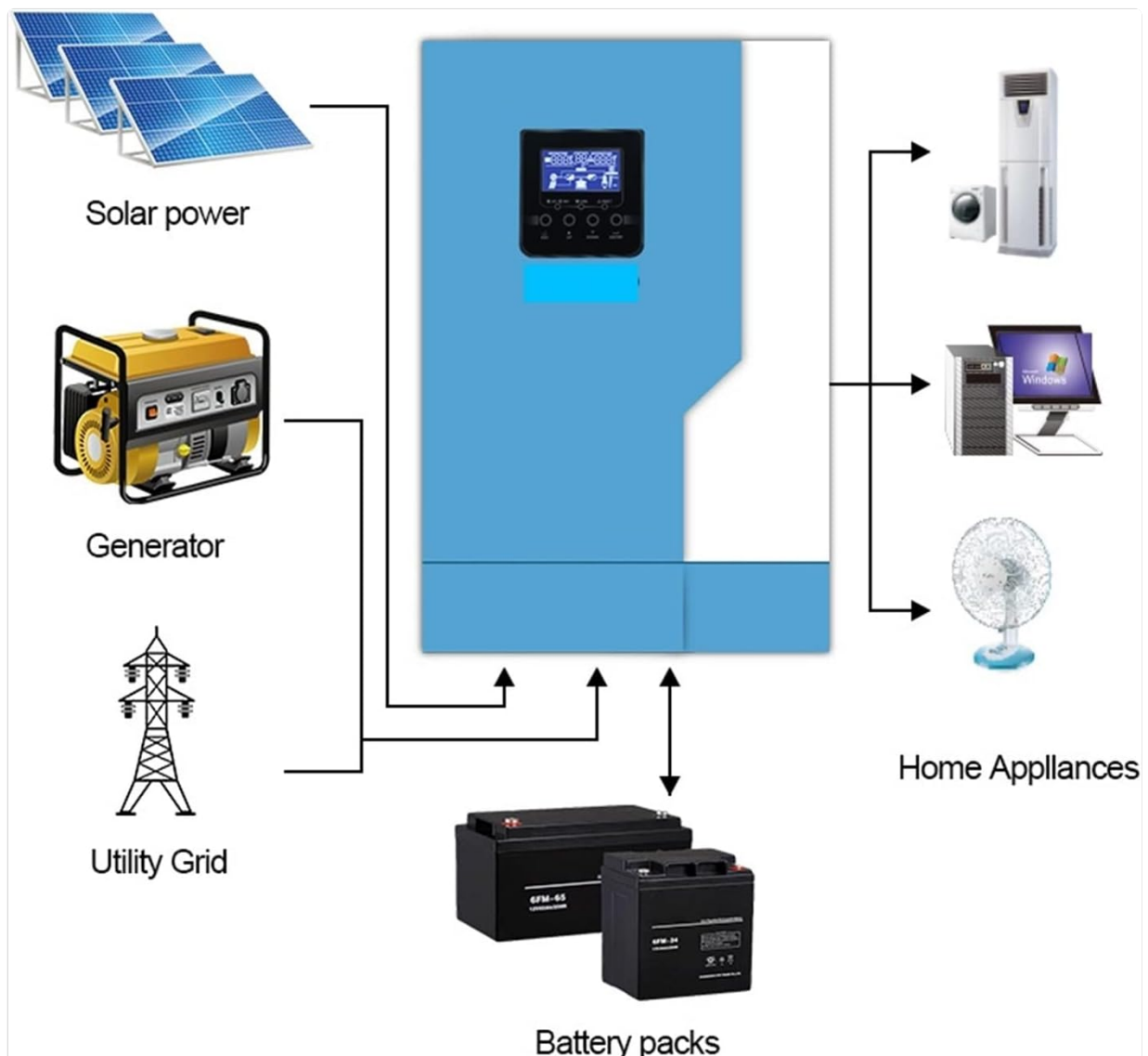
Figure 4.1: Diagram illustrating the typical connections for the hybrid solar inverter, including solar panels, generator, utility grid, battery packs, and various home appliances as loads.