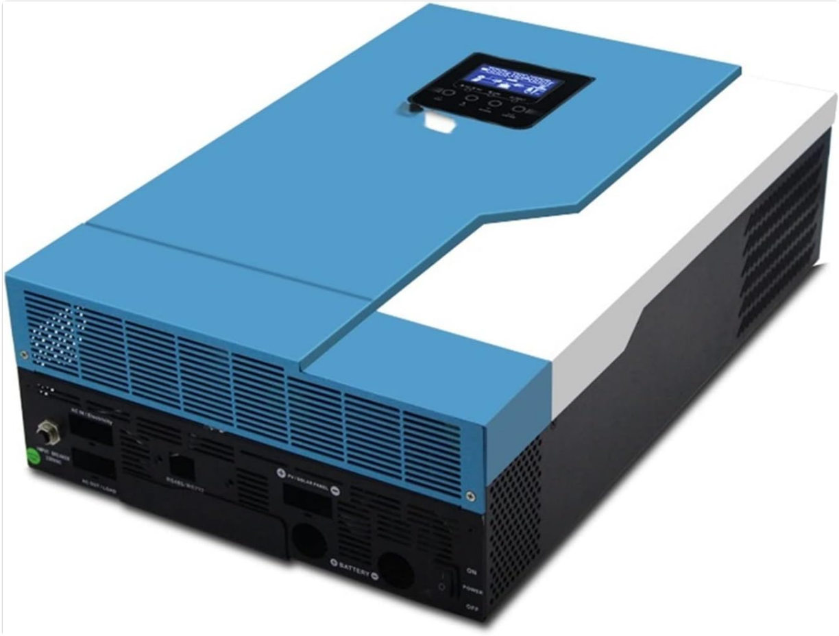
Figure 3.1: Front-top view of the HFFFXRKY 5.5KW Hybrid Solar Inverter, showing the blue and black casing with a digital display on top.

display for monitoring system status and settings. The unit integrates a powerful MPPT charge controller for efficient solar energy harvesting and a pure sine wave inverter for stable AC output.