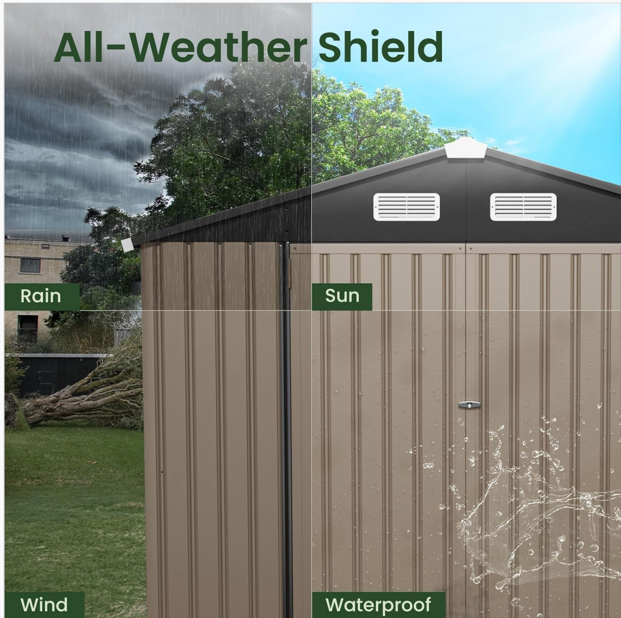
Image 3: All-Weather Shield. This image visually represents the shed's ability to withstand various weather conditions, including rain, sun, and wind, highlighting its waterproof and durable construction.