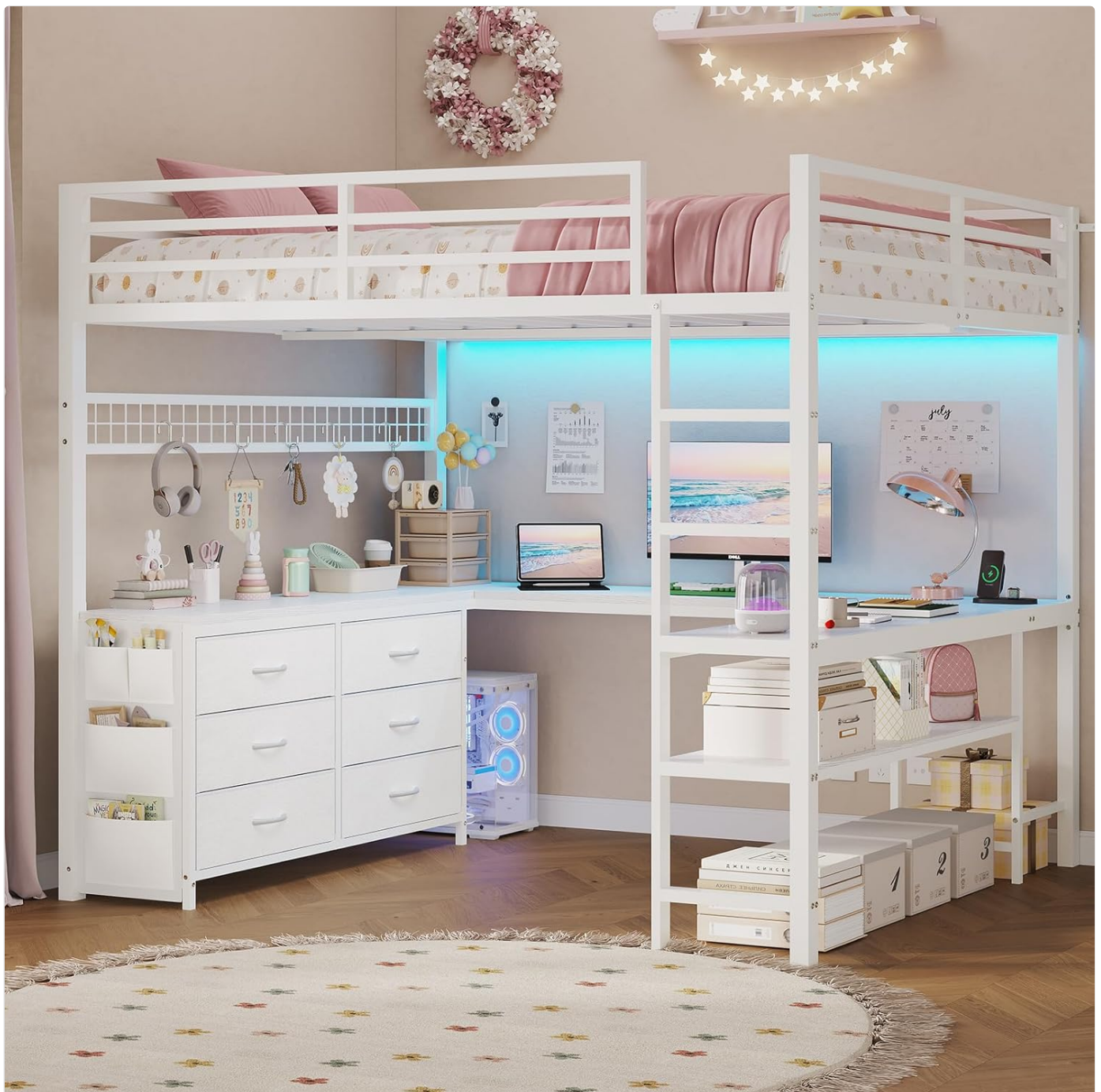
Figure 1: ADORNEVE Full Size Loft Bed with U-shaped Desk and LED Lights, showcasing its integrated design with a bed on top, a spacious U-shaped desk below, and various storage solutions.