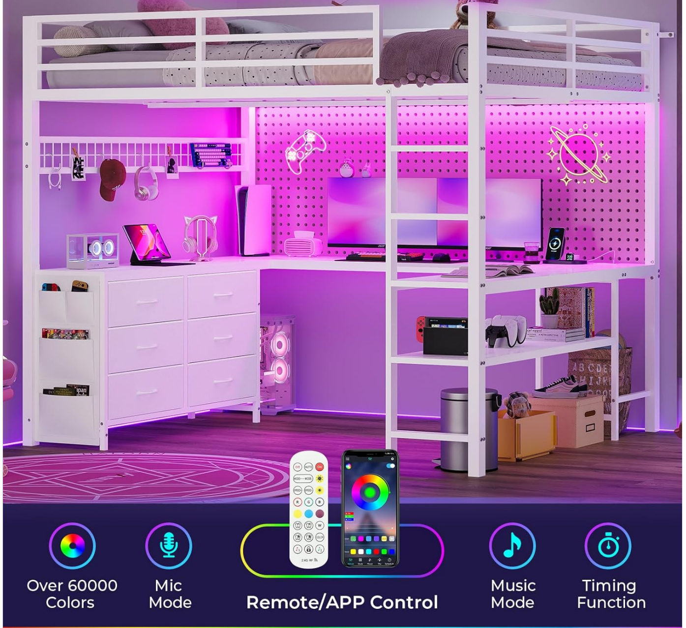
Figure 5: The loft bed illuminated by RGB LED lights, with an illustration of the remote and app control interface for color and mode selection.