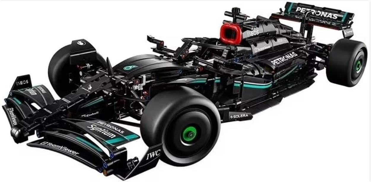
Image: Fully assembled Mercedes-Benz F1 W14 building block model, showcasing its intricate details and sleek design.