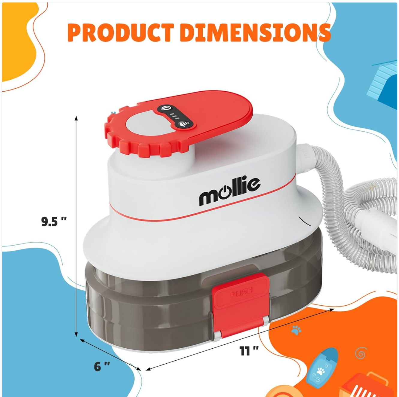
Image: A diagram illustrating the dimensions of the mollie Dog Grooming Vacuum and Dryer: 11 inches long, 6 inches wide, and 9.5 inches high.