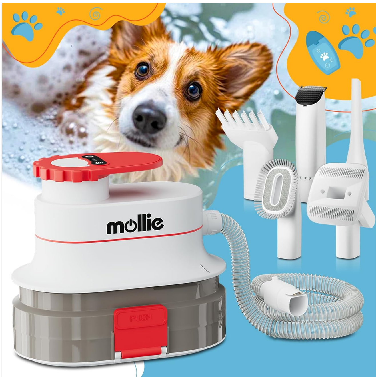
Image: The mollie Dog Grooming Vacuum and Dryer unit with its accompanying grooming tools, including brushes, clippers, and nozzles.