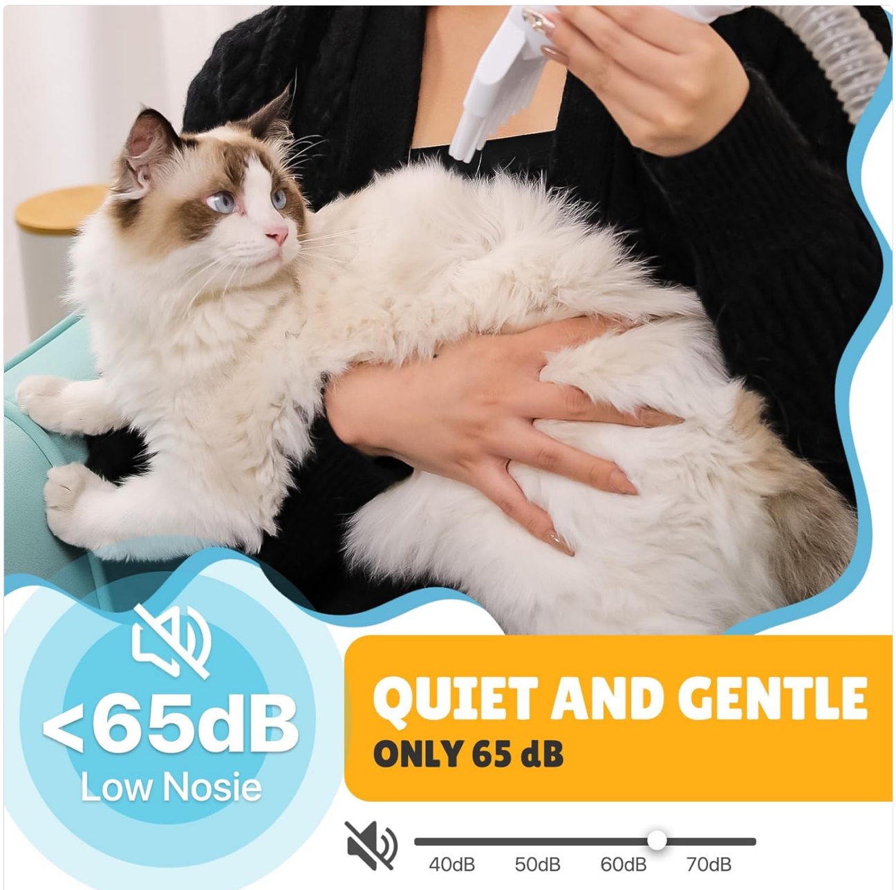
Image: A detailed view of the grooming brush head, showing the rounded bristles designed for gentle pet massage and effective hair collection.