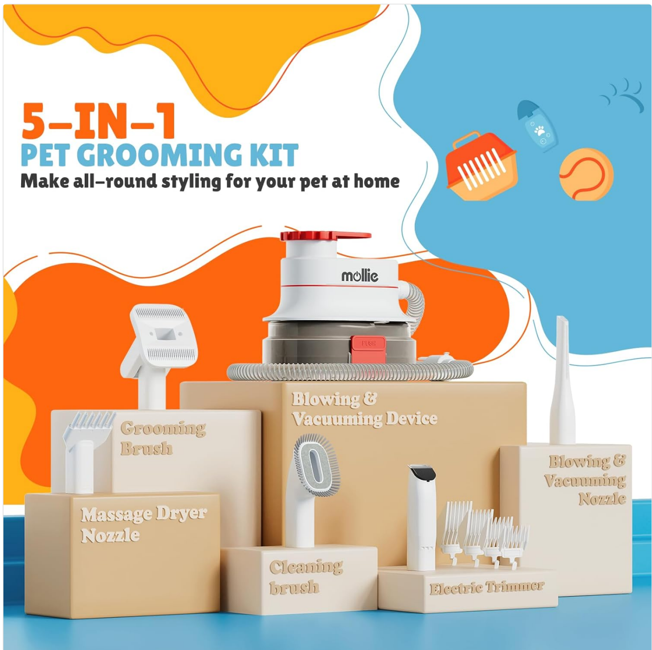
Image: An exploded view showing the main mollie unit and all five included grooming tools and clipper guards.