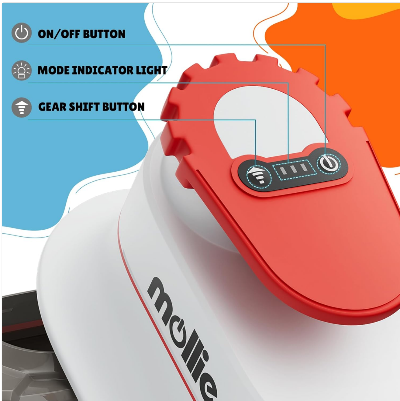
Image: A detailed view of the mollie unit's top panel, highlighting the On/Off button, mode indicator lights, and gear shift button.