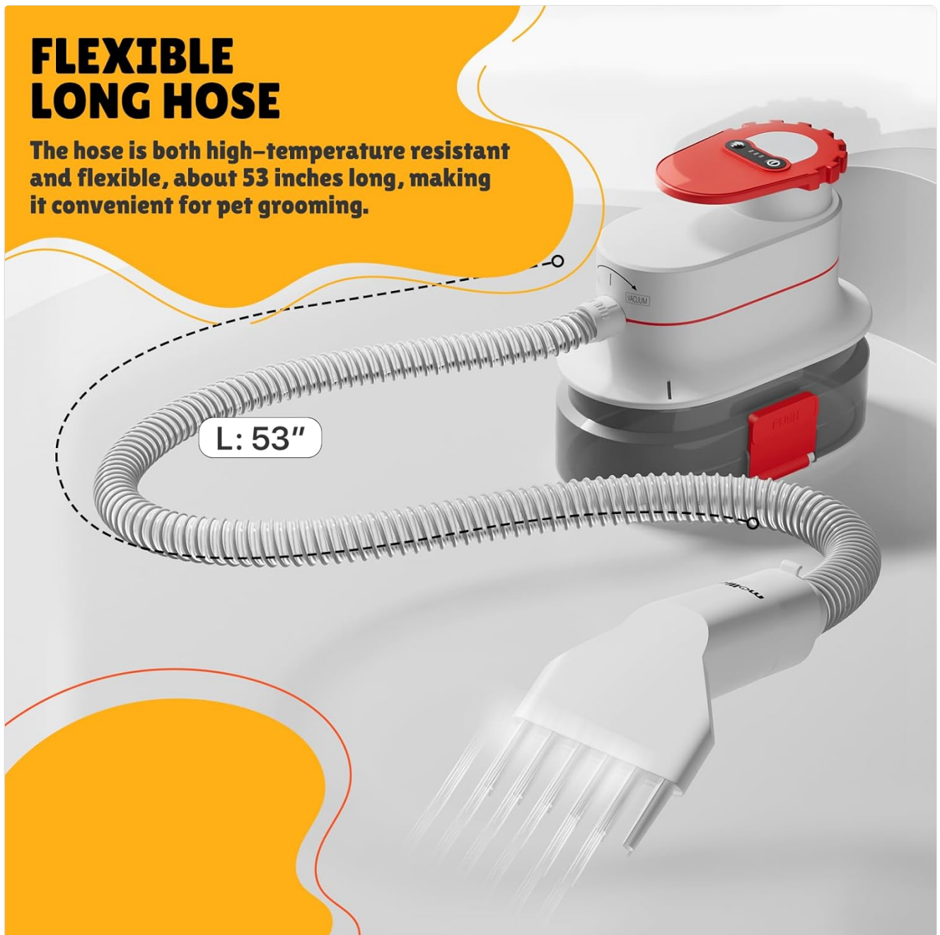
Image: The mollie main unit with the flexible, high-temperature resistant hose attached, demonstrating its length and flexibility.

The hose is both high-temperature resistant and flexible, about 53 inches long, making it convenient for pet grooming.