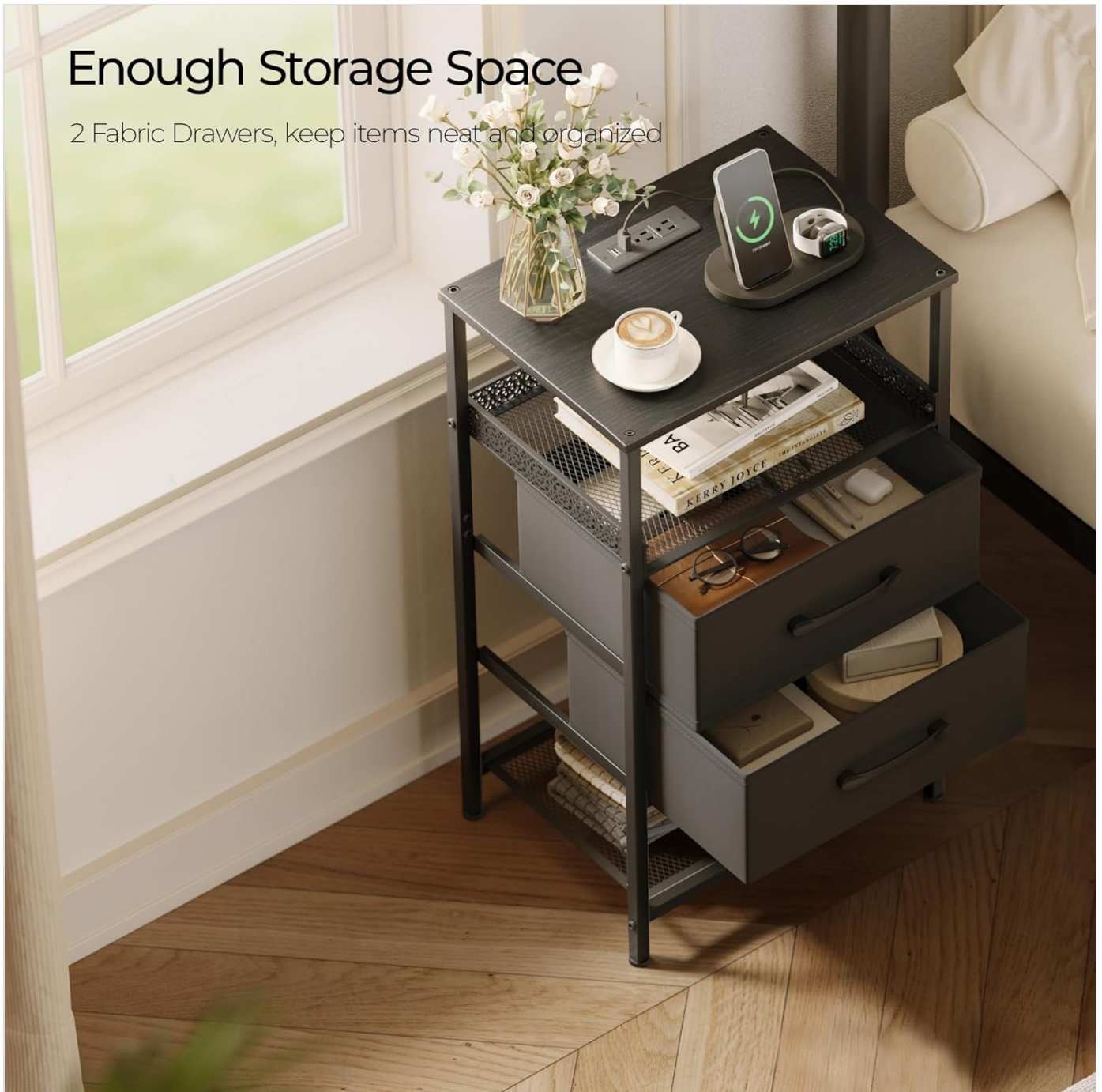
Figure 3: Charging Station in Use. This image highlights the integrated charging station on the nightstand's top surface, showing two AC outlets and two USB ports actively charging a smartphone, tablet, and smartwatch.

2 Fabric Drawers, keep items neat and organized