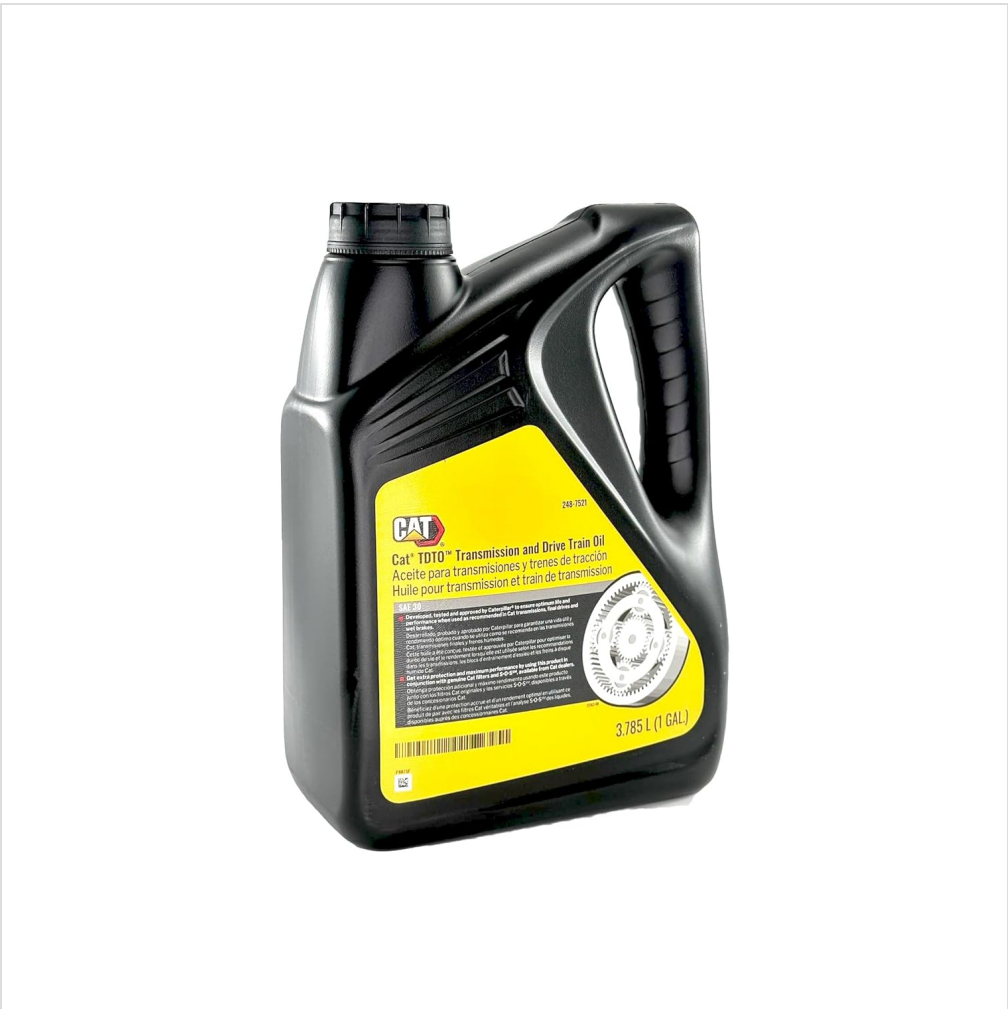
Figure 3: Angled view of the CAT TDTO 30 oil container, highlighting the ergonomic handle and overall design.

Proper disposal of used oil is crucial for environmental protection. Do not dispose of used oil in household waste, drains, or on the ground.