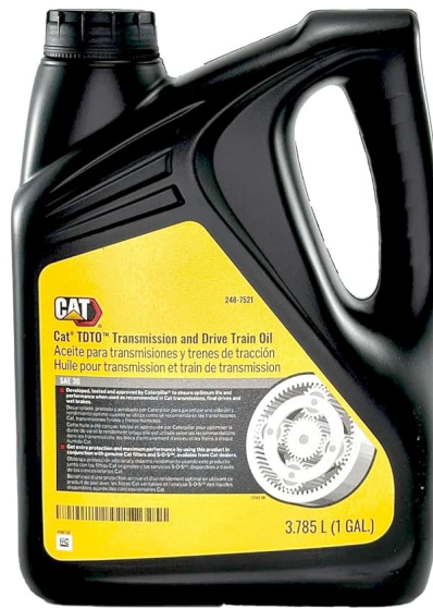
Figure 1: Front view of the CAT TDTO 30 oil container, showing the CAT logo, product name, and 3.785 L (1 GAL) volume marking.