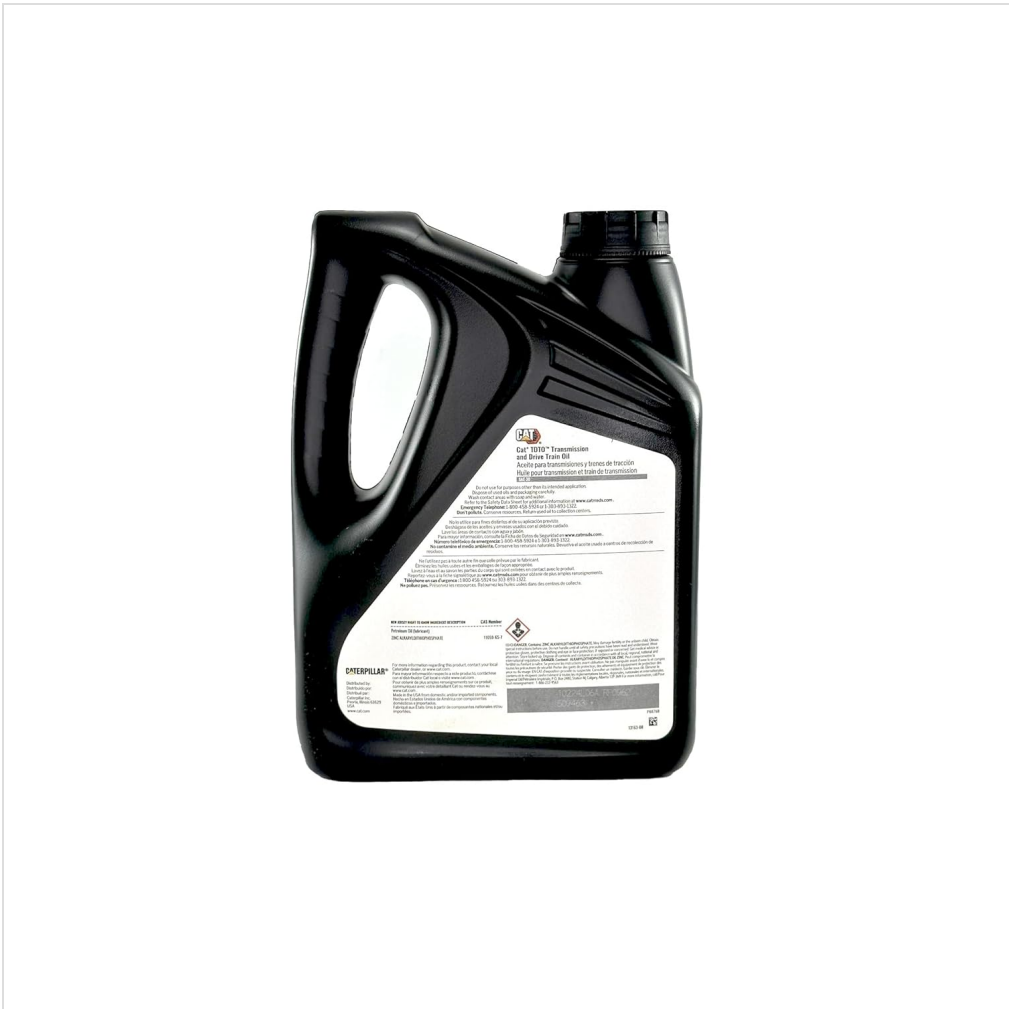
Figure 2: Back view of the CAT TDTO 30 oil container, displaying safety warnings, disposal information, and manufacturer details.