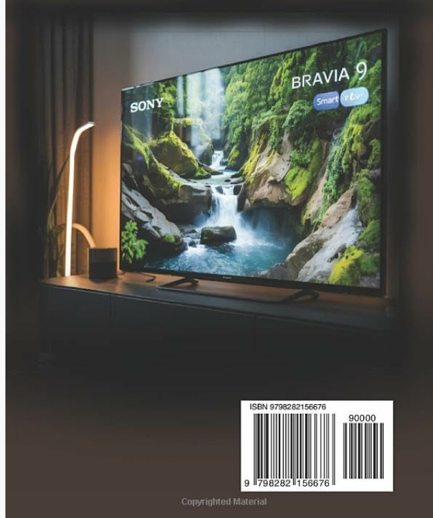
Image: Back cover of the user guide, featuring the Sony Bravia 9 Smart TV and the book's ISBN.

Take control of your Sony Bravia 9 Smart TV with this easy-to-follow guide. From setup and streaming to voice control and advanced settings, this book walks you through everything you need to enjoy a smarter, more immersive home entertainment experience.