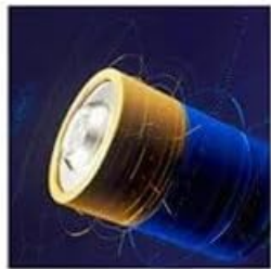
Battery Capacity 12V/9AH Battery