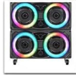
Dust proof iron mesh cover