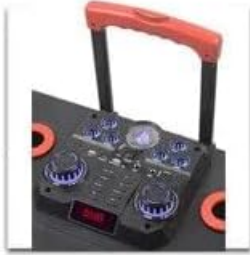
Thickened plastic shell