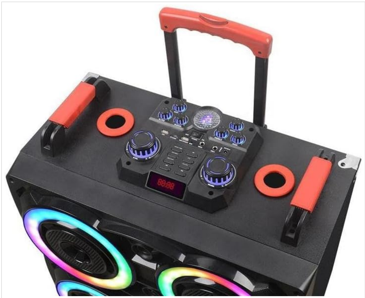
Image: A detailed view of the speaker's top control panel, showing the various input ports, volume knobs, mode selection buttons, and the digital display for controlling audio playback and settings.