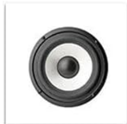
Drive Unit Four 8 inch

Image: A visual representation highlighting key structural and component advantages of the speaker, such as its durable plastic shell, protective iron mesh covers for the speakers, the 12V/9Ah battery, and the four 8-inch speaker drive units.