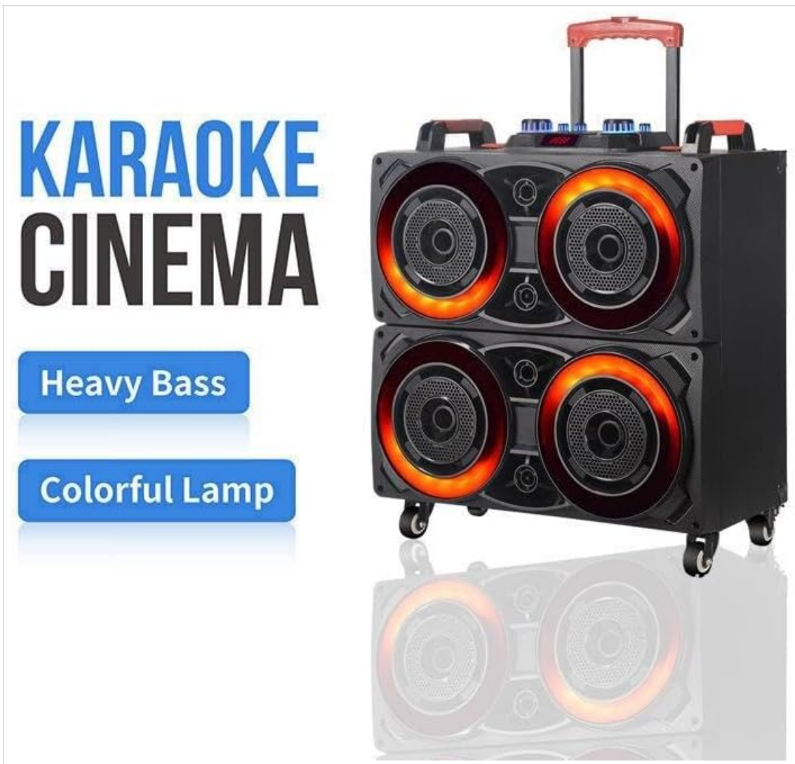
Image: The speaker highlighting its capabilities for "KARAOKE CINEMA" with features like "Heavy Bass" and "Colorful Lamp" effects, indicating its suitability for entertainment purposes.