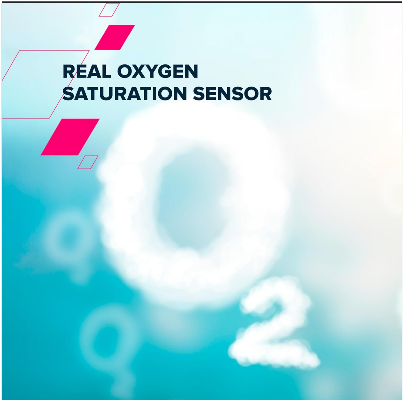
Figure 3: The smartwatch showing real-time health metrics, such as heart rate or SpO2 levels.

Access these features through the health menu on your watch or view detailed reports in the CANYON Life App.