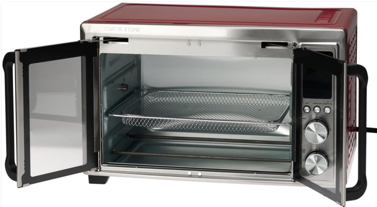
Figure 3: Interior view of the oven, demonstrating its capacity and accessory placement.