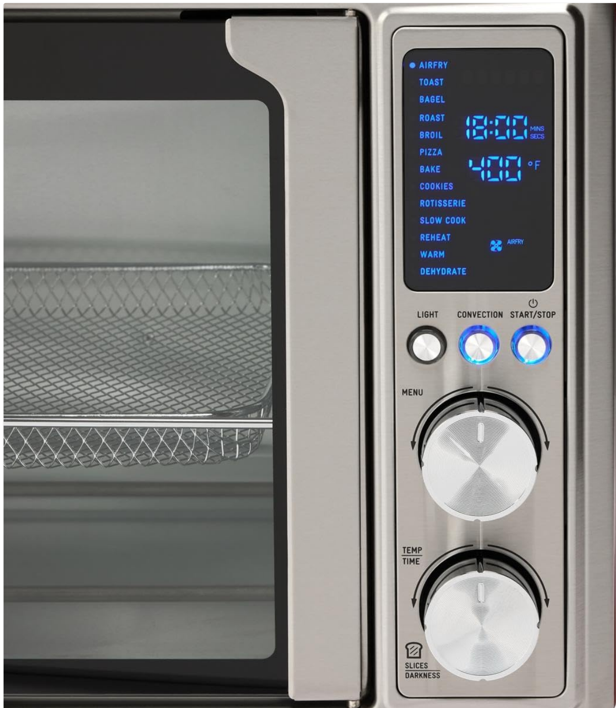
Figure 4: Digital control panel with function display, time/temperature knobs, and control buttons.

The control panel features a digital display, function selection buttons, and rotary knobs for adjusting time and temperature.