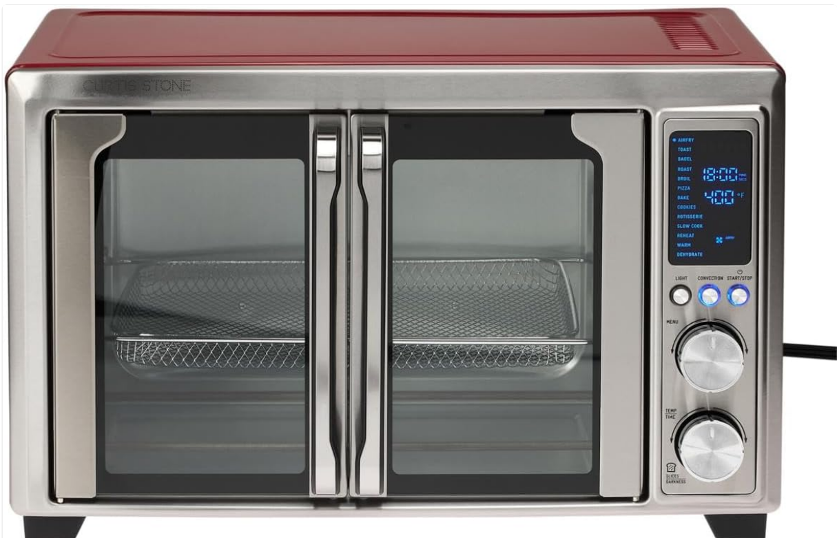
Figure 1: Front view of the Curtis Stone 32-Quart Digital Airfryer Oven.

This manual provides essential information for the safe and effective use of your Curtis Stone 32-Quart Digital Airfryer Oven, Model 873-110. Please read all instructions carefully before initial operation and retain this manual for future reference. This appliance is designed for household use only.