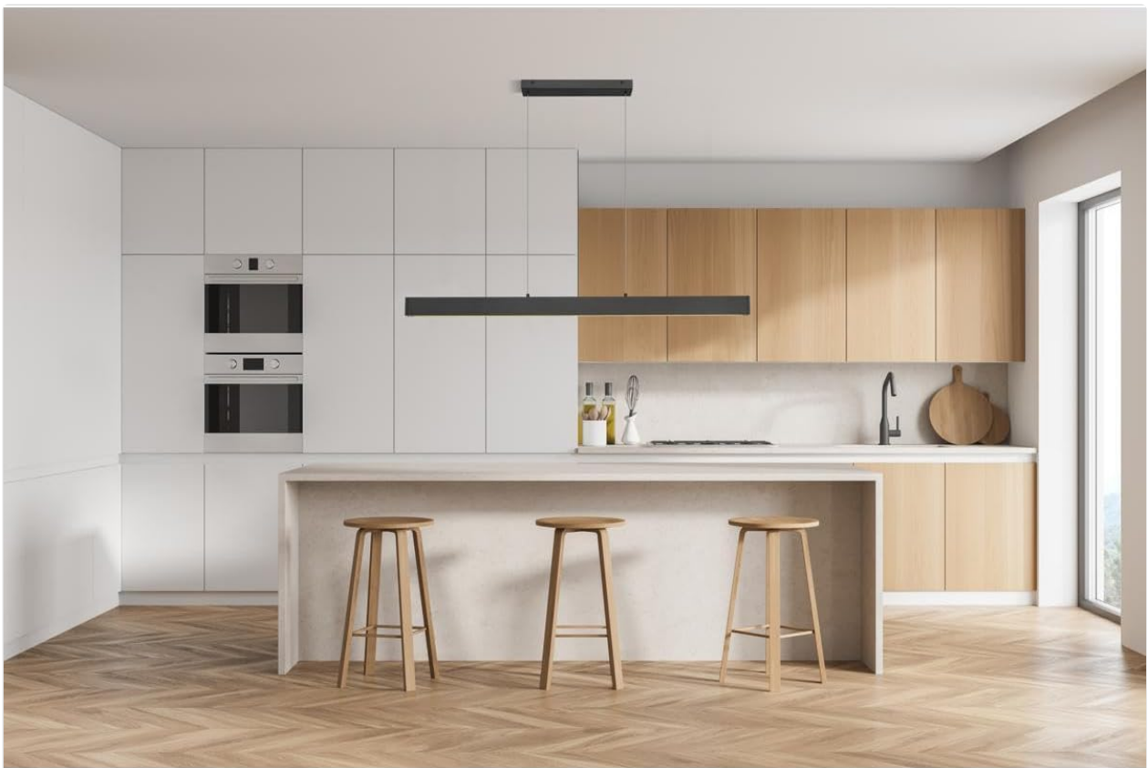
Figure 2: The Z-Lite Hudson Linear Chandelier installed in a modern kitchen setting, demonstrating its aesthetic and functional placement above an island.