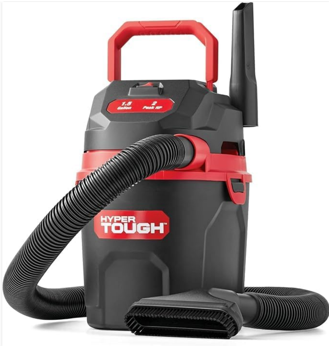
Figure 1: The Hyper-Tough 1.5 Gallon Wet Dry Vacuum, showcasing its compact design and included accessories.