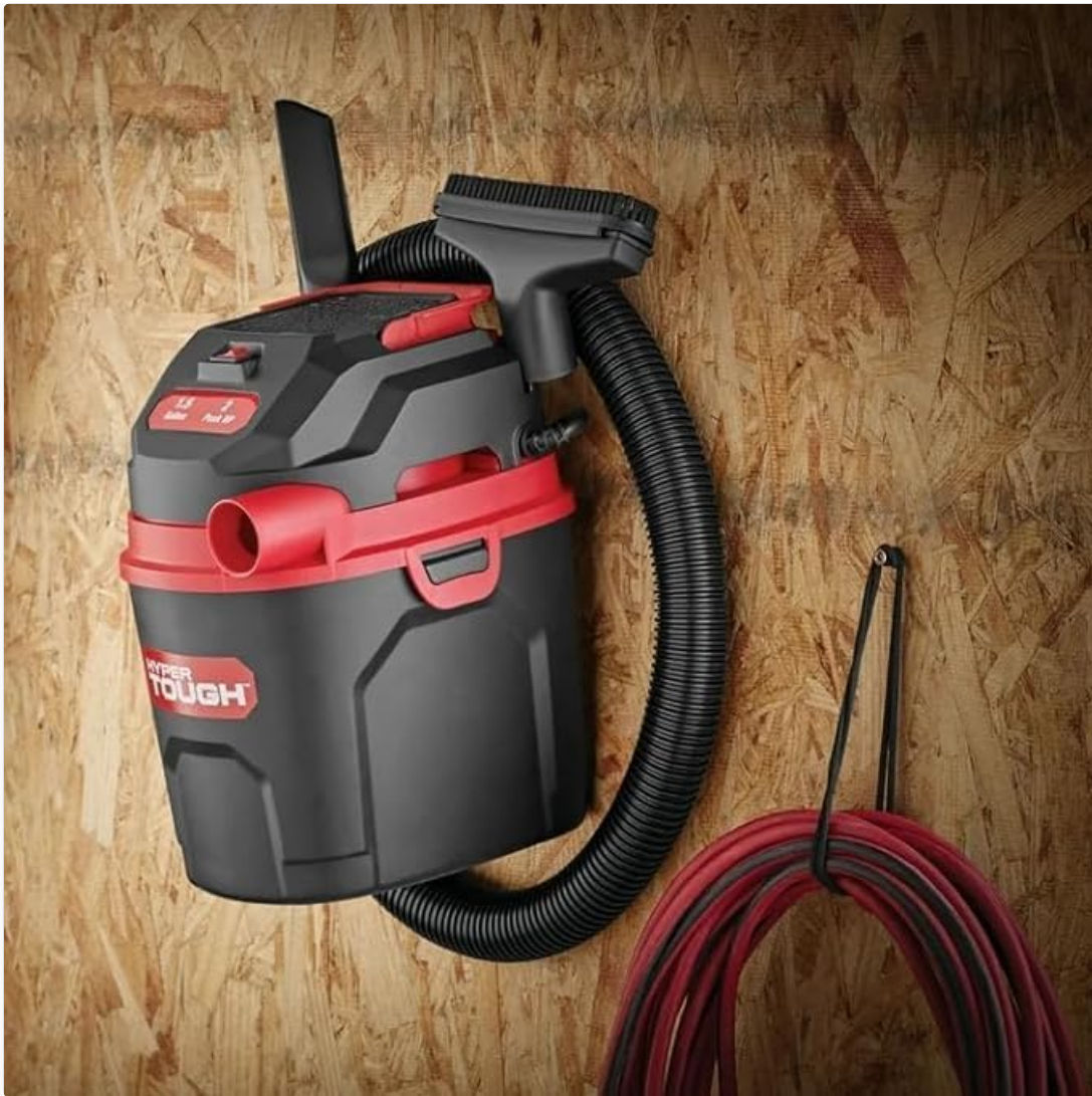
Figure 4: The Hyper-Tough vacuum conveniently stored using its wall mount bracket.