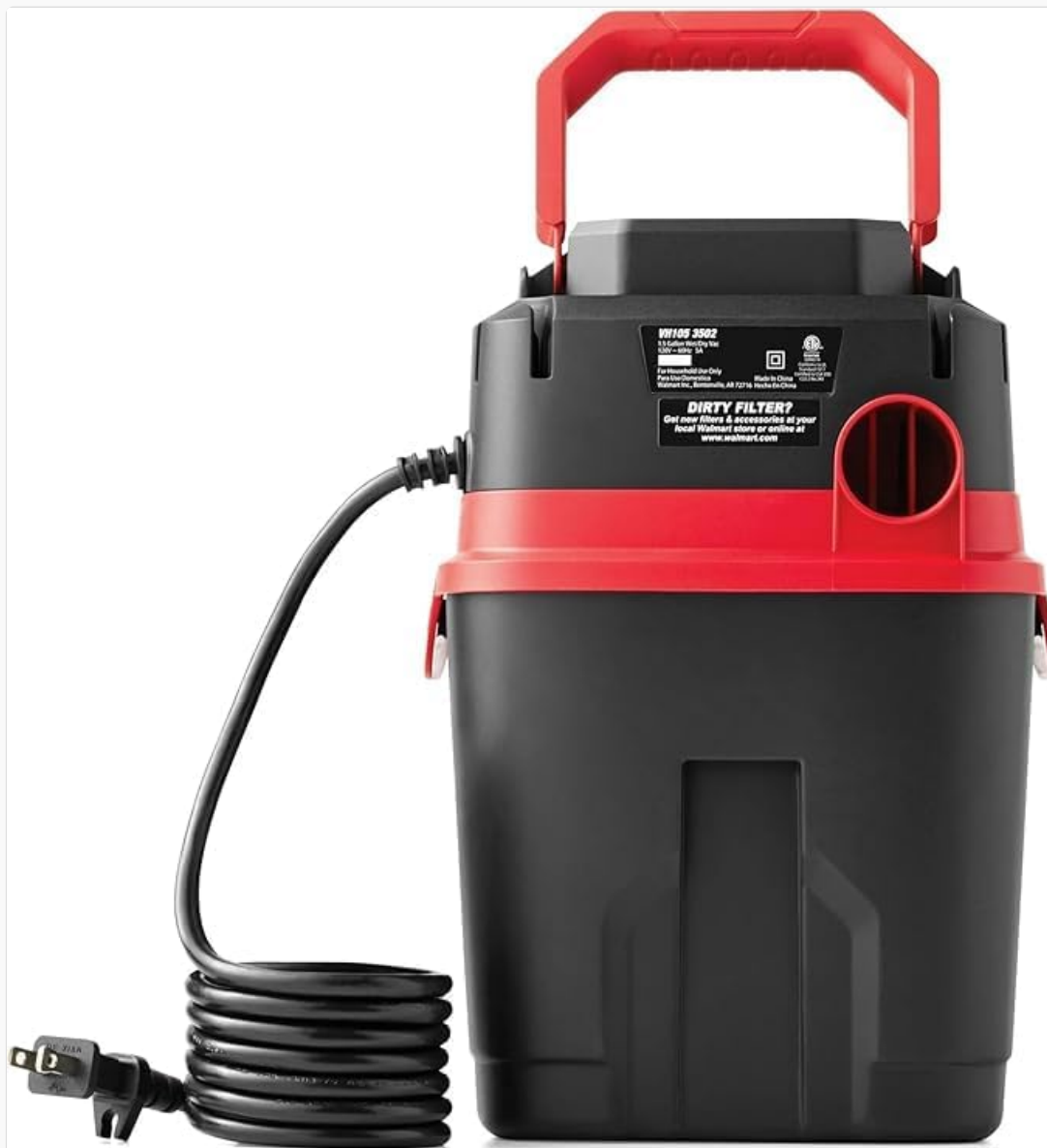
Figure 5: Rear view of the vacuum, highlighting the power cord and product label.

The Hyper-Tough wet dry vacuum also functions as a blower. To use the blower feature, remove the hose from the vacuum port on the front of the power head. Locate the blower port, typically on the back or side of the power head. Insert the larger end of the hose firmly into the blower port. Attach a nozzle to the other end of the hose if desired. Plug in the vacuum and turn it on. This function is useful for clearing debris from workbenches, patios, or other surfaces.