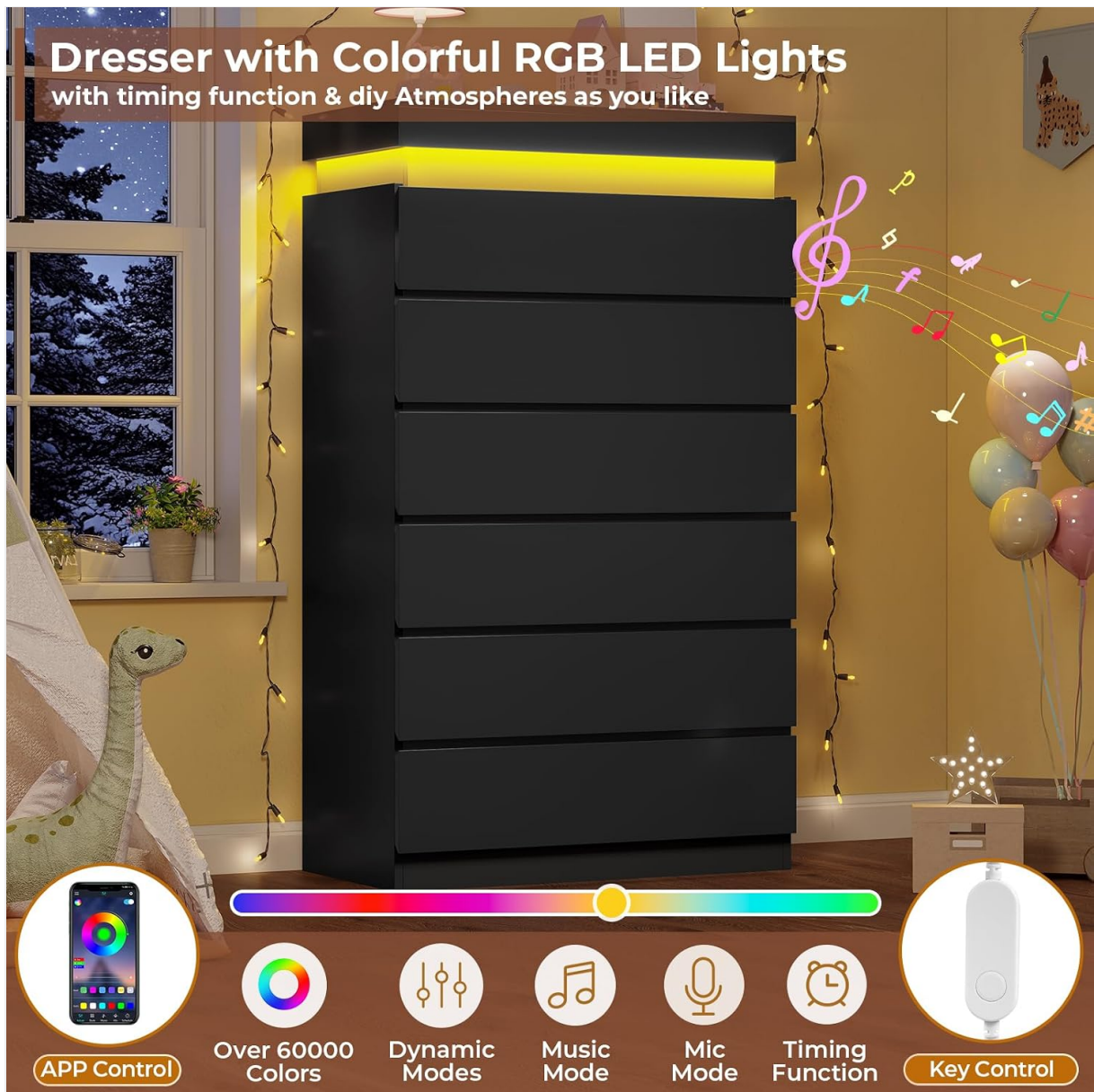
Image: The dresser highlighting its RGB LED light features, including APP control, dynamic modes, music mode, mic mode, timing function, and key control.

Your browser does not support the video tag.