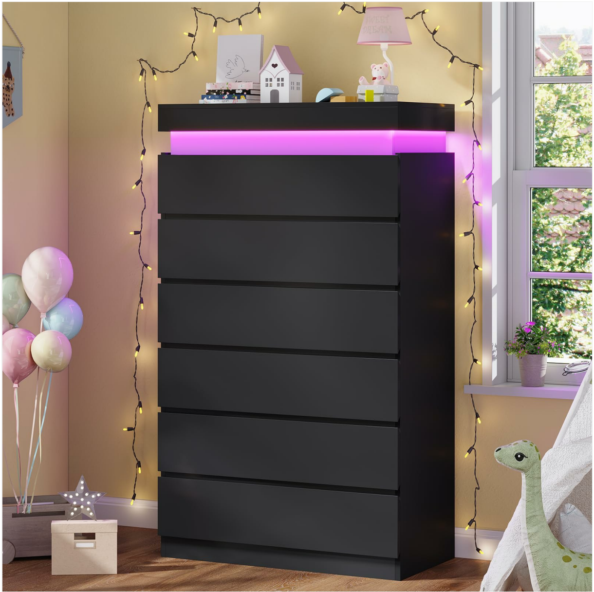
Image: Front view of the HAUOMS Tall 6 Drawer Dresser in black, showcasing its sleek design and illuminated LED strip.