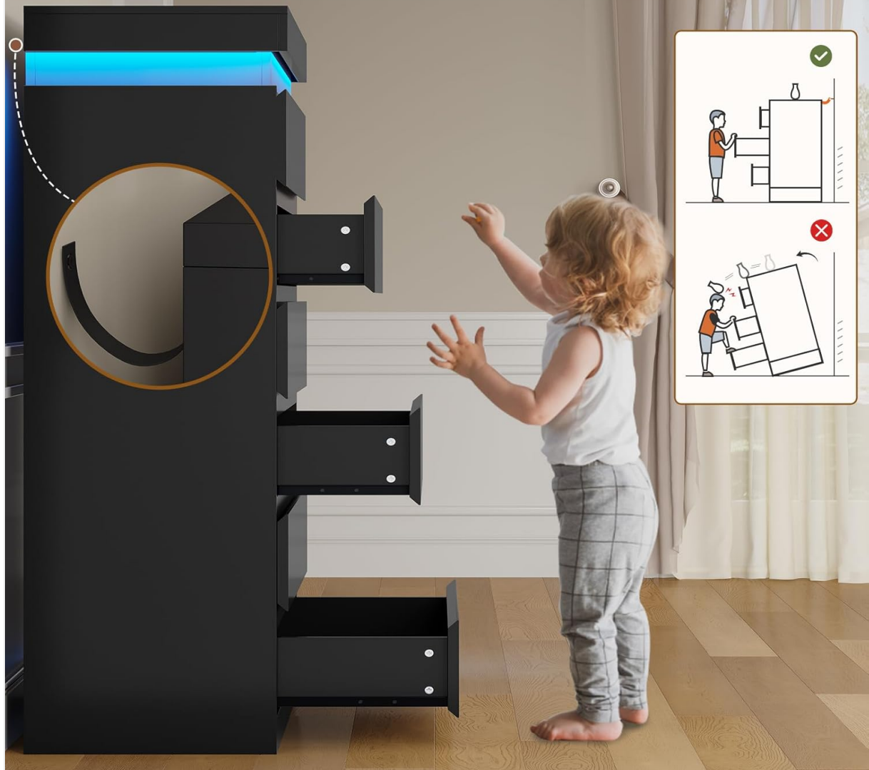
Image: Illustration of a child near the dresser and diagrams showing correct and incorrect use of the anti-tipping device. Always secure the dresser to the wall using the provided anti-tipping kit to prevent accidents.

Please fix the anti-tipping device to the wall