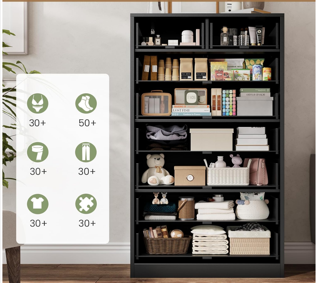
Image: The dresser's interior, highlighting its large storage capacity. It shows various items neatly organized on shelves, demonstrating how the 8 drawers can accommodate numerous clothing articles and accessories.