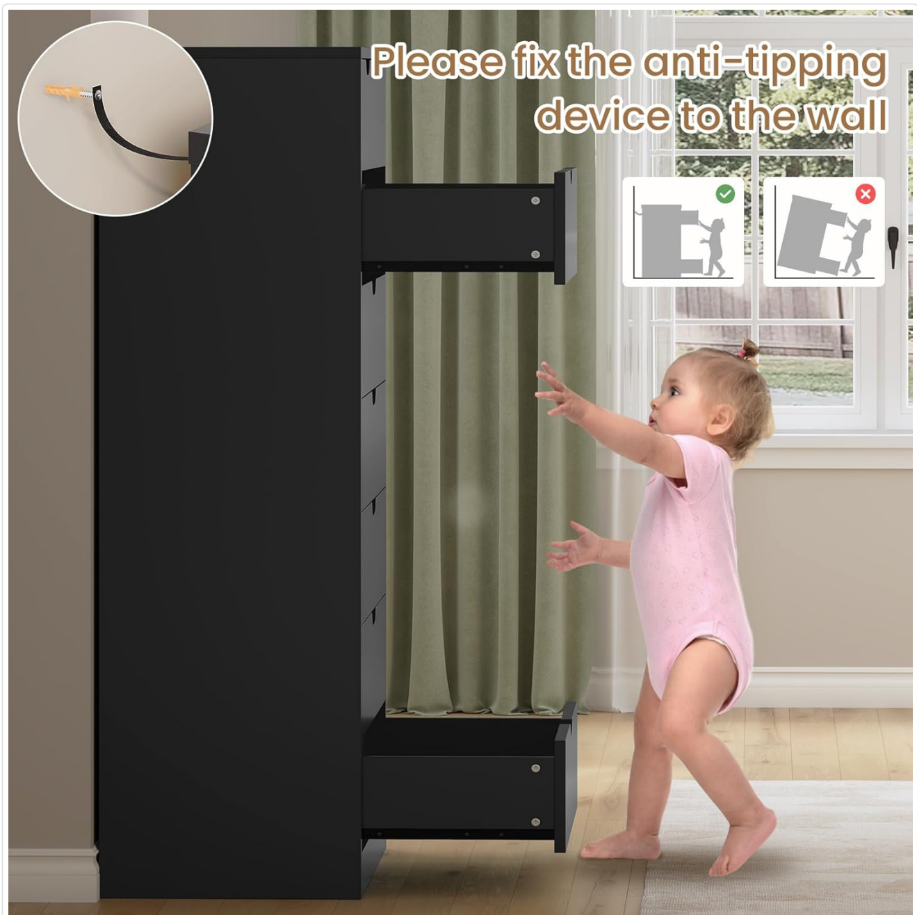
Image: Illustration of the anti-tipping device securely fastened to the wall, demonstrating how it prevents the dresser from falling forward. A child is shown nearby, emphasizing the importance of this safety feature.