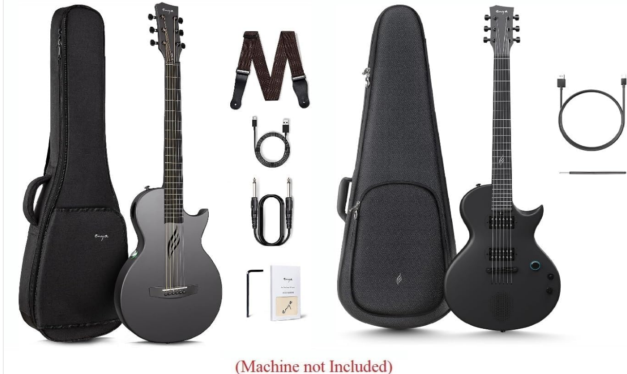
Image 1.1: eeTao AC Adapter Power Supply compatible with various enya NOVA GO electric guitar models. The image displays two guitars in cases, a guitar strap, and the charger with its cable, indicating the charger's intended use with these instruments.