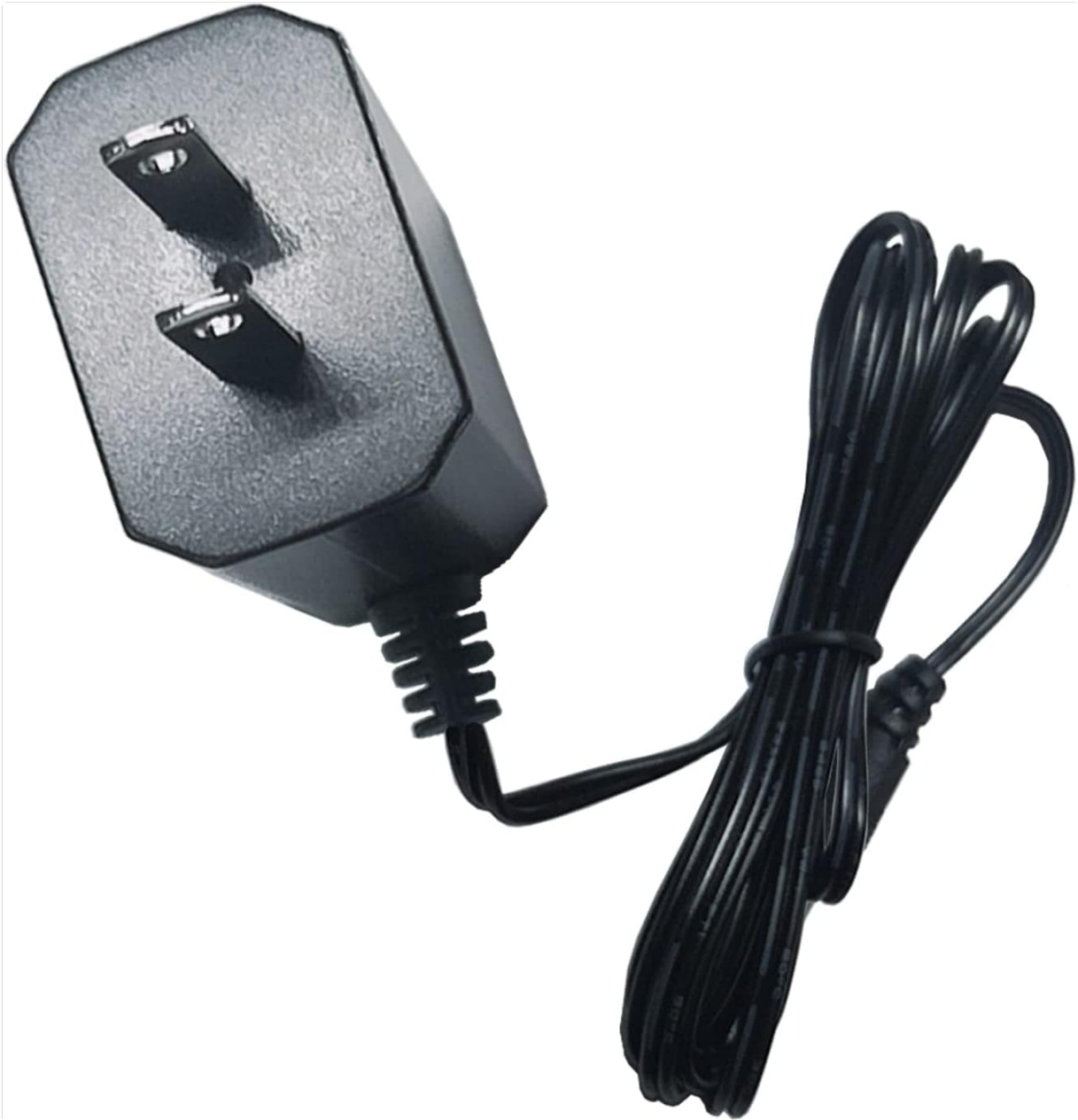
Image 4.1: The eeTao USB Type C Charger unit, showing the AC prongs for wall outlet connection and the integrated cable.