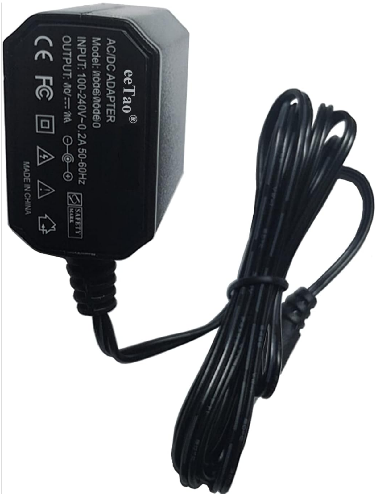
Image 8.1: The label on the eeTao AC/DC Adapter, displaying input and output specifications, model information, and safety certifications.