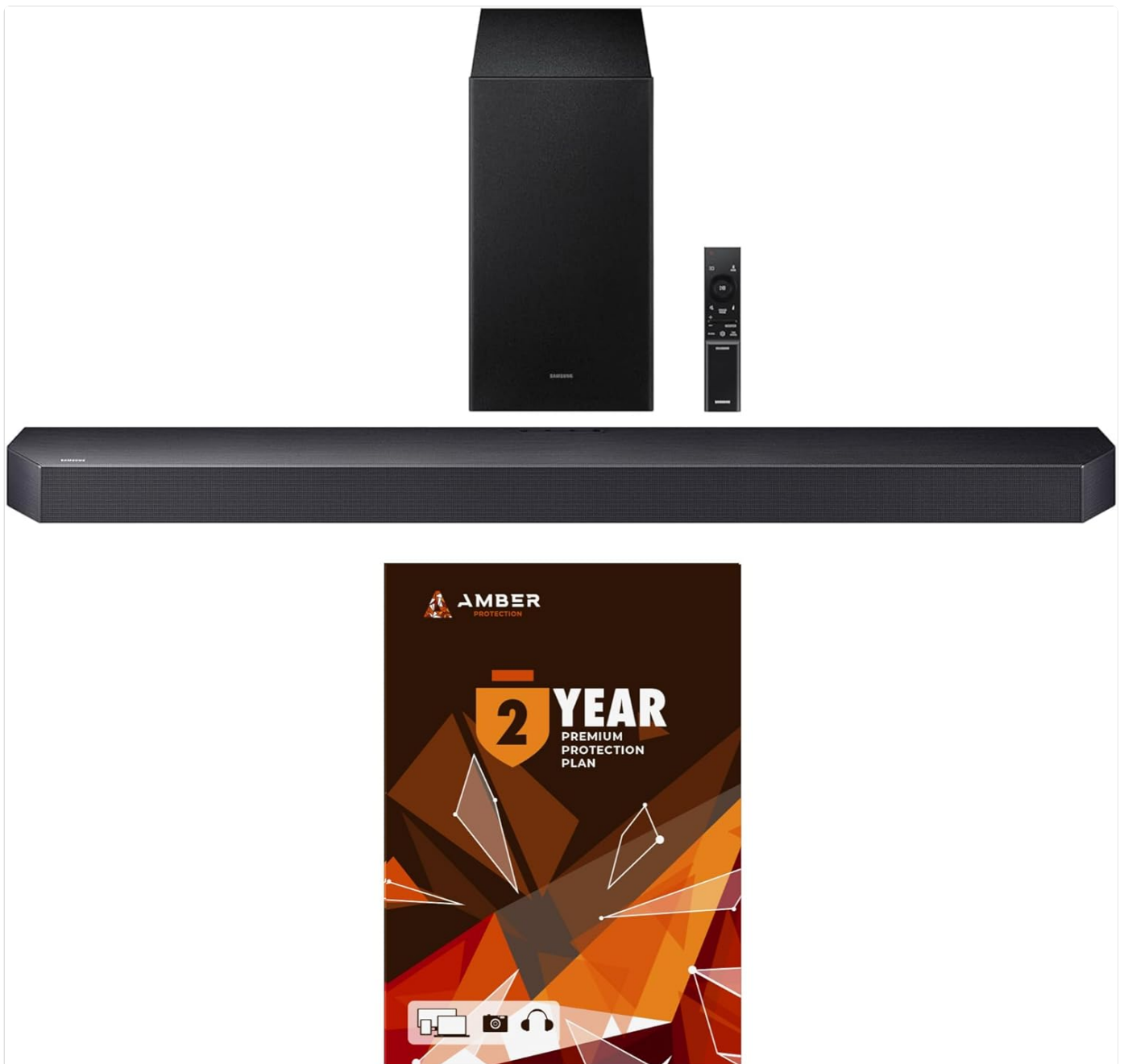
Image: All components included in the Samsung HW-Q600F Soundbar package.