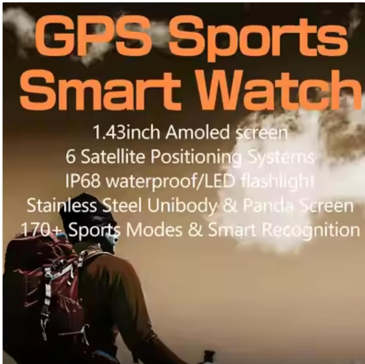
Figure 2: Overview of KELY PURE K67's advanced features and robust construction.