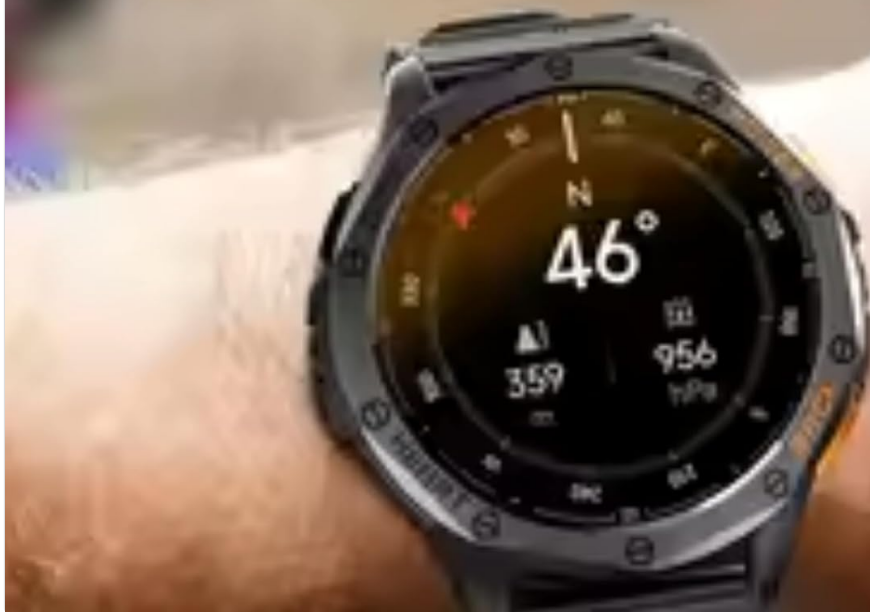
Figure 4: Built-in compass and barometric altimeter for navigation.