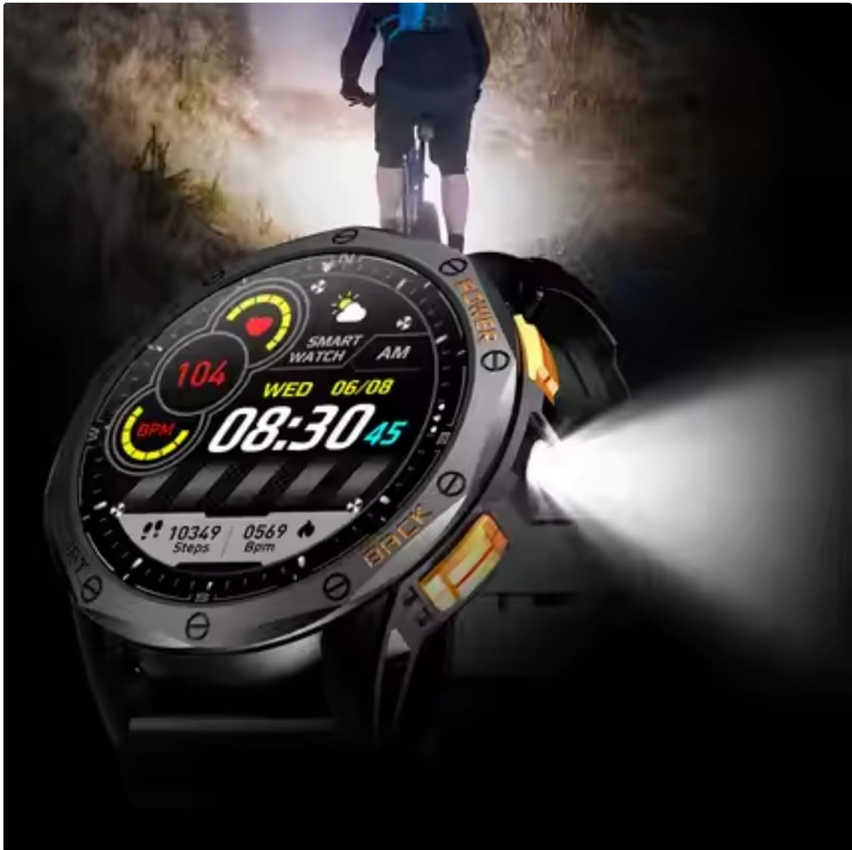
Figure 5: The integrated LED flashlight in action.