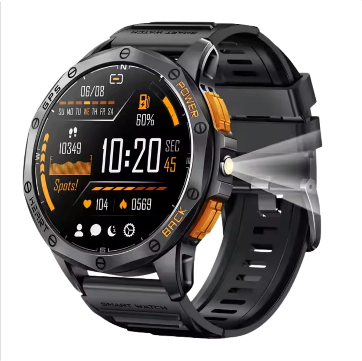
Figure 1: KELY PURE K67 Smart Watch displaying key metrics and its integrated LED flashlight.