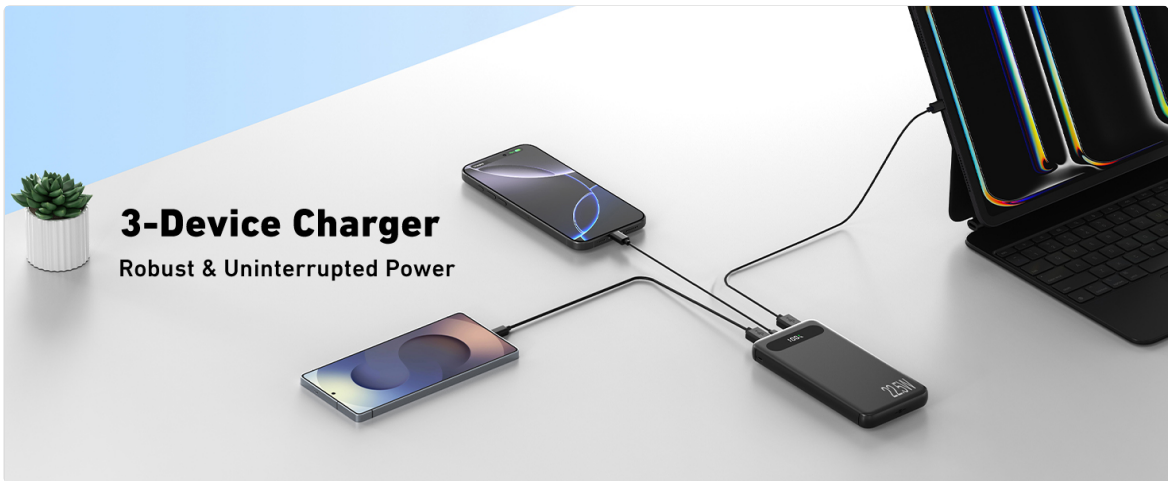
Image: A user charging multiple devices, including a tablet and smartphone, with the VANYUST 10000mAh portable charger, highlighting its capacity and the visible LED display.

The integrated LED display shows the precise percentage of remaining battery power. This allows you to monitor the power bank's charge status at any time.