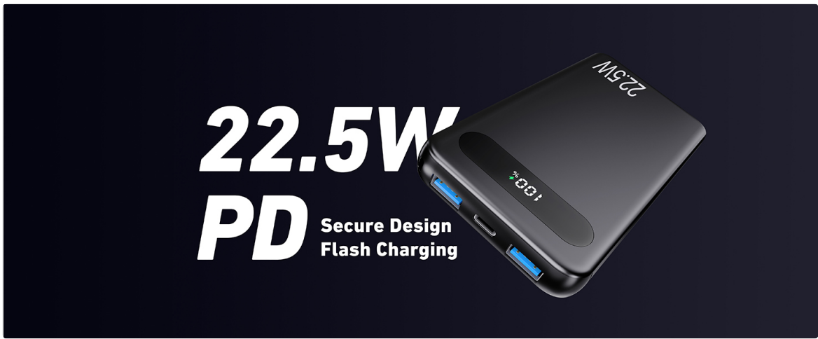
Image: The VANYUST Portable Charger demonstrating its 22.5W fast charging capability, rapidly powering a smartphone.