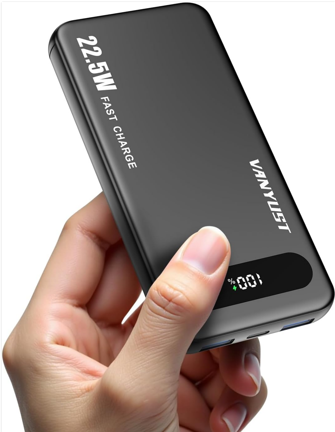
Image: The VANYUST Portable Charger S2121 in black, showcasing its sleek design and integrated LED battery display.