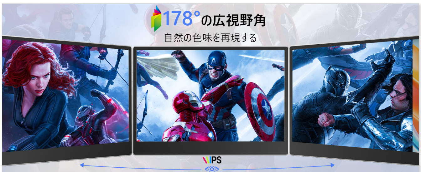
Image: Various display modes supported by the Laptomo Z1 monitor.