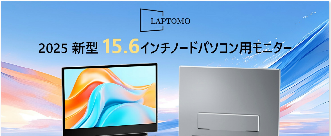
Image: Visual representation of the monitor's key display features and specifications.