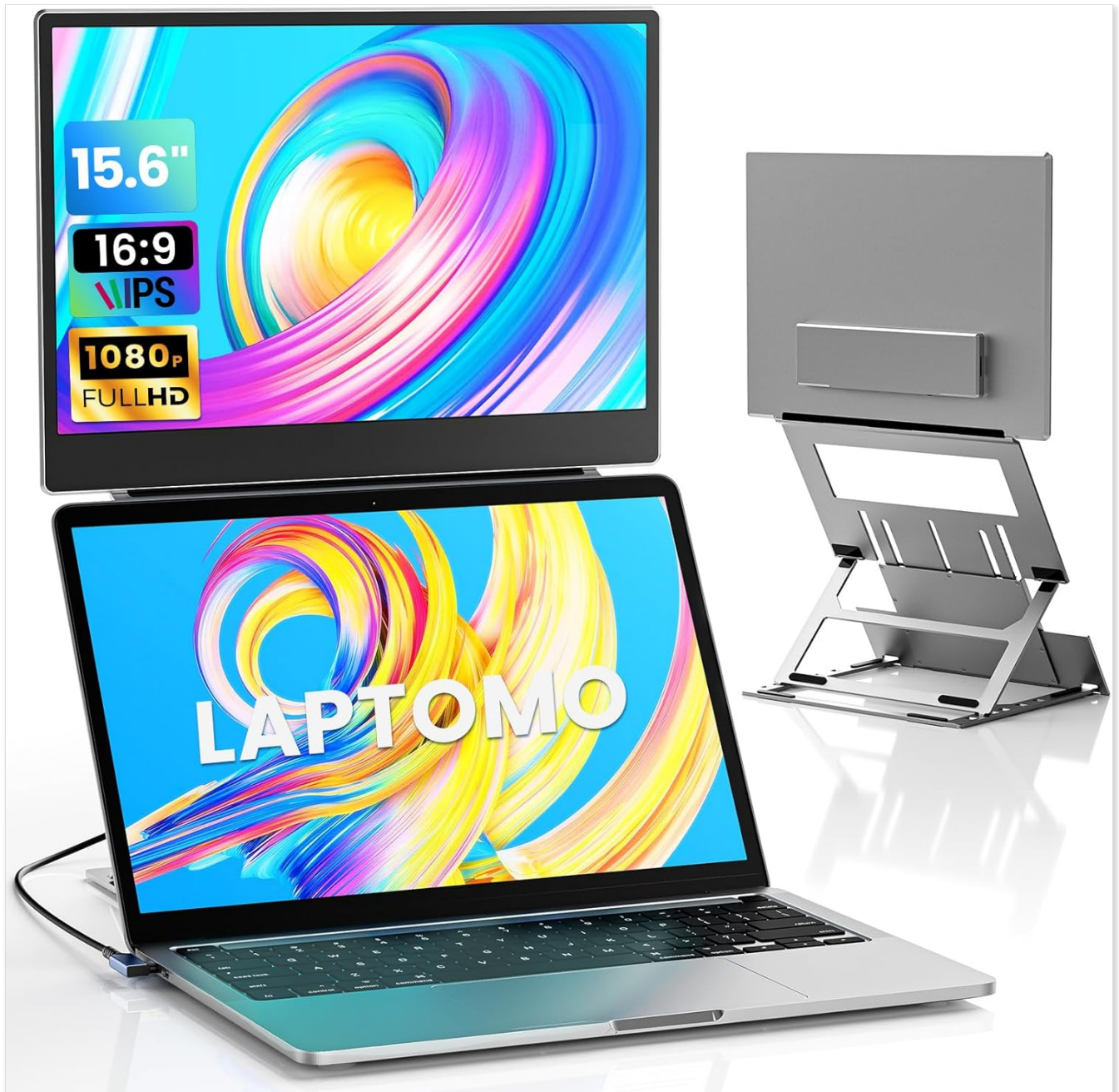
Image: The Laptomo Z1 portable monitor in use, extending a laptop's display, with its adjustable stand visible.