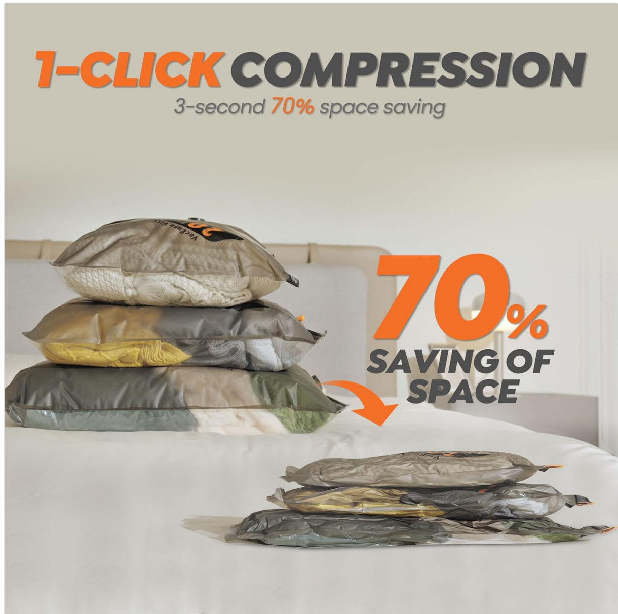
Image: A visual comparison showing a stack of uncompressed items next to a significantly smaller stack of the same items after being compressed in Vacbird vacuum bags, highlighting a 70% space saving.

Your items are now compressed and ready for storage or travel. The bags reduce bulk by up to 70%.