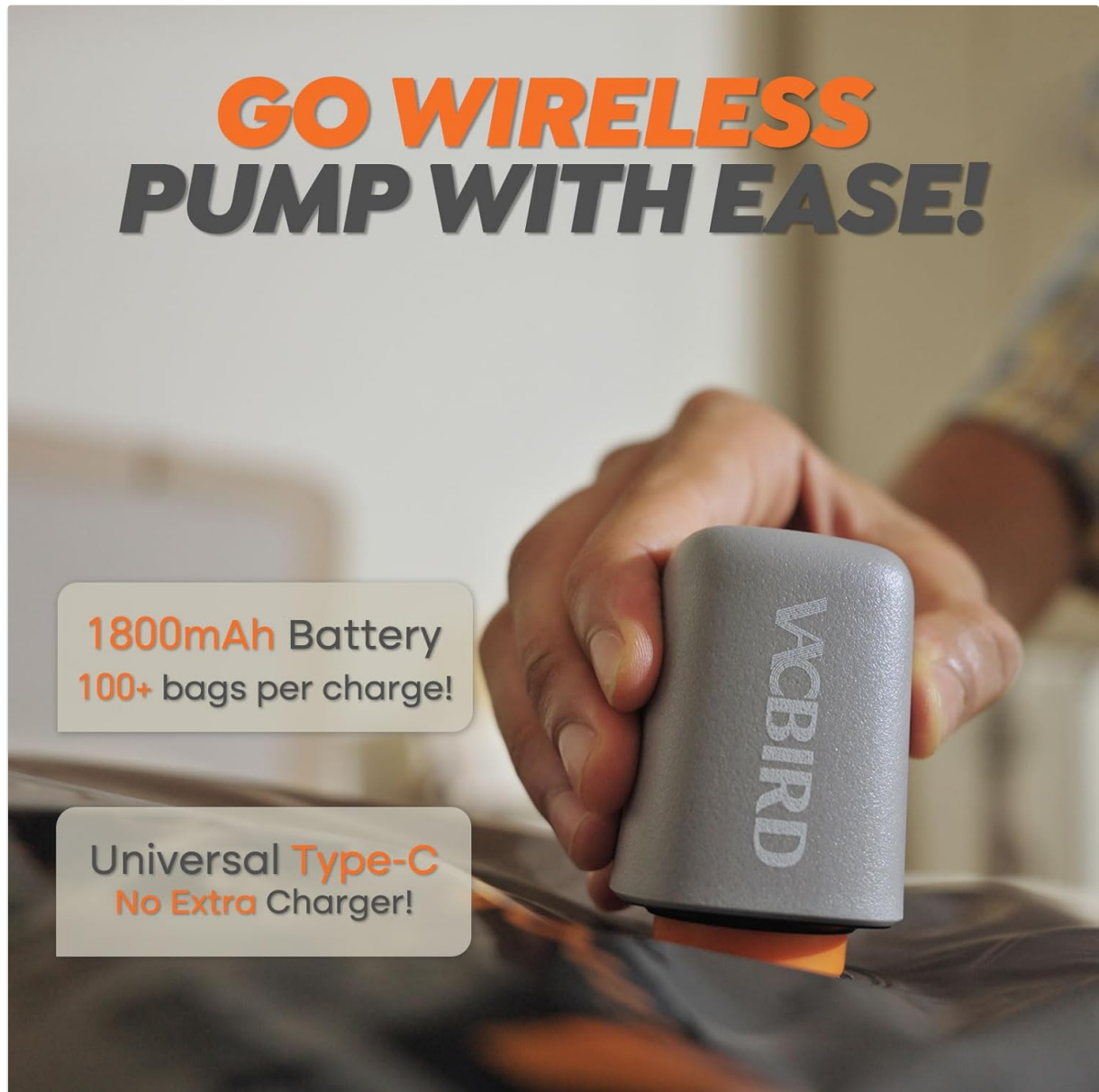
Image: A hand holding the Vacbird wireless pump, demonstrating its compact size and how it is placed onto a vacuum bag for operation. Text overlays indicate its 1800mAh battery and Type-C charging.