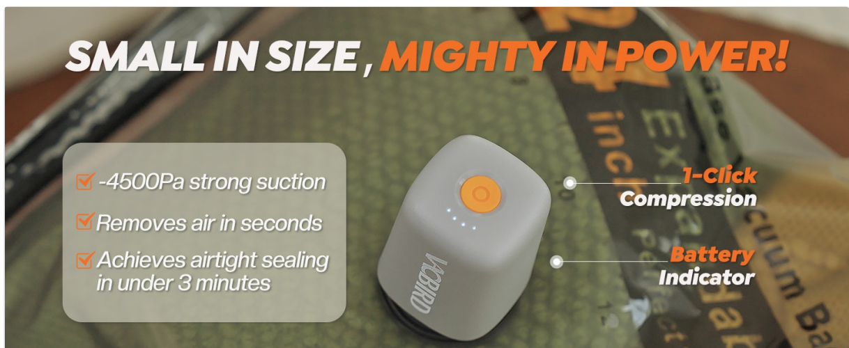
Image: A close-up view of the Vacbird wireless pump, highlighting its battery indicator lights and the universal Type-C charging port. The image emphasizes its portability and ease of charging.