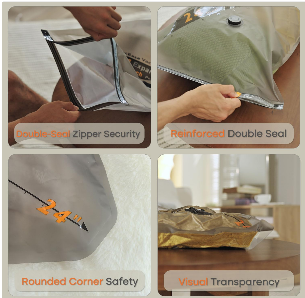
Image: A composite image illustrating key features of the Vacbird storage bags, including the double-seal zipper for security, reinforced sealing, rounded corners for safety, and visual transparency to easily identify contents.