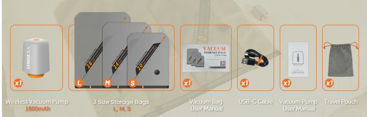
Image: Overview of the Vacbird Rechargeable Wireless Pump Travel Storage Bags Set, showing the wireless pump, three sizes of storage bags (Large, Medium, Small), a vacuum bag user manual, a USB-C charging cable, a vacuum pump user manual, and a travel pouch.