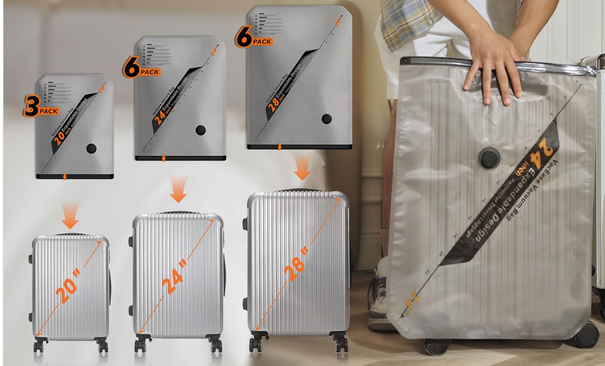
Image: An illustration showcasing the three different sizes of Vacbird vacuum bags (20-inch, 24-inch, and 28-inch) and how they correspond to various suitcase sizes, demonstrating their versatility for different storage needs.