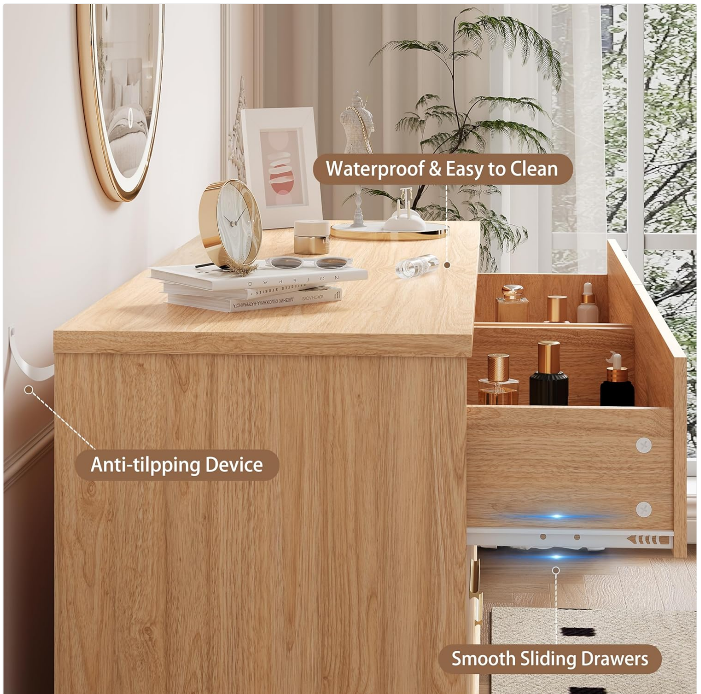
Image: Product dimensions, weight capacities, and anti-tipping device detail.