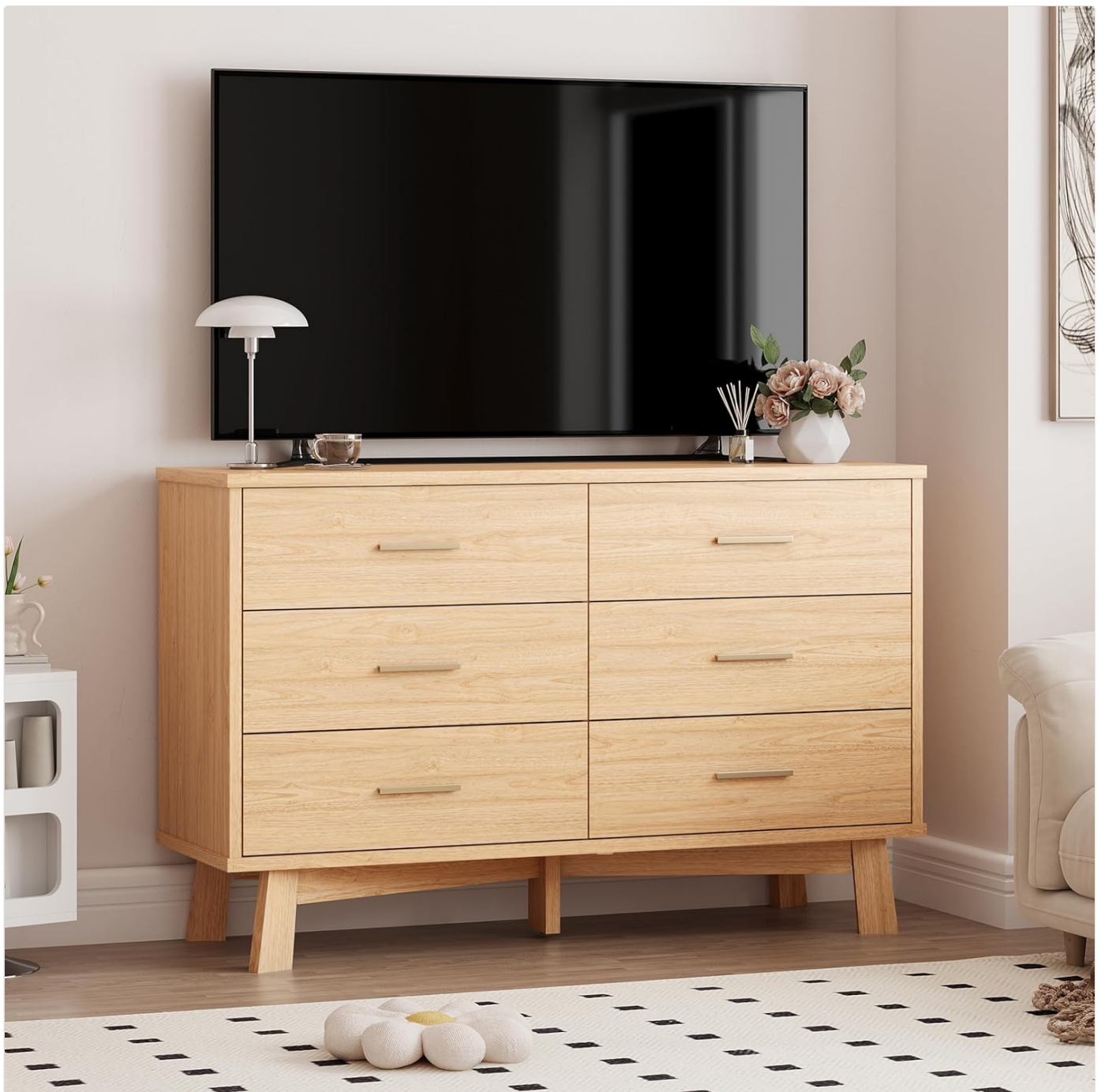
Image: Key structural features including adjustable feet and metal handles.