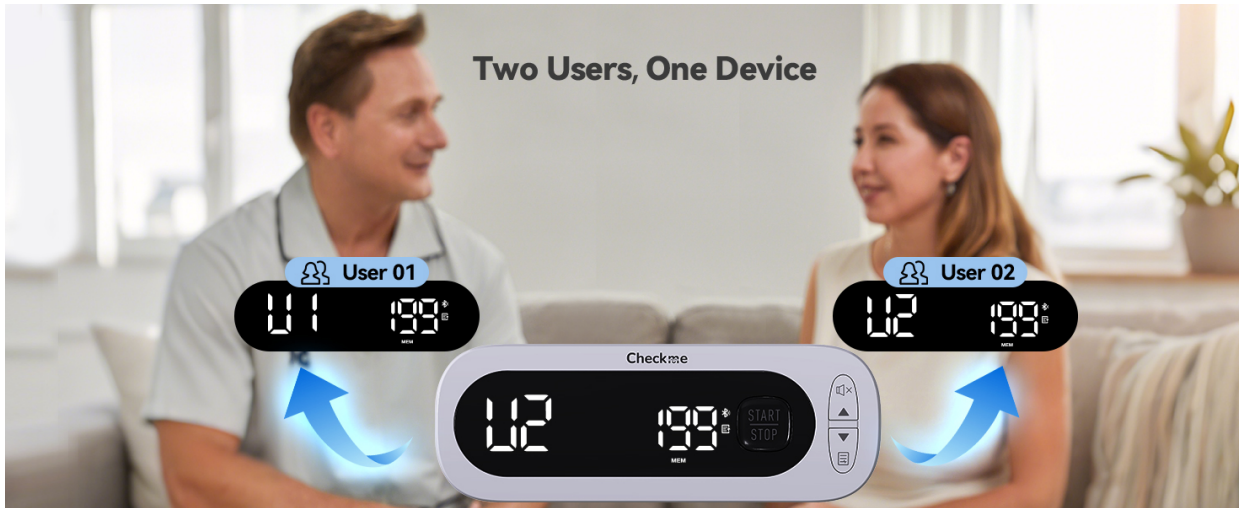
Image: Dual user storage feature on the blood pressure monitor.

The monitor supports two users (User 1 and User 2) and a guest mode. Each user can store up to 199 measurement results directly on the device. To switch between users, press the 'User/Forward' button when the monitor is off. To recall records, press the 'Memory/Backward' button (usually the middle button) and use the up/down buttons to navigate through stored readings. You can also delete individual or all records via the memory function.