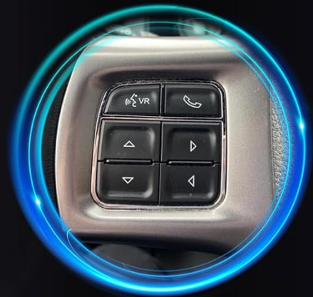
Image: The car stereo interface demonstrating support for front and rear cameras, alongside the integration of steering wheel controls.