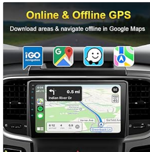
Image: The car stereo displaying navigation applications, illustrating online and offline GPS capabilities.

Navigate with confidence using built-in GPS, supporting both online and offline maps. The unit also features 4G SIM card slot compatibility and Wi-Fi hotspot capability for continuous connectivity and real-time traffic updates.