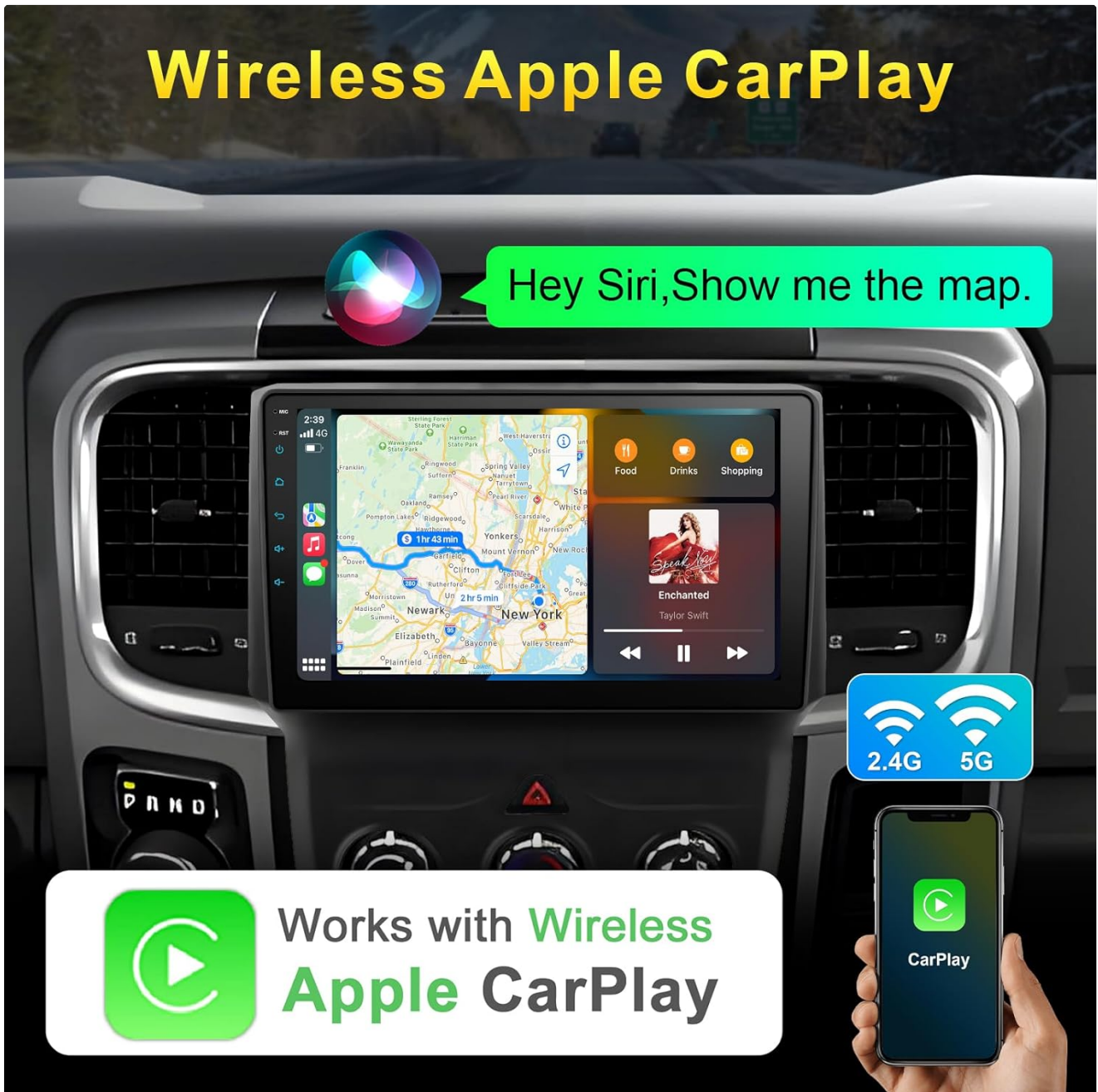
Image: The car stereo screen displaying the Apple CarPlay interface, featuring navigation and music controls.

Connect your smartphone wirelessly via Bluetooth or Wi-Fi to access Apple CarPlay or Android Auto. This feature allows for seamless integration of navigation, music streaming, hands-free calls, and messaging directly on the car stereo display.