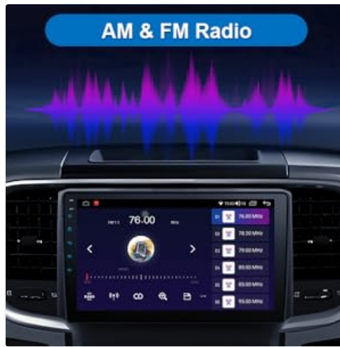
Image: The car stereo displaying the FM radio interface, showing frequency tuning options.