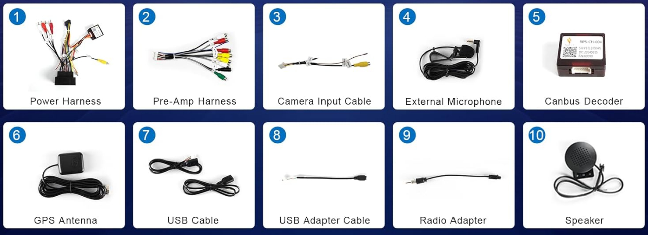
Image: A visual representation of the car stereo unit and its complete packing list, including cables and accessories.