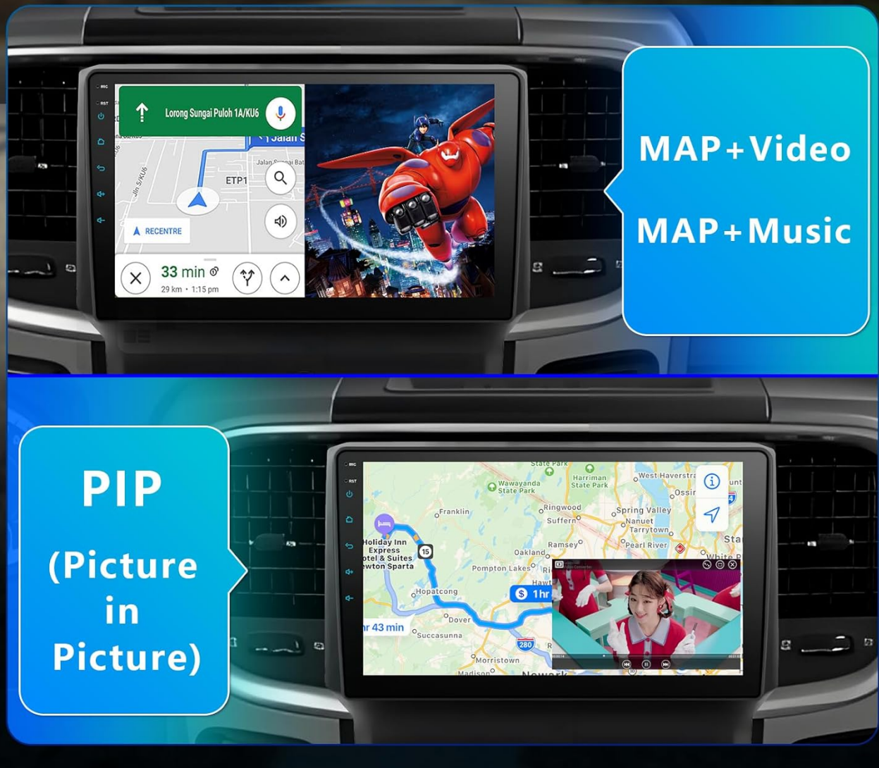
Image: The car stereo in split-screen mode, demonstrating simultaneous use of navigation and media playback.