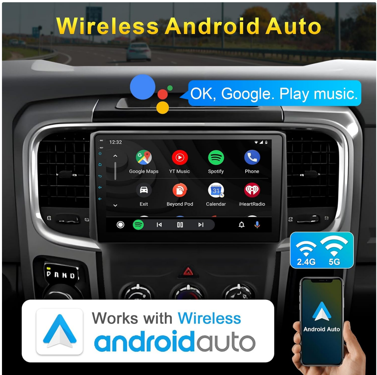
Image: The car stereo screen displaying the Android Auto interface, showing common applications like Google Maps and Spotify.