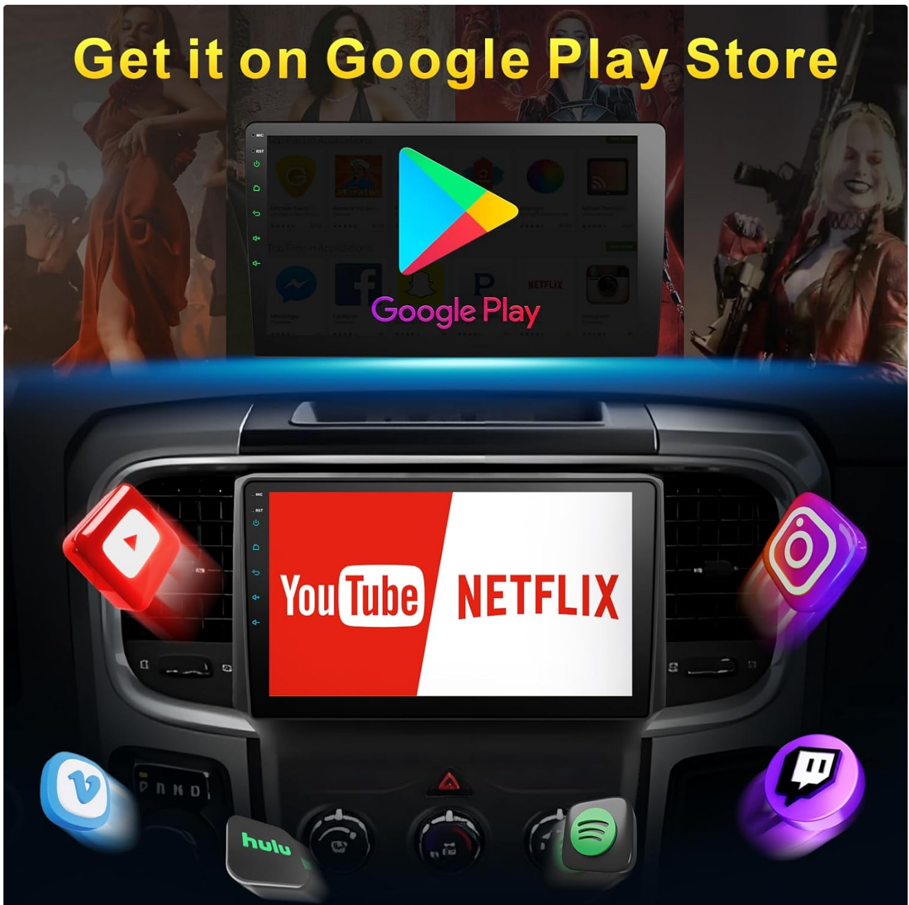
Image: The car stereo screen showcasing access to the Google Play Store and popular streaming applications.