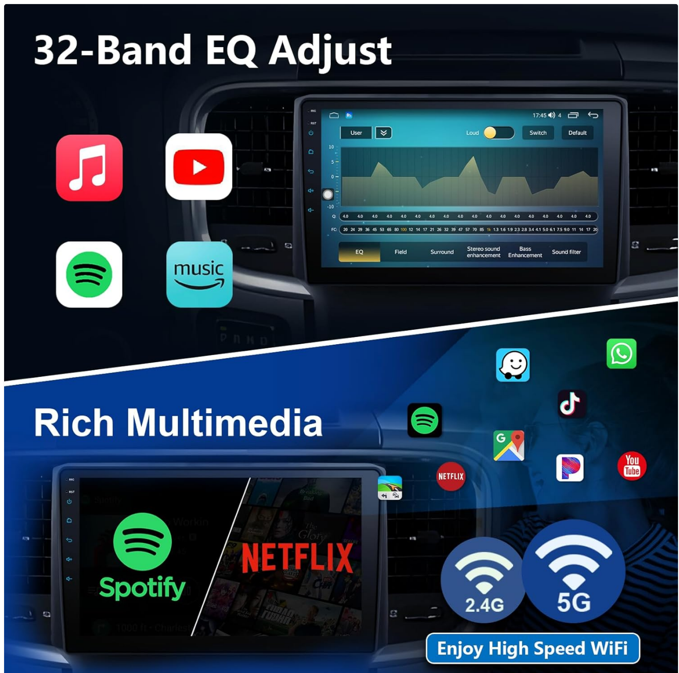
Image: The car stereo displaying the 32-band equalizer interface for detailed audio customization.

Customize your audio experience with the integrated 32-band equalizer. Adjust sound settings to match your preferences, enhancing bass, treble, and overall audio quality.