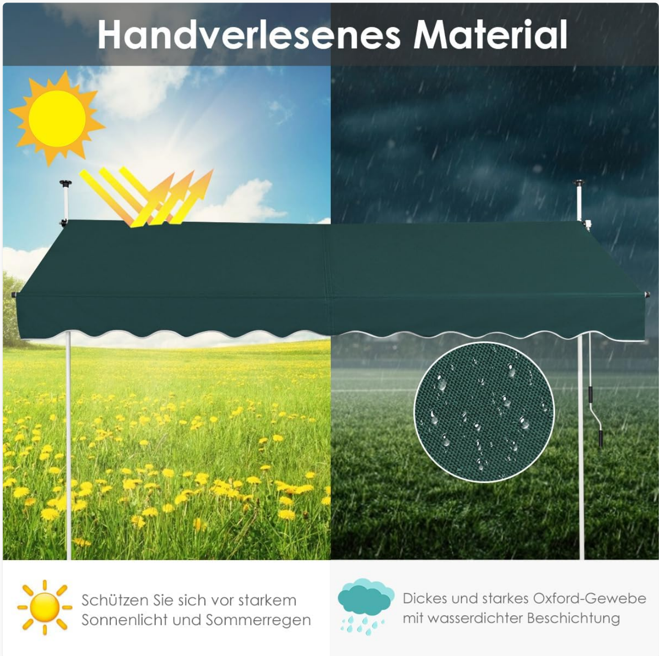
Image: The awning fabric provides protection against strong sunlight and summer rain, featuring a thick Oxford fabric with a waterproof coating.