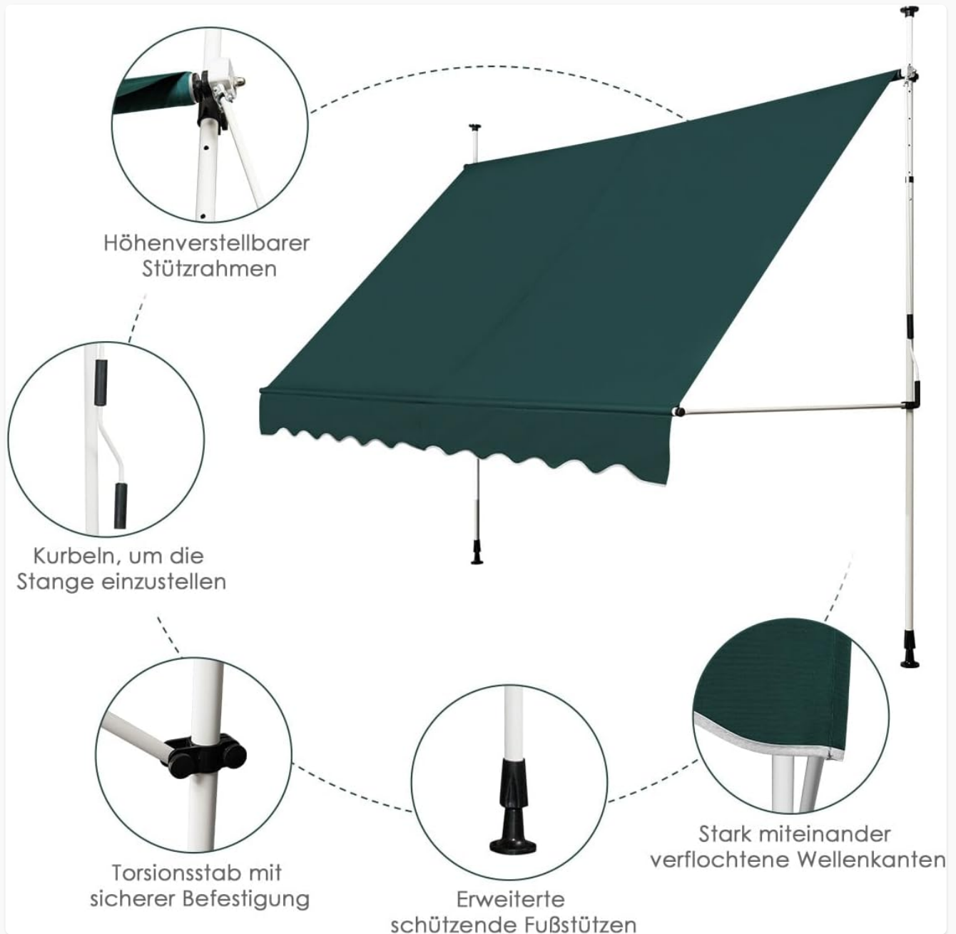
Image: Diagram illustrating the key components for assembly, including the height-adjustable support frame, cranks for pole adjustment, torsion bar with secure fastening, and extended protective footrests.