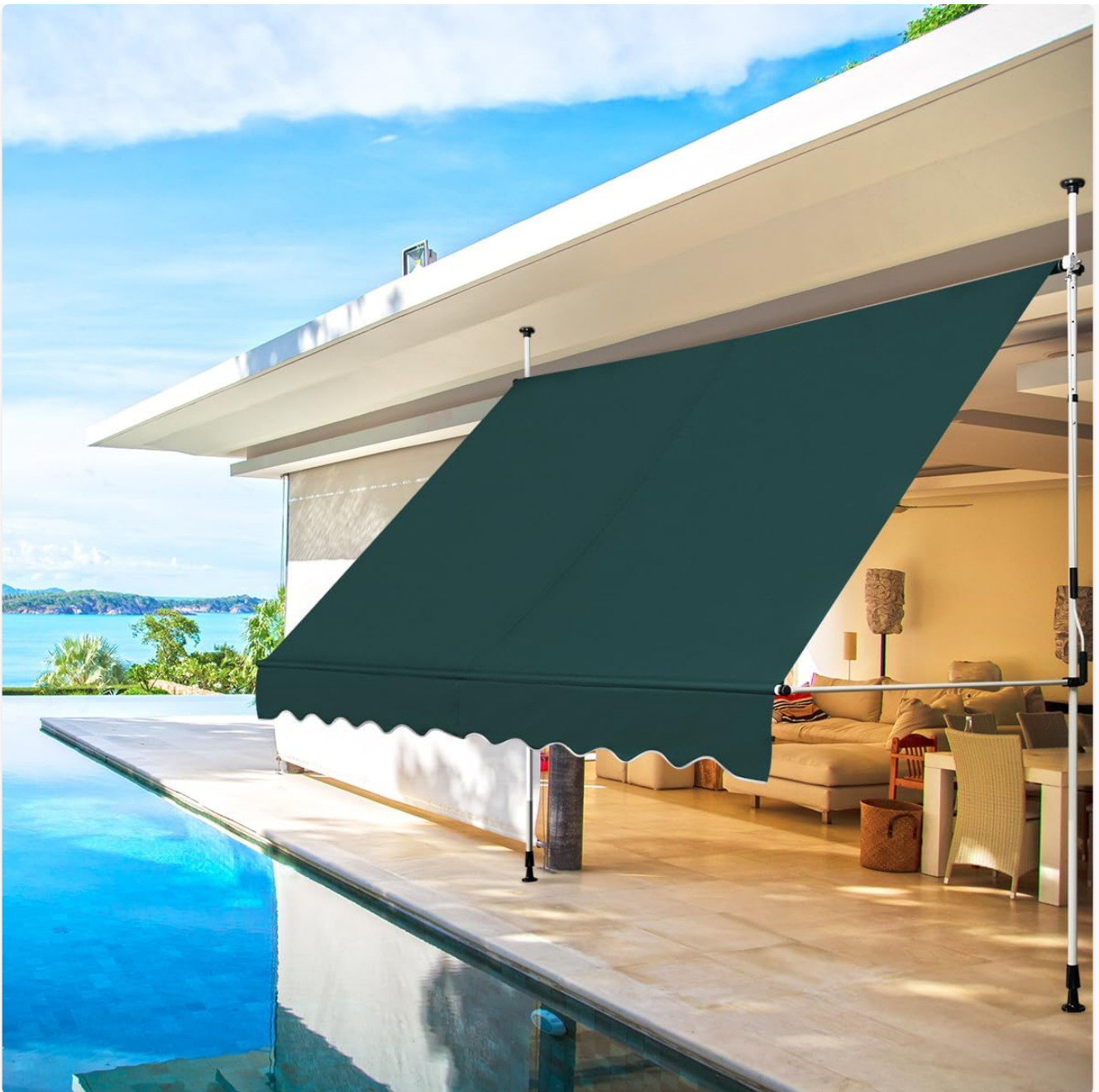
Image: The green clamp awning extended over an outdoor patio area adjacent to a swimming pool, illustrating its sun-blocking capability.