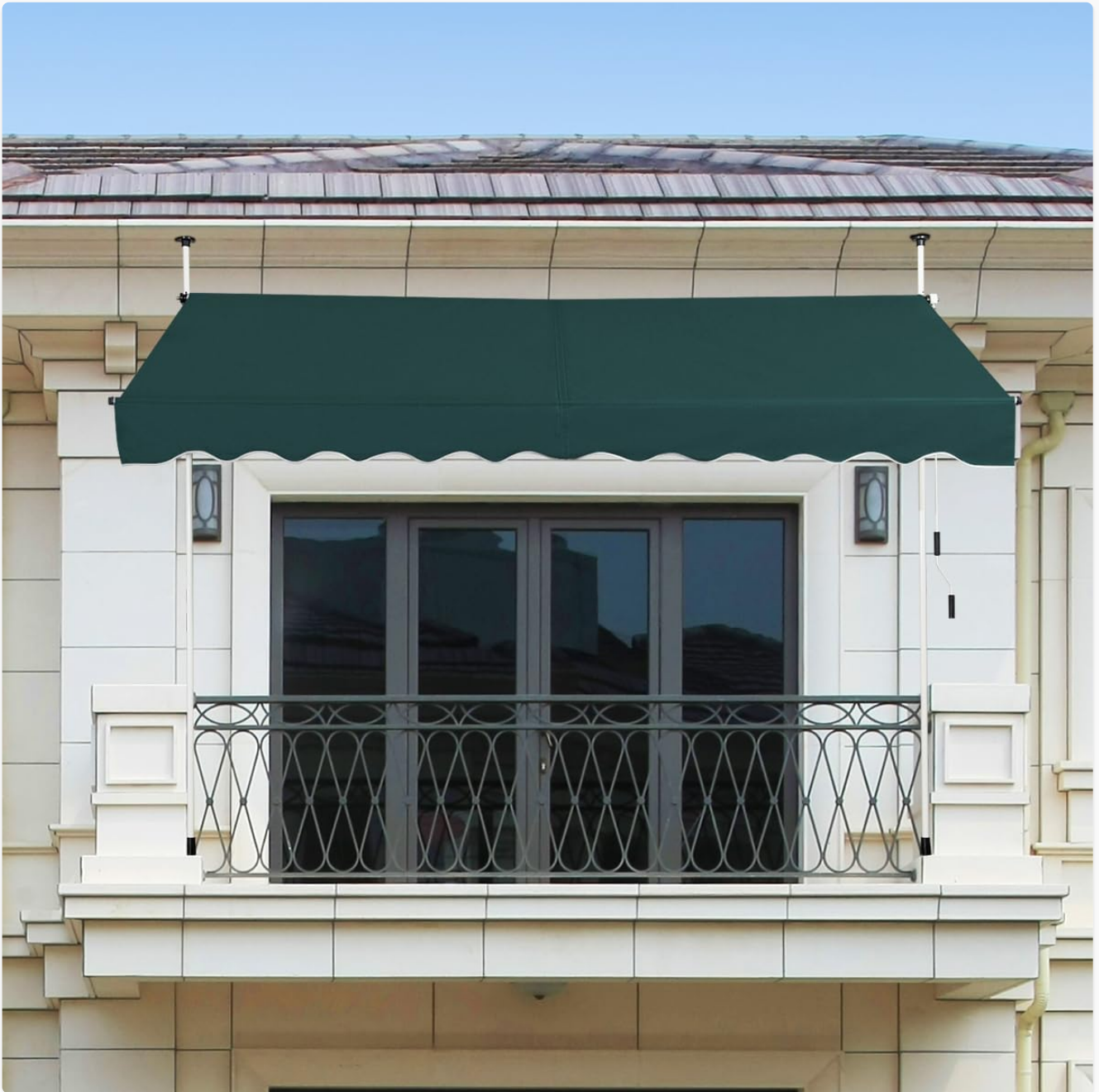
Image: A green clamp awning providing shade on a balcony, demonstrating typical usage.