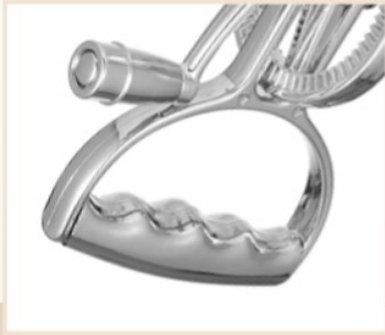
Ergonomic Waved Grip