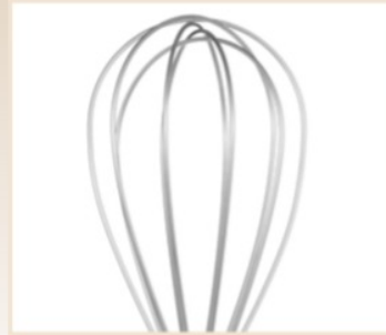
Safe & Robust Stainless Steel

Image: A person demonstrating the use of the manual rotary egg beater to mix eggs in a clear glass bowl.