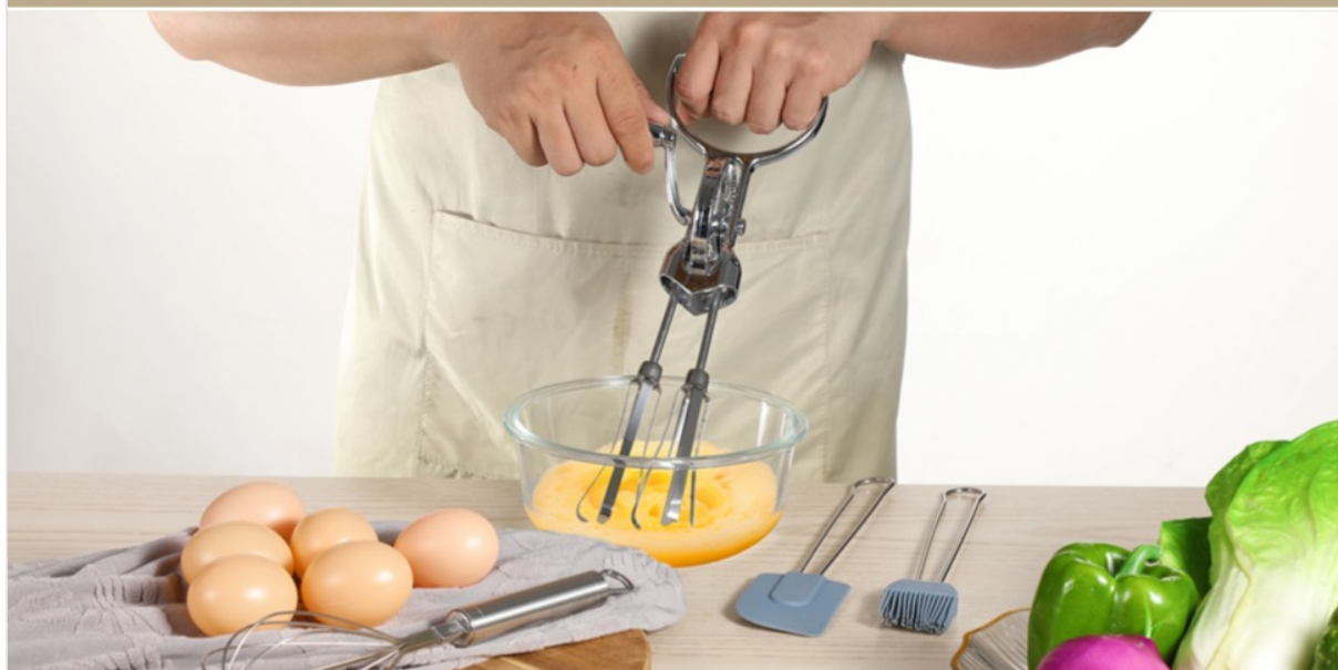
Image: Product dimensions for the rotary egg beater, whisk, spatula, and brush.

Help you effortlessly and quickly mixes eggs or batters.