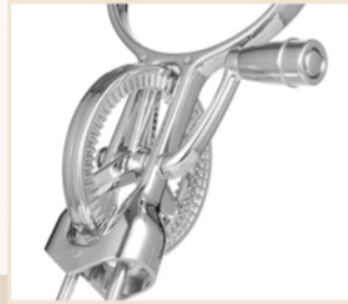
Smooth Hand Crank Handle