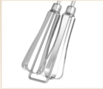
Efficient Double- head Design