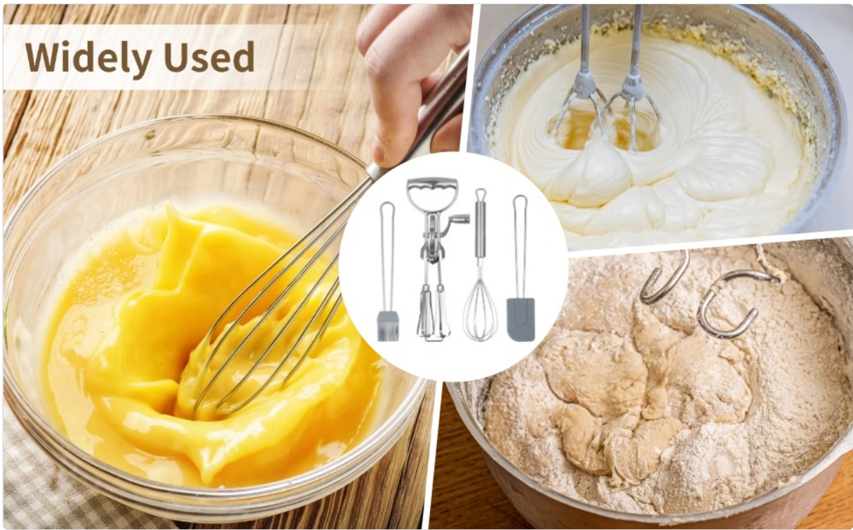
Image: A collage demonstrating the wide range of uses for the set, including whisking eggs, whipping cream with the rotary beater, and mixing dough.