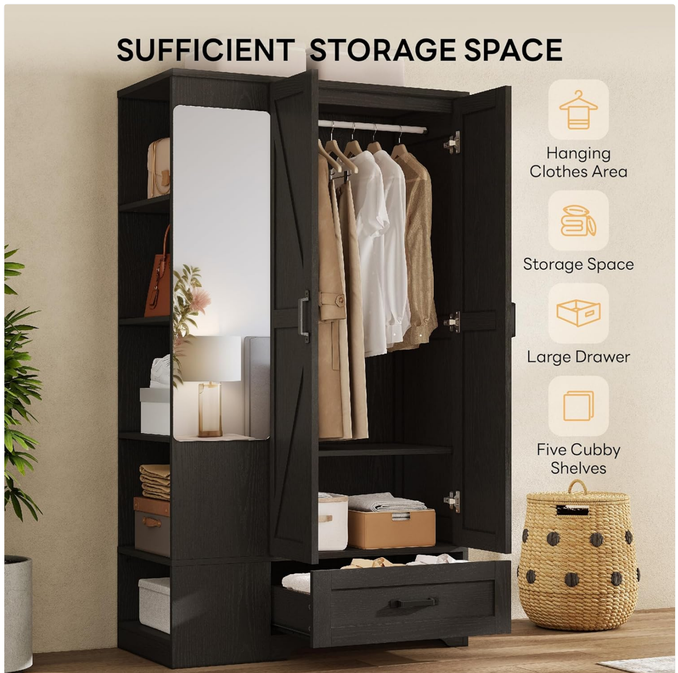
Figure 2: Overview of the wardrobe's internal storage features.