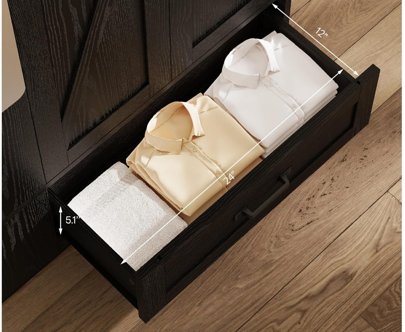
Figure 6: The spacious drawer for storage.