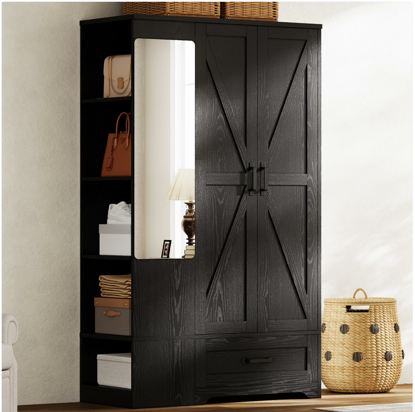
Figure 1: Front view of the LIKIMIO Armoire Wardrobe Closet.