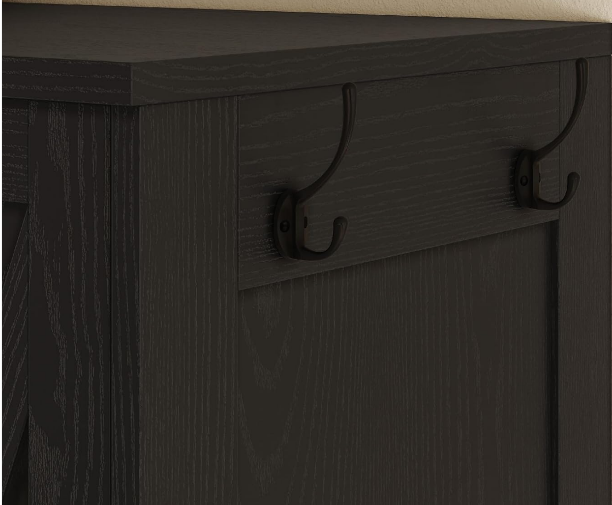
Figure 7: The convenient side hooks.