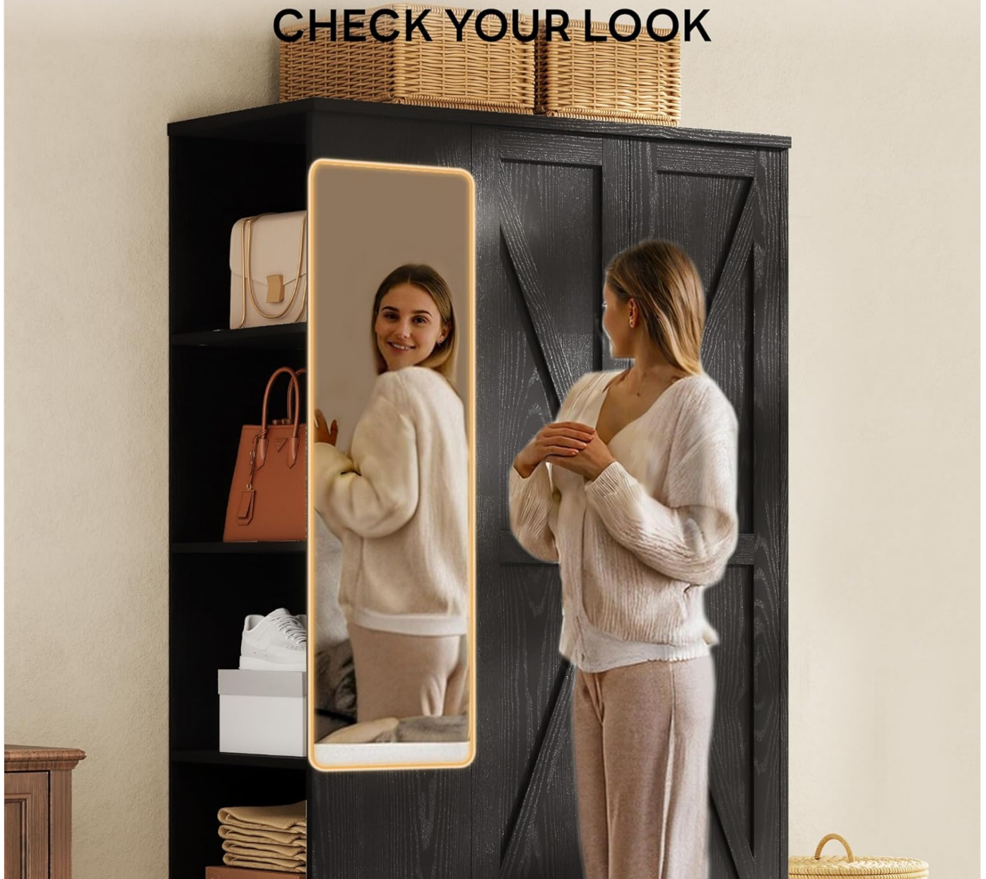
Figure 5: Using the built-in mirror.