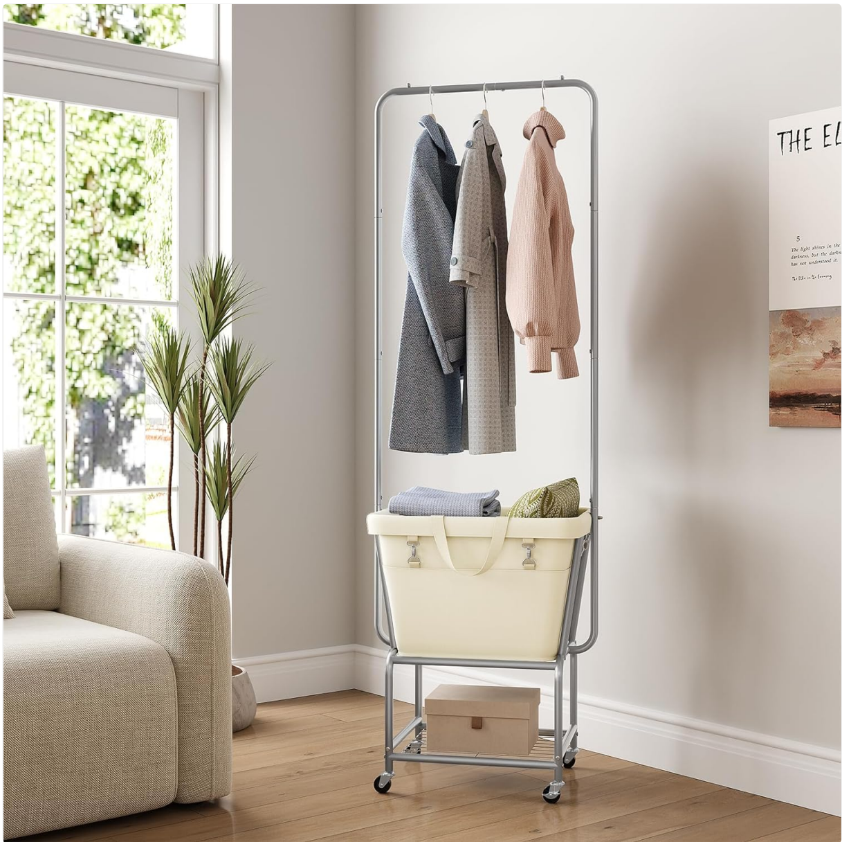
Image: The ELYKEN Laundry Cart with Clothes Rack (HLC08M1) in a living room, showcasing its design and functionality.