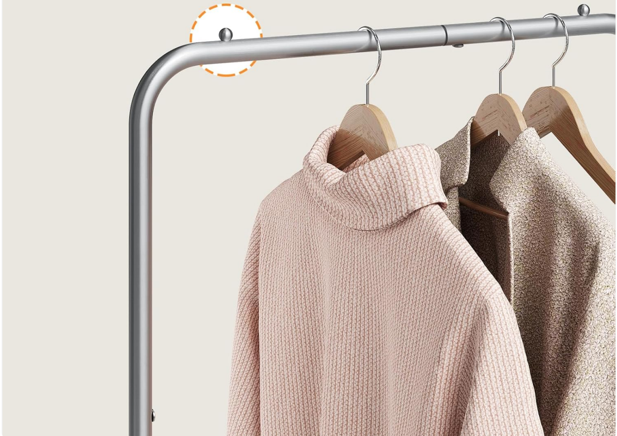
Image: Detail of the anti-slip ball design on the clothes rack, intended to prevent hangers from slipping.

Prevent hanger from slipping from the rolling laundry cart