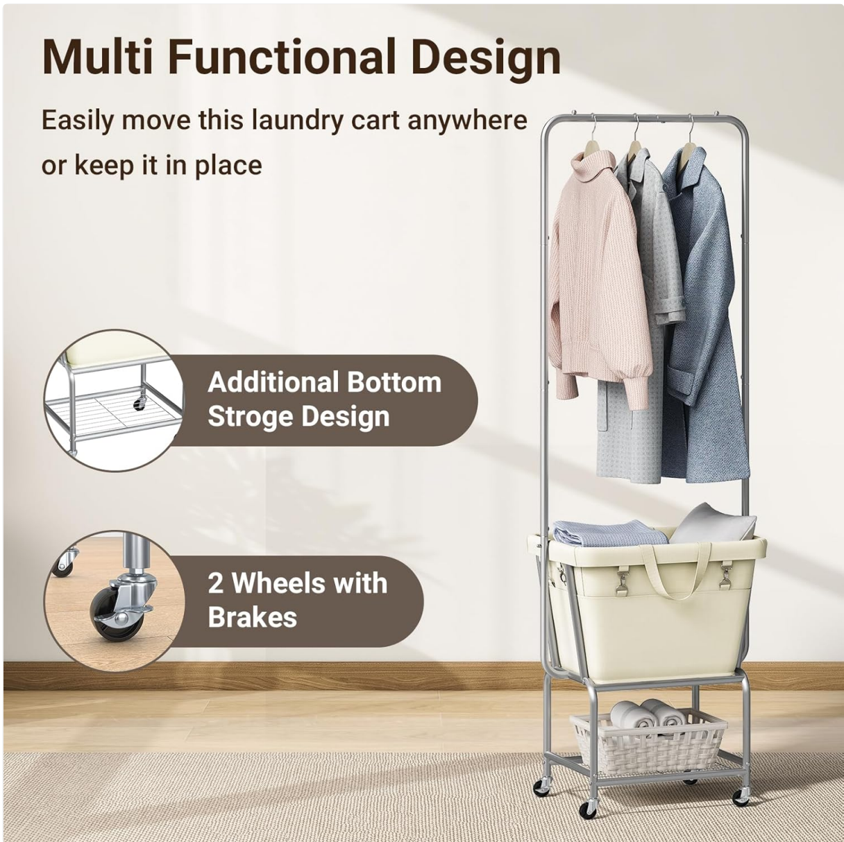
Image: Close-up view of the ELYKEN Laundry Cart's multi-functional design, highlighting the additional bottom storage shelf and the casters, including those with brakes.