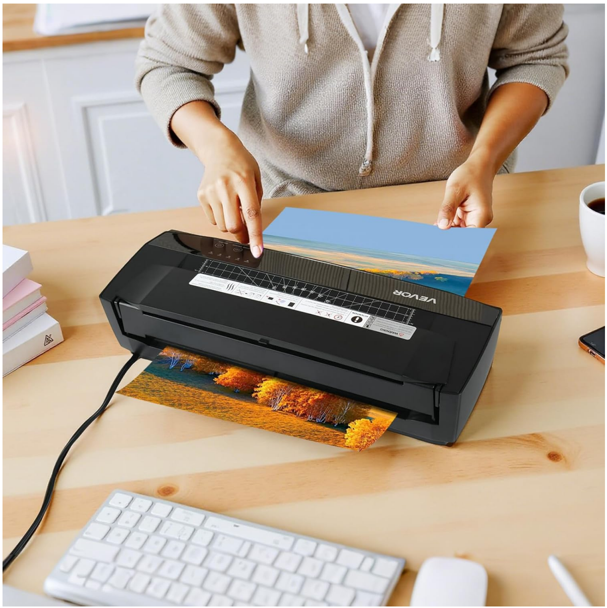
Image: A user demonstrating the process of feeding a document, enclosed in a laminating pouch, into the VEVOR laminator machine.