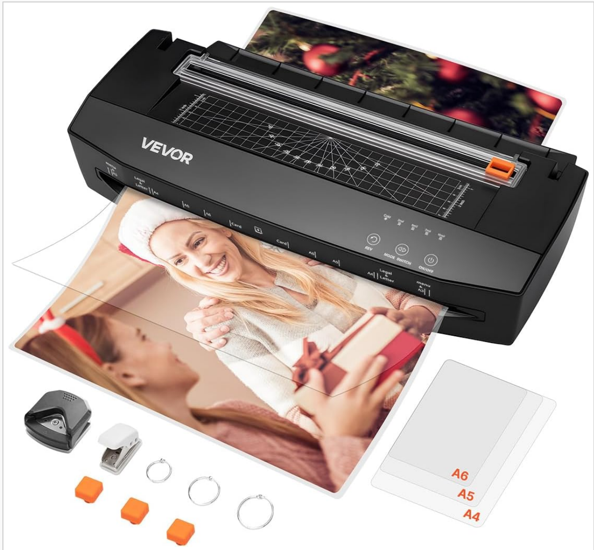
Image: VEVOR SL6319 Laminator Machine shown with its various accessories, including laminating pouches, a corner rounder, hole punch, and paper cutter, alongside laminated documents.