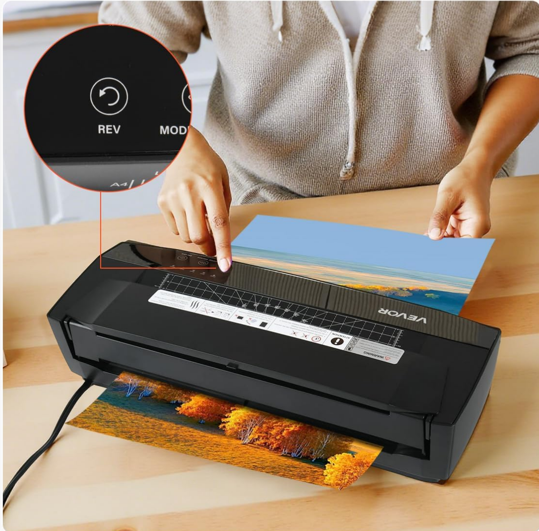
Image: A hand pressing the ABS button on the laminator's control panel, demonstrating the one-touch jam release feature.

Lightly Touch the ABS Button to Quickly Remove the Film