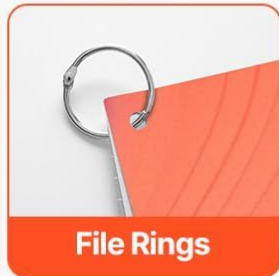
Image: A detailed view of the accessories provided with the laminator, highlighting the corner rounder, hole punch, paper cutter, and file rings.