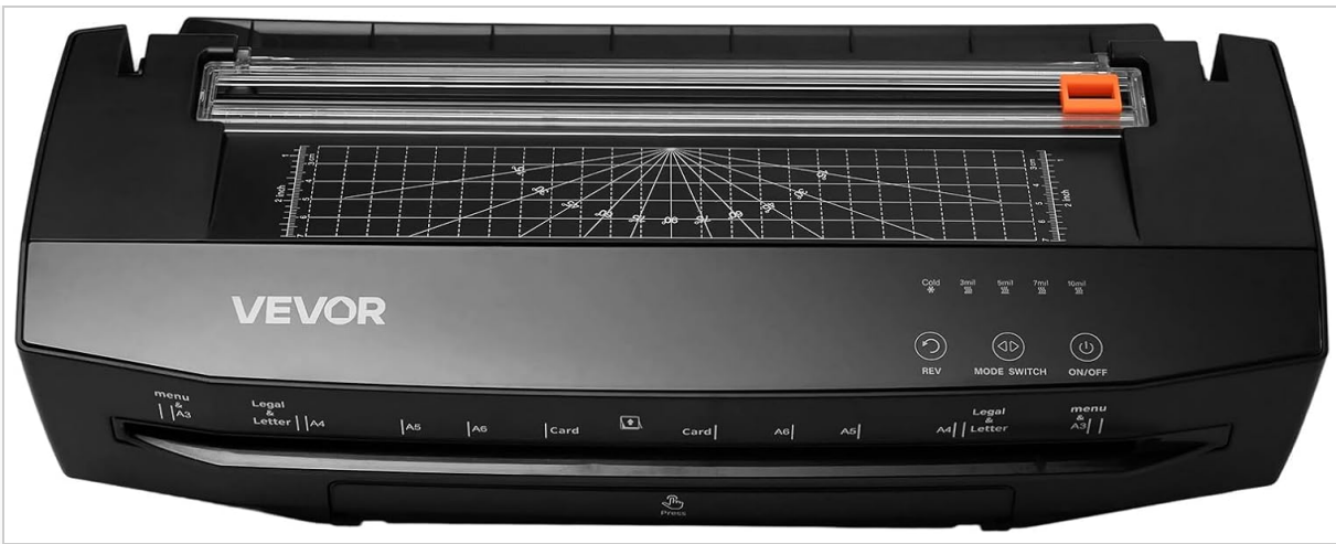
Image: Top-down view of the VEVOR SL6319 Laminator Machine, illustrating the control panel with buttons for reverse, mode switch, and power, along with paper size guides.