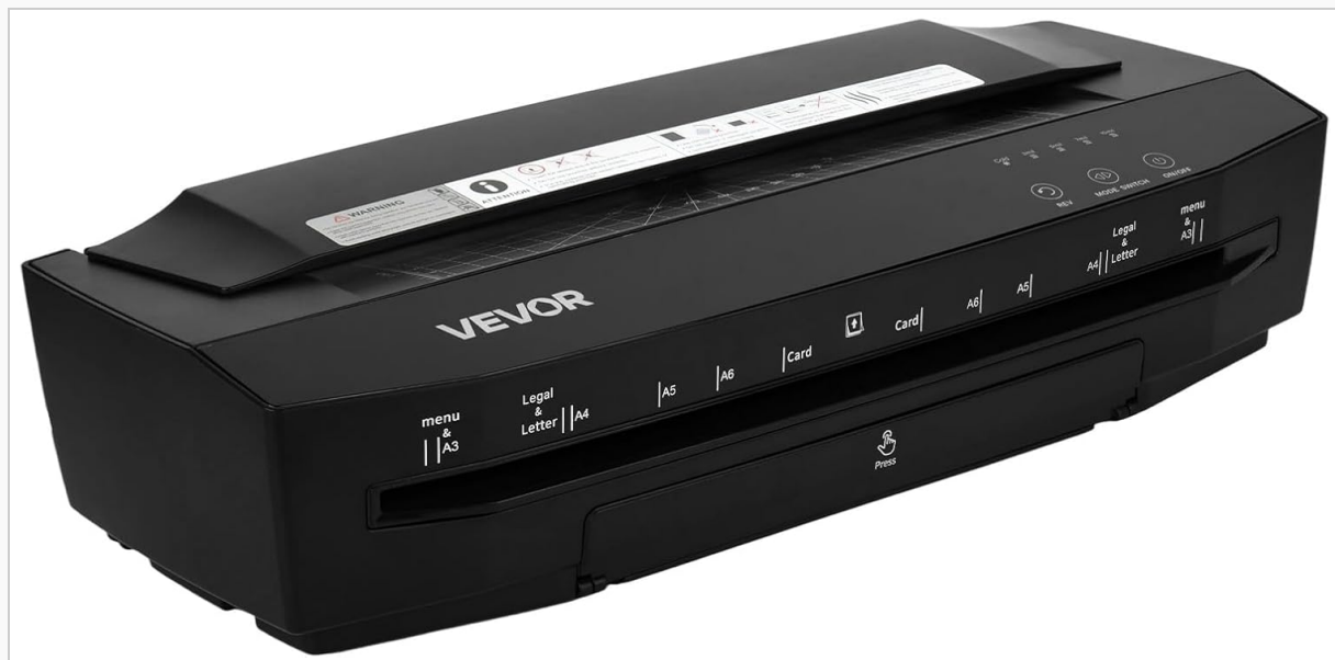
Image: An angled view of the VEVOR SL6319 Laminator Machine, showcasing its sleek black design and compact form factor.