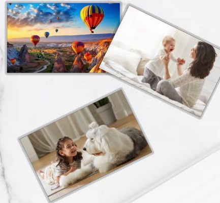
Image: Illustration of the laminator's compatibility with A3, A4, A5, and A6 paper sizes, detailing a maximum lamination width of 12.6 inches (320 mm) and a thickness range of 3-10 mil.