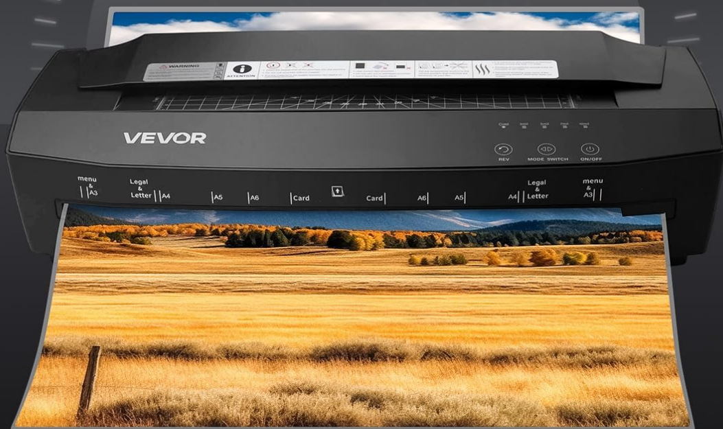
Image: The laminator displaying its rapid performance with a 1-minute preheat time and a laminating speed of 39.4 inches per minute.